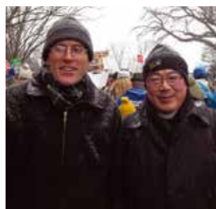
(Far Left) March for Life in Washington, D.C.