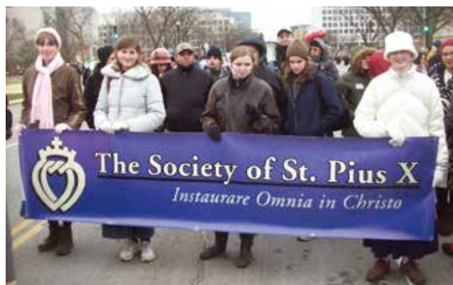
(Below) The SSPX group at the march