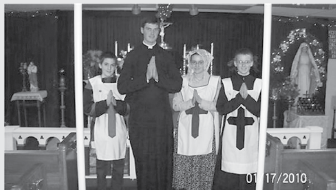
The newly-promoted crusaders pose with their pastor and chaplain after Mass.