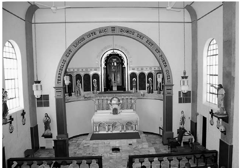
The presently decorated chapel prepared for confirmations. Note how the main arch pulls the eye towards the altar, a classic aspect of an ancient Roman basilica. Unfortunately, this black and white photograph does not do justice to the coordinating colors.