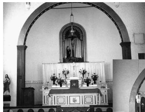
The sanctuary as it appeared in 1997 before the first set of renovations.