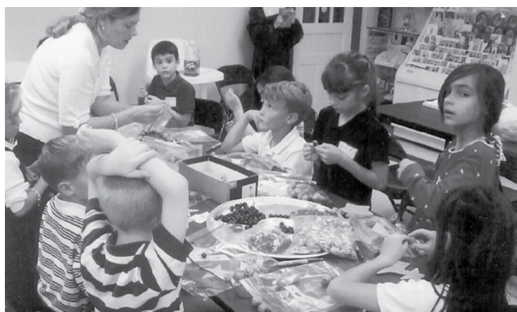
During the Crafts club, some younger children are shown how to put together a bead mobile.