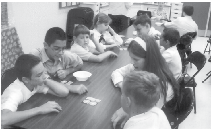
A picture of a game-test during the Math club.