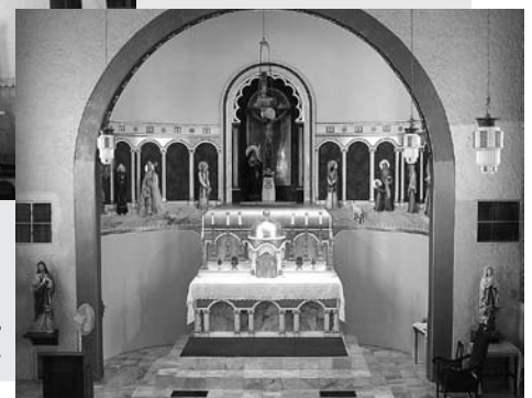
This circa 2006 picture shows the sanctuary upon completion of the new marble flooring, predella, altar and apse mural.