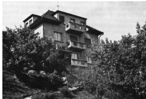
The Don Bosco House in Fribourg, Switzerland, which Archbishop Lefebvre leased for a short time before obtaining the seminary property in Ecône.