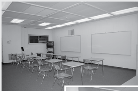
One of the two classrooms that the building accommodates.