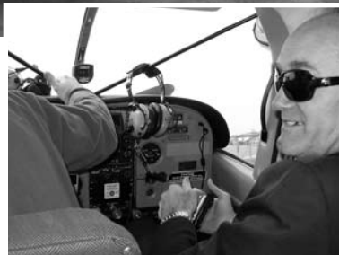
A view of Bishop Fellay during the three-hour, one-way flight from Anchorage's international airport to Mt. McKinley, a distance of 350 miles. A stop was made in Talkeetna, where climbers meet before leaving for the base camps to start their ascents.