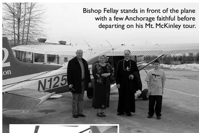
Bishop Fellay stands in front of the plane with a few Anchorage faithful before departing on his Mt. McKinley tour.

One of the highlights of his visit was a chartered flight to see Mt. McKinley. Before departing, the charter company pointed out to His Excellency the route they would be flying. Bishop Fellay commented that the mountains in Switzerland were higher and more rugged (Anchorage is surrounded by small mountains which unbeknownst to His Excellency the locals refer to as "hills"). The man at the charter