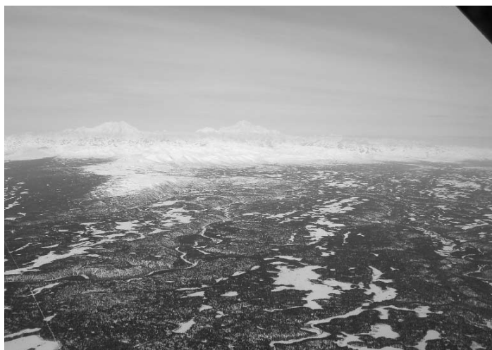
One of the many pictures of the breathtaking view of Mt. McKinley that Bishop Fellay took during the flight.

company replied that in about an hour the bishop would see which mountains were bigger and more rugged! During the