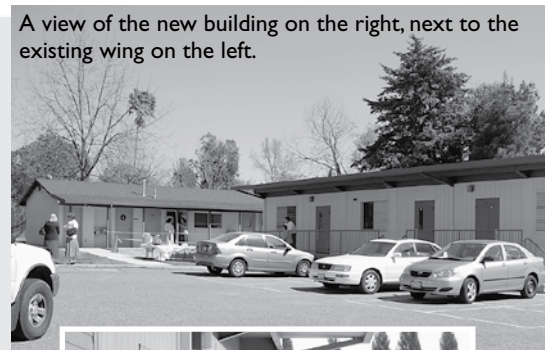
A view of the new building on the right, next to the existing wing on the left.