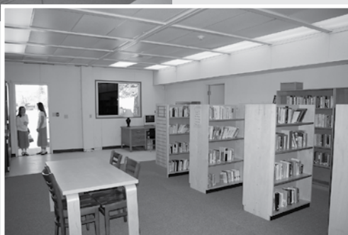
This interior view shows the academy's new and well-appointed library.