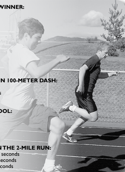
Here two of the Post Falls' boys exert themselves to take the lead in the 100-meter dash.