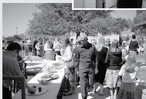
After Mass and the academy's blessing, parishioners enjoy some breakfast including muffins, orange juice and of course, coffee!