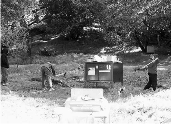
Cutting firewood with an axe provides an excellent opportunity for young men to get a taste for male conquest which further gives them the strengthen necessary for dwelling in the forest (as well as for the supernatural life).