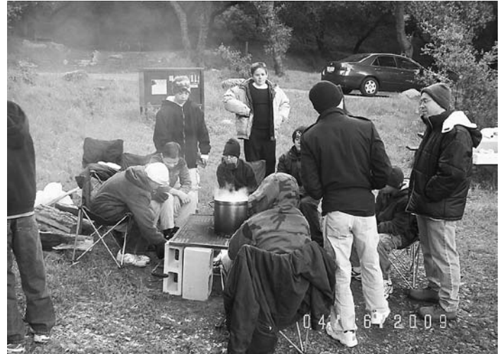
The boys warm up by the fire before attending Mass. A bear box (a reinforced storage container for food) can be seen in the background. The boys learned to lock up their food at night to keep the bears from eating it during their nightly scavenging expeditions.