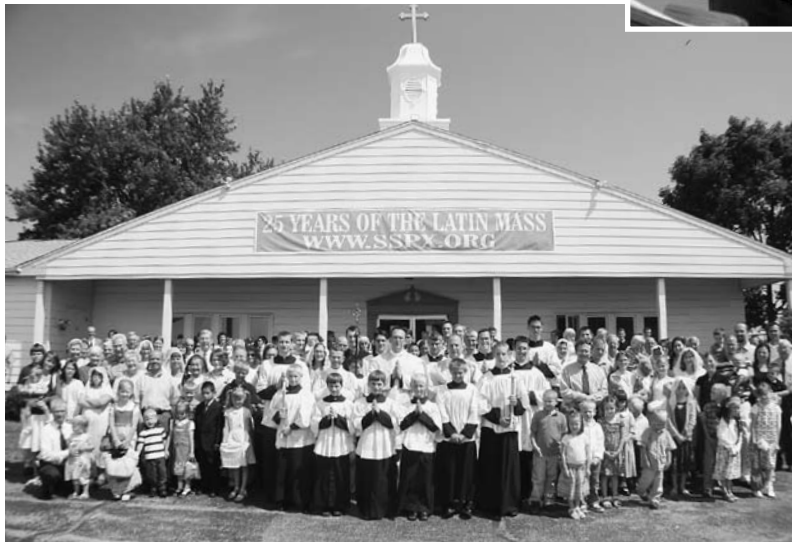
After Mass, the faithful of both Indiana chapels pose with the sacred ministers and servers after Mass in front of St. John Fisher Church.