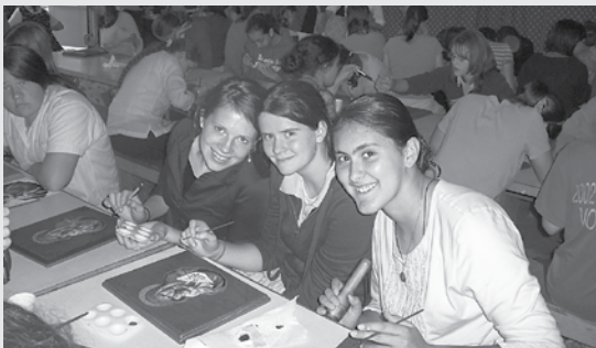
A view of the girls making their Marian plaques.