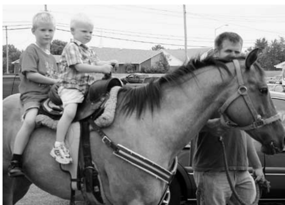
The jubilee activities for the children included horse and pony rides, a petting zoo, games and an inflated castle to bounce around in.