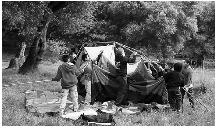
Here the boys work as a team to raise a tent for their dwelling.