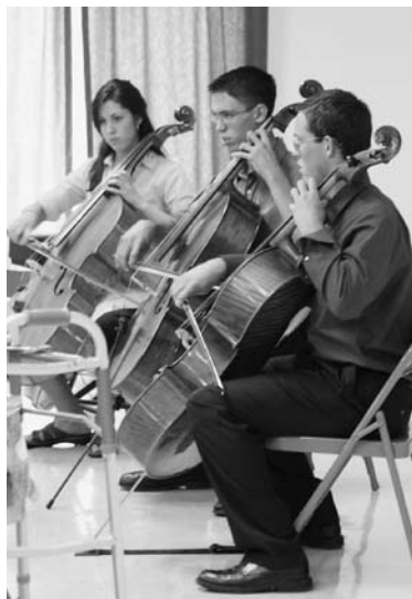
Several music recitals were also given in the parish hall, including this trio of strings and a piano duet by a pair of ladies.