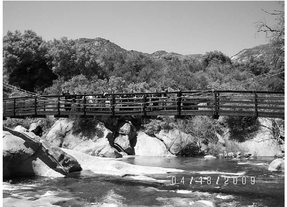
The boys pose for a picture with Fr. Ward on a trail overpass that enables an easy crossing of the swift moving river below.