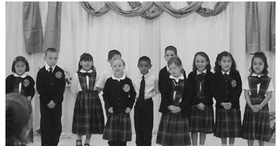
The 1st grade class here recites several poems.

In addition to displaying in the school hall treasured