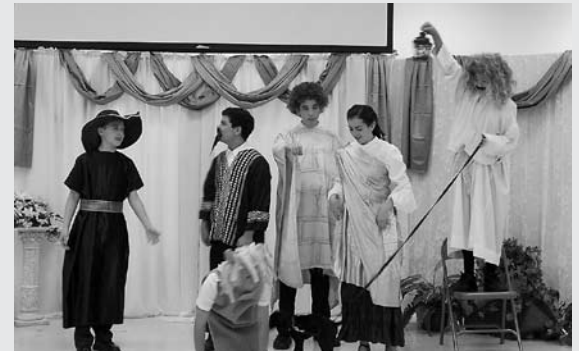
Here a band of actors and actress make an attempt to entertain the wedding party. Moonshine looks down upon Thisbe and Pyramus separated by a tall wall (with arm stretched forth), which they wish was not present between them.