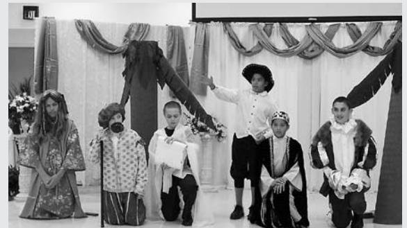
All those who had been shipwrecked are united as Antonio, the brother of Prospero, gives his final words.