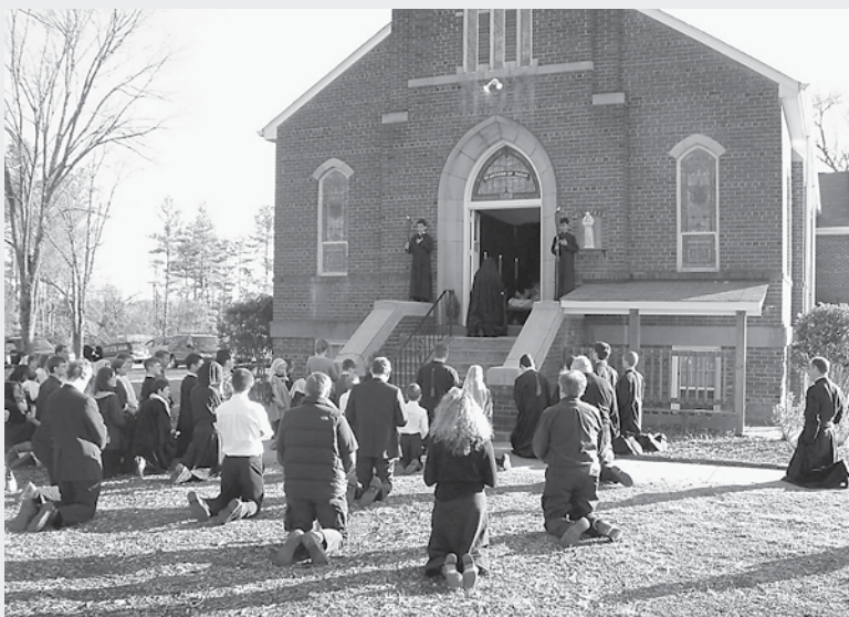
Arriving at the front porch of the church, the statue is laid in the vestibule, while on the top step Our Lady contemplates the Passion of her Son, and 2 acolytes give a silent, but watchful vigil with torches.