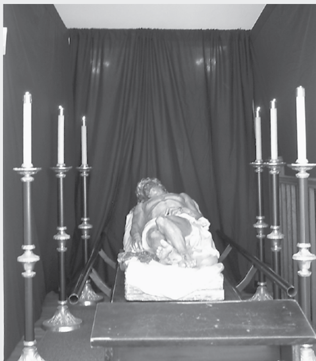
An inner picture of the vestibule, showing the casket candles and black drapery used to curtain off this room from the rest of the church, which provided a fitting funerary backdrop.