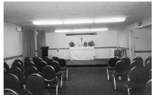
A view of the temporary chapel prepared in one of the conference rooms.