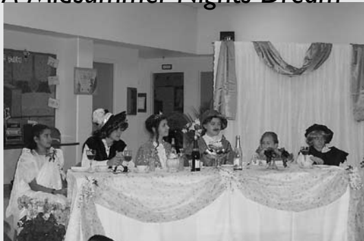
Here the 8th grade students enact an excerpt from A Midsummer Nights Dream , another Shakespearean classic. Here are the three happy wedding couples that have requested that a play be performed in their presence.