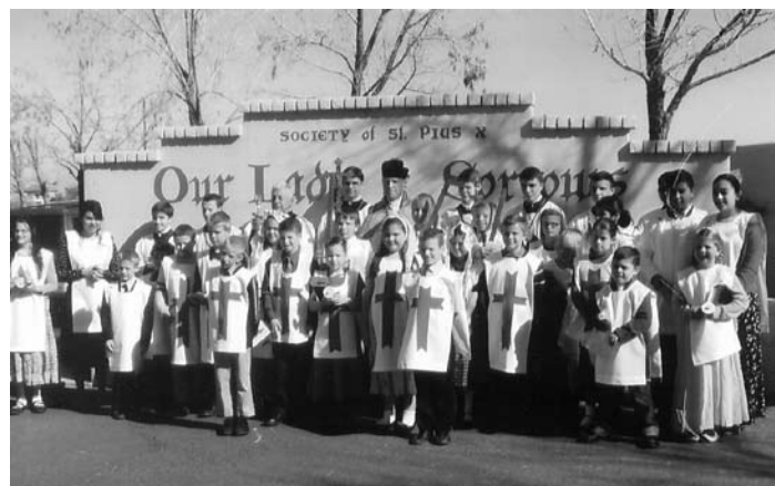
A group photo of the various ranks of Crusaders, their pastor, and the altar servers who were involved in the ceremonies.