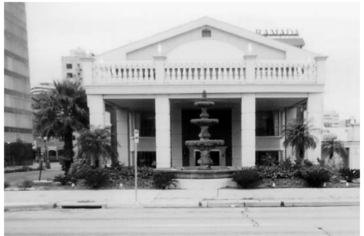
Though the chapel is in a hotel, it is this elegant Mission-style exterior of the Bay Front Inn that greets the faithful, a reminder of what possibly can be in the future for the mission.