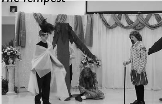
The 7th grade students put on an excerpt of William Shakespeare's comic play, The Tempest . Here Ariel (a spirit) speaks to Prospero about the tempest in the sea. Miranda, Prospero's daughter, has been magically put to sleep.