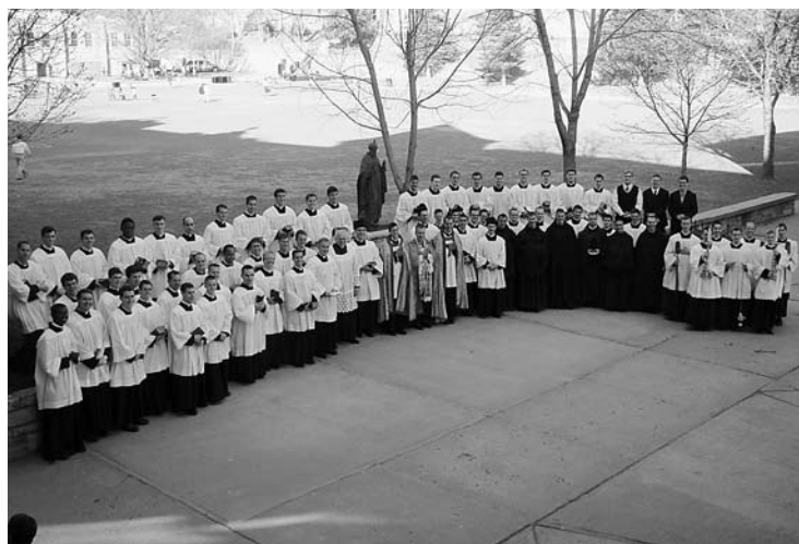
After Vespers and Benediction, the seminary visitors posed for a picture in the small courtyard of St. Jude, situated at the chapel's front door.