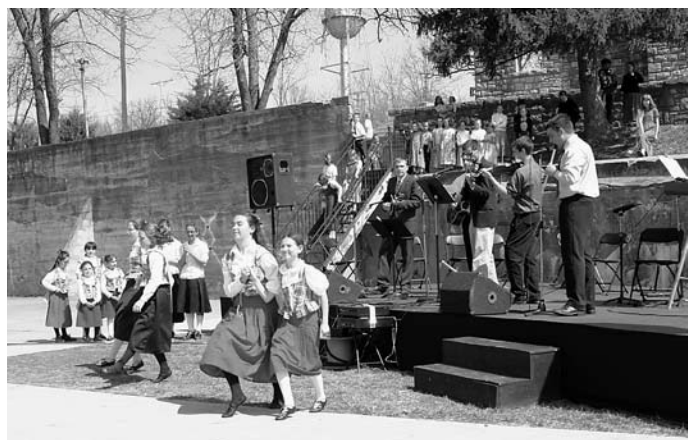
Catholic cultural music was also provided, and here some girls demonstrate their Celtic dancing skills while on stage, a group of talented young men provide the tunes.