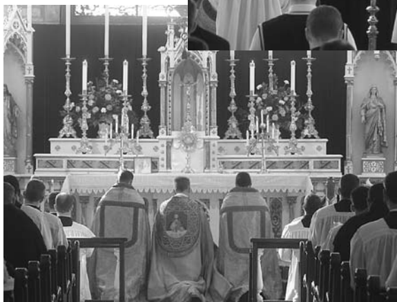
With Vespers completed, the altar was quickly set up for Benediction of the Blessed Sacrament.