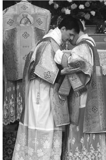
One of the touching actions seen during solemn form of Mass, is the liturgical Pax, or kiss of peace, in which the clergy and religious show their mutual charity for each other. Here the deacon gives the Pax to the subdeacon, who in turn will give it to the clergy to pass on amongst themselves.