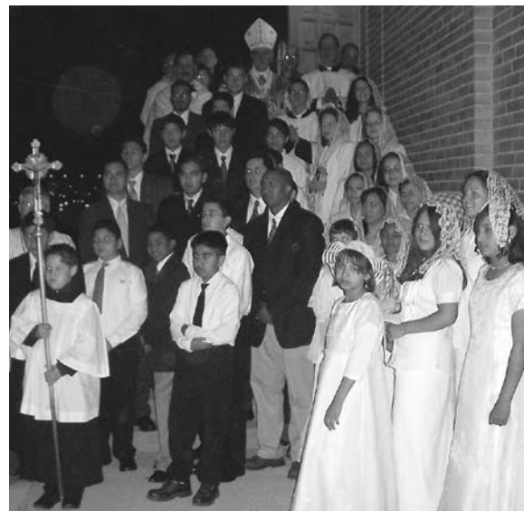
A group shot of the confirmands standing on the church's front steps after the evening ceremonies.