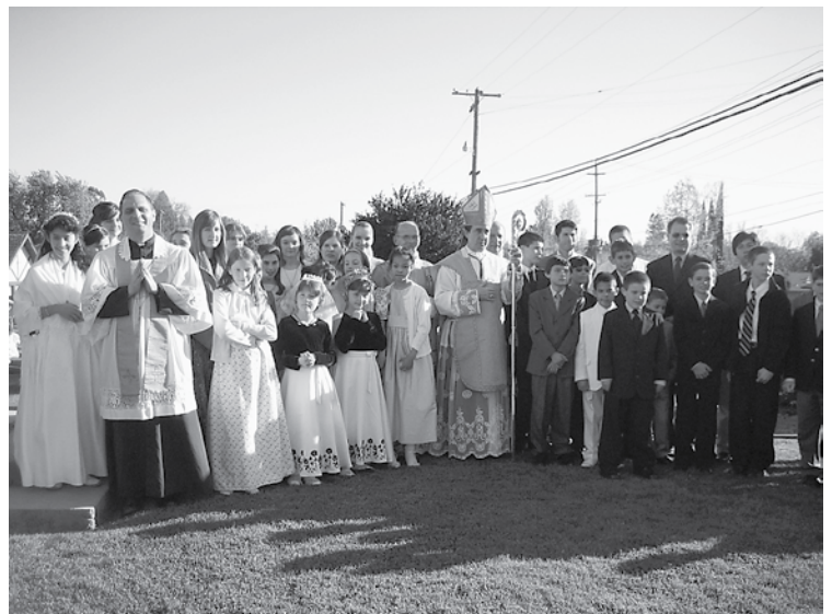
After the ceremonies, the new confirmands pose with the bishop and other priests.