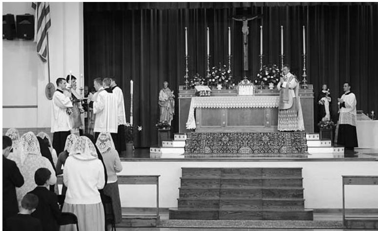
The solemn chanting of the Gospel, in which Our Lord declares that He is the Good Shepherd and His sheep know Him.