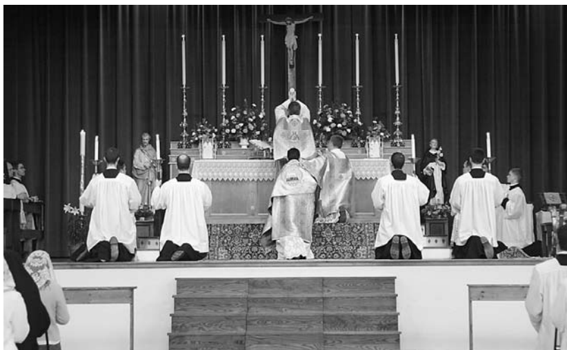
The climax of the Mass, the Elevation of the Sacred Host just after the words of consecration.