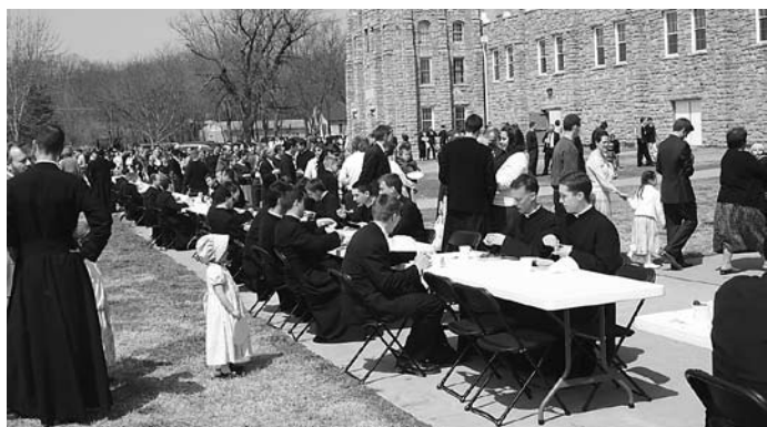
The youthful seminarians wasted no time in partaking in the various culinary delights provided by the parishioners.