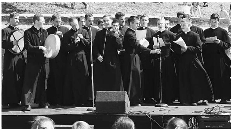
In gratitude to St. Mary's for their hospitality and to the delight of the faithful, the seminarians themselves performed a variety of Celtic and American folk tunes.