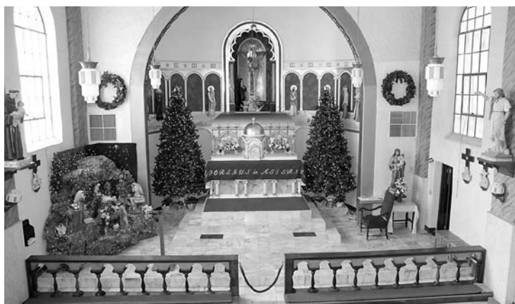
A view of the tasteful Christmas decorations that were arranged in the sanctuary of Jesus and Mary Church, formerly the convent chapel of the Mexican Jesus and Mary Sisters who had fled to El Paso during the Freemasonic persecution in Mexico in the 1920's.