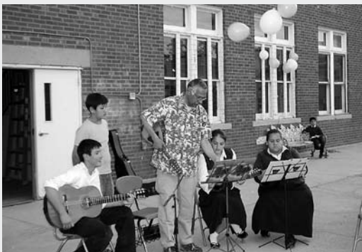
Here the homegrown local chapel talent plays to the delight of the parish.