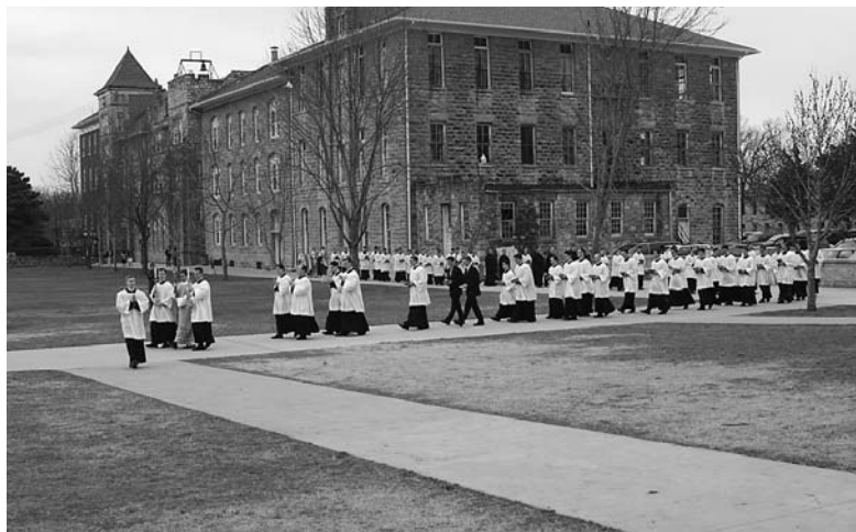
Processing from the Assumption Chapel, the long liturgical procession of clergy and religious makes its way to the gym building for the Holy Sacrifice of the Mass.