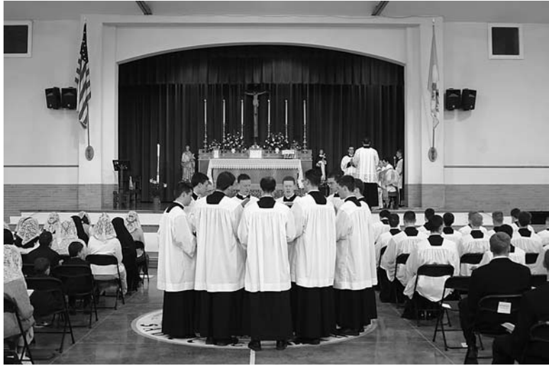
A view of the seminary schola arranged in a circle in front of the sanctuary while chanting one of the Mass propers.

The seminary visit had the effect of reassuring the faithful of the continued fulfillment of the SSPX's object, to form holy priests, while giving all the opportunity to interact and continue to solidify the family of Catholic Tradition that the Society nourishes within its missions.