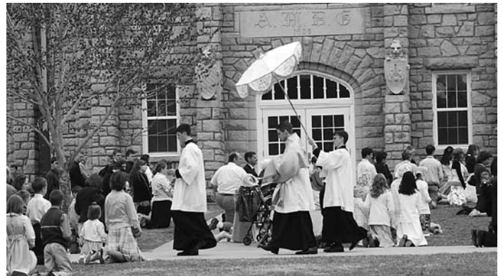
A common scene at Winona itself after the summer ordinations ceremonies, here we see the transfer of the Blessed Sacrament to the tabernacle in the main chapel complete with bells, candle and umbrellino, a small umbrella-like canopy used because of Our Lord's sacred dignity.