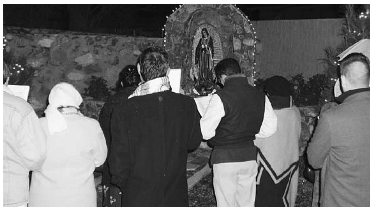
In the early morning hours of December 12th, the Feast of Our Lady of Guadalupe, Empress of the Americas, some of the faithful gather in the parish's quadrangle to sing Las Mañanitas , or "morning songs" to Mary to commemorate her dawn appearance to Juan Diego.