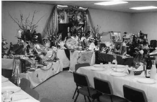
A view of the elegantly prepared St. Joseph's Table in the parish hall of St. Margaret Mary Church.

On Sunday, April 6, St. Margaret Mary Church held its St. Joseph's Table, which raised $1700 for the construction of a stone grotto in front of the chapel to be dedicated to both the Sacred Heart of Jesus and the parish's patron.