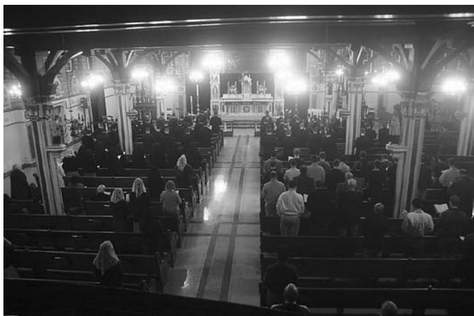
Taken from the choir loft during Sunday morning Lauds, here we can see the large group of cassocks from the seminary arranged in the front pews.

On Good Shepherd Sunday, April 6th of this year, the Assumption Chapel in ST. MARY'S, KS hosted St. Thomas Aquinas Seminary, following a practice begun last year in the United States District at Immaculate Heart of Mary Church in St. Paul, MN. The purpose of the seminary's visit was to encourage religious vocations amongst the parish and the faithful to continue in their prayers and generous sacrifices for such vocations, as well as to give the seminarians a glimpse of what their future priestly ministry will consist.