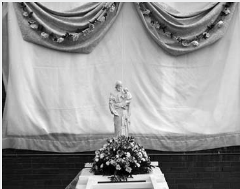
The statue of St. Joseph on its decorated procession bier.

The chapel of Jesus and Mary held a procession and pot luck banquet in the parish complex's quadrangle to honor St. Joseph, which included live musical entertainment.