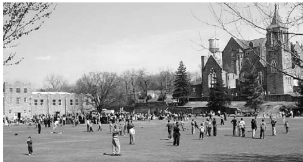
Facing the Immaculata Chapel and Bellarmine Hall, some of the young men partake in a sports activity.