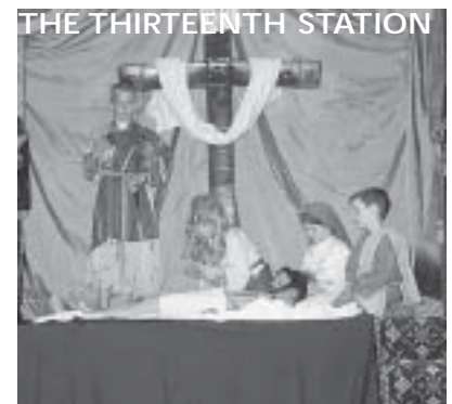
THE THIRTEENTH STATION

Jesus dies on the cross, while Our Lady and St. John (on the right) stand and watch, St. Mary Magdalene (kneeling) weeps, and an angel on the left with a chalice waits.