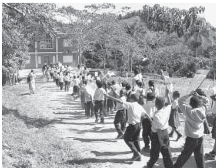
Here we see some of the students processing to their school while proudly celebrating their country’s national holiday on February 27th, celebrating their independence from Haiti in 1844.

An additional boon is that the Child Jesus School is sanctioned by the Dominican Republic, and its education program is of such a high caliber that not only has the government inspector warmly approved, but even expressed that he would like to enroll his own children there!