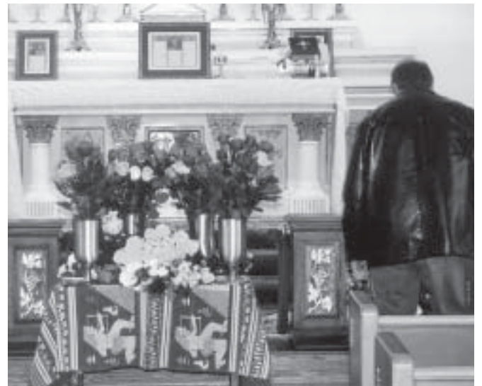
Bishop de Zumarraga had asked for a single Castilian Rose as a sign that the Catholic evangelization of Mexico would be successful. Our Lady complied by not only sending him during the middle of winter a tilma full of the non-indigenous flowers in full bloom, but also her miraculous imprint full of symbolic meaning for the Indians!