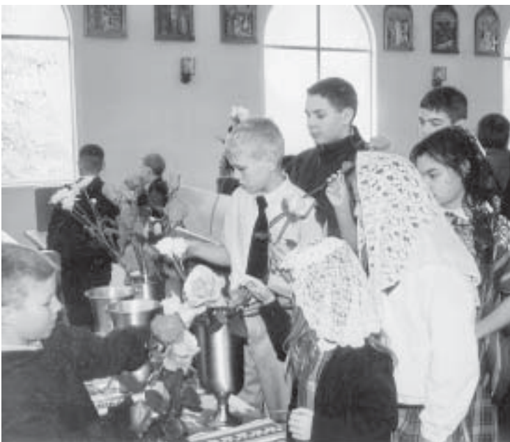
In thanksgiving for Our Lady's intercession, beautiful roses are presented to her by all.