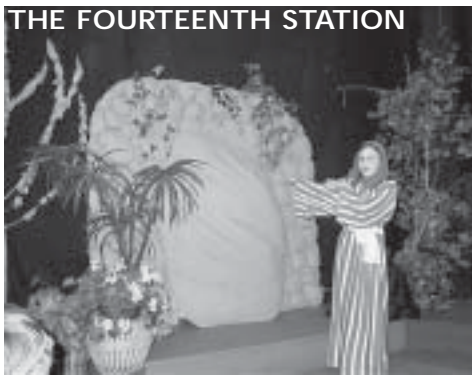
Jesus is laid in the sepulcher, the stone opening is closed and all withdraw.