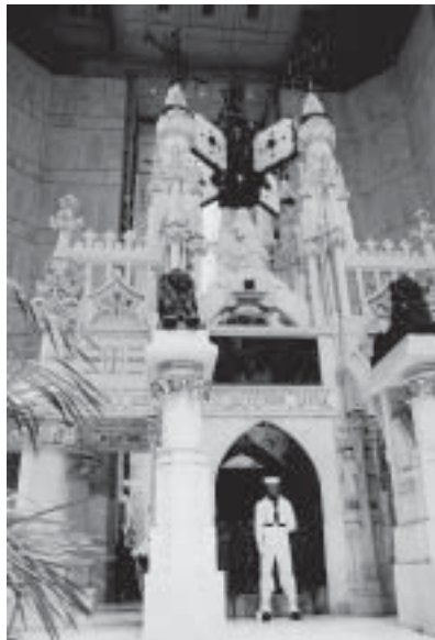
The limestone exterior of the Cathedral of Santa Maria la Menor. Completed in 1540 and raised by Pope Paul III in 1542 to the status of a cathedral, it was the first such in the New World.