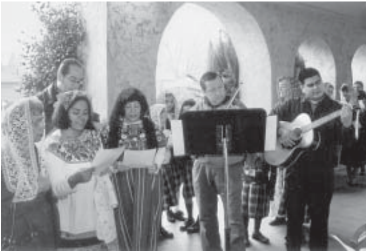
With guitar and violin to provide accompaniment, the traditional Mañanitas are sung with typical Mexican gusto.