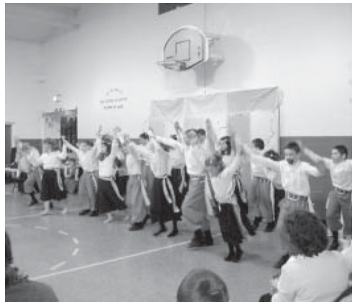
The boys and girls from 4th to 8th grade then joined for another well-performed Ukrainian dance.