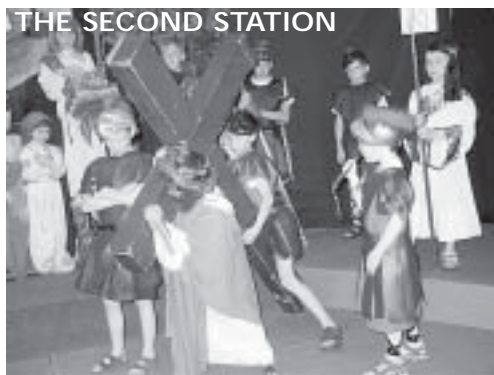
THE SECOND STATION

REGINA COELI HOUSE, 2918 Tracy Ave., Kansas City, MO 64109 Tel: (816) 753-0073 FAX (816) 753-3560