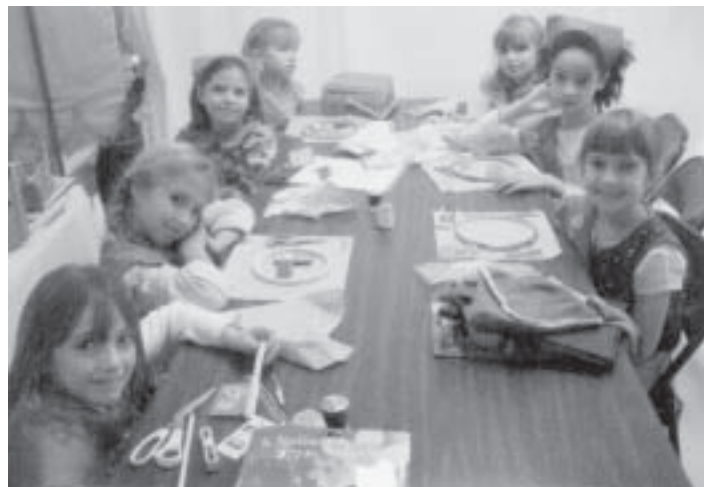
Here the girls are learning the indispensable skill of sewing.