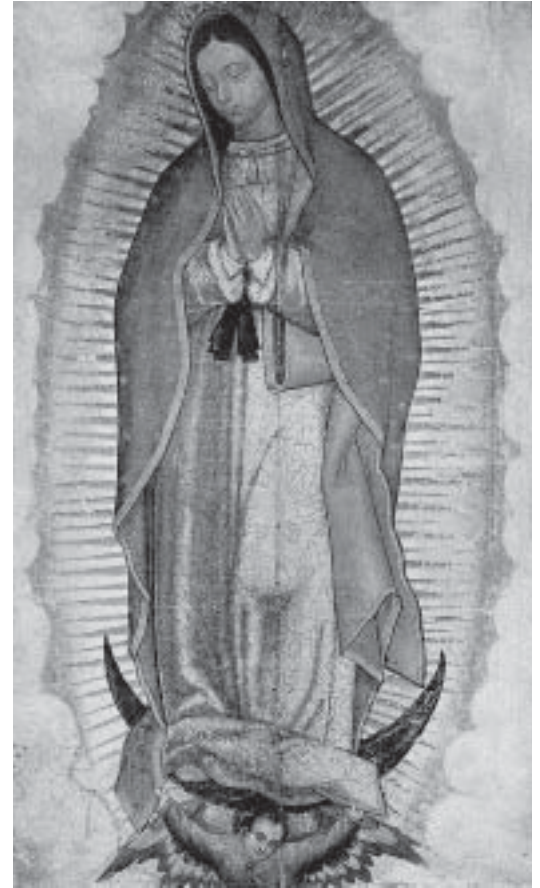
The miraculous image of Our Lady of Guadalupe, of which several recent books introducing new scientific evidence prove again that it was not made by human hands.

The festivities begin with a sort of vigil that can start as early as midnight and is comprised of traditional hymns, called the Mañanitas (or, morning songs) on or near the church's parvis (the porch). In this case, being a school day, the Mañanitas were held before the 8:15am school Mass, with the young and old wearing native clothing gathering to join in the festive songs. Afterwards, a procession was formed, with each person carrying a rose to be offered to Our Lady in the church near the altar. After Mass, a Mexican breakfast of chorizo (spicy sausage), rice, black beans, fritas (potatoes), tortillas and more was served to all.