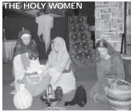
The Holy Women prepare the various necessities for anointing Jesus.