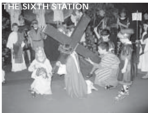
THE SIXTH STATION

Veronica wipes the face of Our Lord with her handkerchief leaving the impression of His Face, while Simon of Cyrene kneels behind Our Lord.