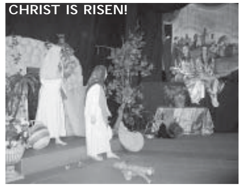
Arriving at the sepulcher, the Holy Women find it opened and empty, then the angelic apparition informs them that the Lord has risen.