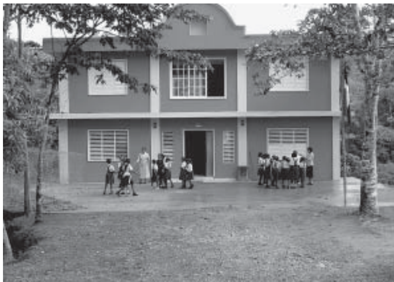
A frontal shot of the school’s exterior, complete with its new second floor, and painted in an attractive red and white colonial scheme.