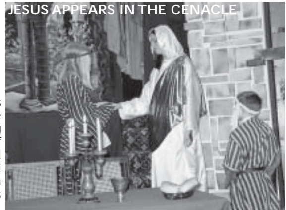
JESUS APPEARS IN THE CENACLE