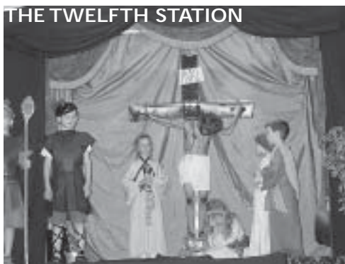
THE TWELFTH STATION

Here between one of the stations, the choir sings an appropriate Lenten piece in polyphony.