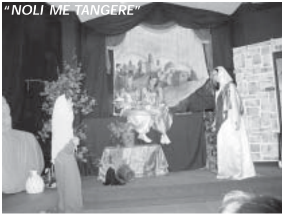
"NOLI ME TANGERE"