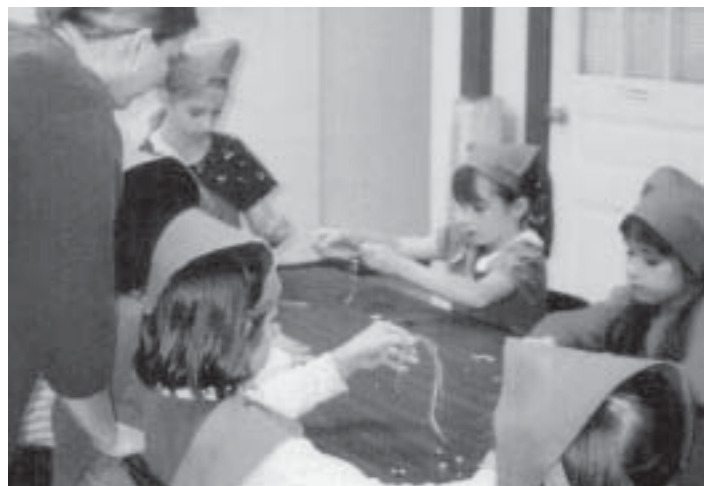
Learning how to make sacrifice beads, which later they will use to help in learning to lead virtuous Catholic lives.