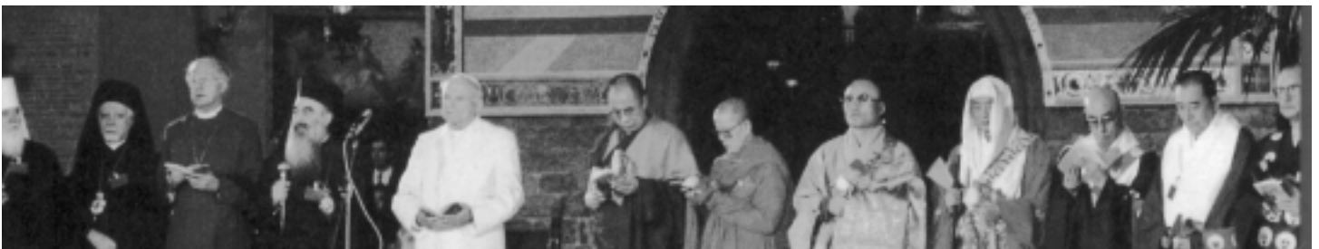
October 27, 1986: Assisi I: in a letter sent to 8 cardinals about the upcoming event, the Archbishop remarked: "The scandal given to Catholic souls cannot be measured. The Church is shaken to its very foundations. If faith in the Church, the only ark of salvation, disappears, then the Church herself disappears."

expectations about Pope Benedict XVI, mainly that he will probably not be the great reformer of the Church as was Pope St. Pius X due to his manifested attachment to the Second Vatican Council. Nevertheless, we should not give up hope, and we must watch and pray that Modernist Rome will renounce its disorientation and revert to Catholic Tradition, where the SSPX stands ready to assist with the restoration of the Faith. Until then though, those who truly adhere to Catholic Tradition remain seemingly in exile and quoting Pope Gregory VII 5 , we proudly repeat: "I have loved justice and I have hated injustice; that is why I die in exile."