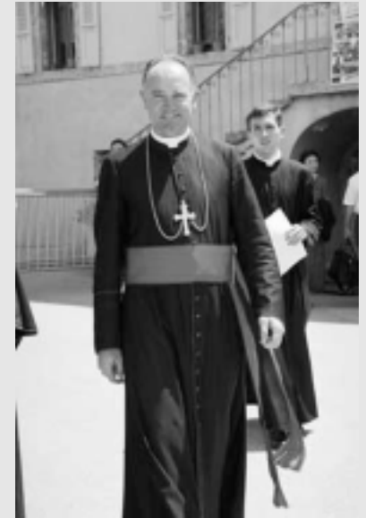
Following the Archbishop’s example, Bishop Fellay is seen at Castel Gandolfo having met with Pope Benedict XVI, who during the meeting described the SSPX’s founder as “venerable Archbishop Lefebvre, this great man of the Universal Church.”

The Roman pontifical universities have become chairs of Modernist pestilence. The co-education of the Gregorian is a