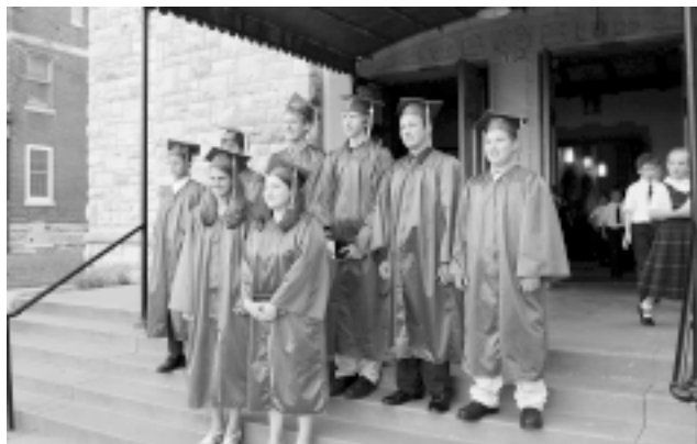
The 8th grade graduates pose on the front steps of St. Vincent de Paul after their Graduation Mass.