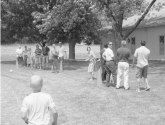
Parishioners, young and old, get ready to have a tug of war.