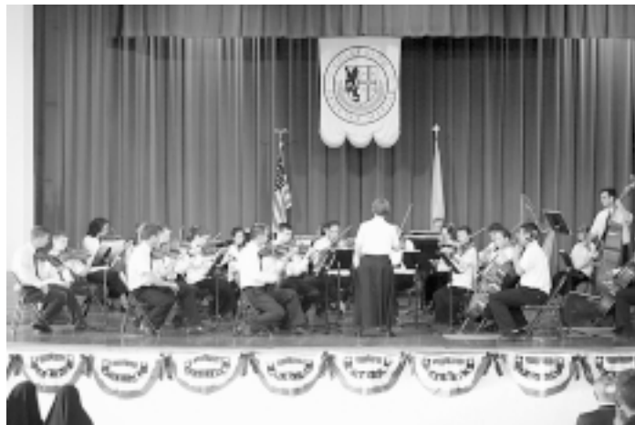
During the parish concert, a student orchestra played various classical pieces, the "Concord" girls ensemble gave a performance, and various instrumental solos were made, demonstrating well the cultural talent that is being fostered in St. Mary's.