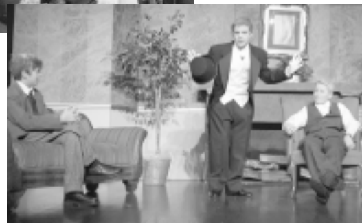
Having returned from the opera after Eliza's successful linguistic demonstration, Prof. Higgins (seated in center) and Colonel Pickering (seated on the left) listen attentively as the "ruined" Alfred Doolittle, "the most original moralist at present in England", expounds his dilemma.