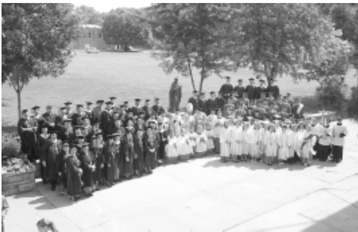
The graduates (on the right, both college and high school) pose with the ministers (center) and academic staff (on the left) who are wearing their academic robes and emblems, as is the classical custom in Catholic institutions.