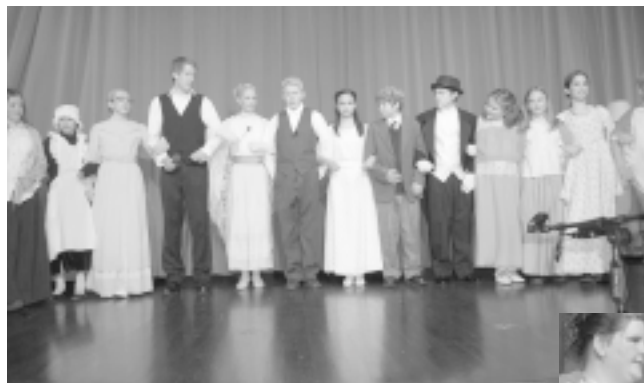
The successful cast lines up to a thundering applause, and then in gratitude...