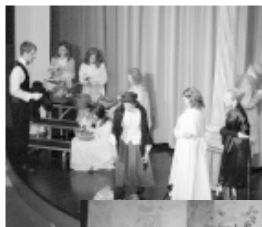
The well known, opening flower-selling scene. Behind the column is Prof. Henry Higgins, while Eliza Doolittle (center wearing a hat) sells a flower to Mrs. Eynsford Hill and her daughter (in front of the column), while Freddy watches from the left.