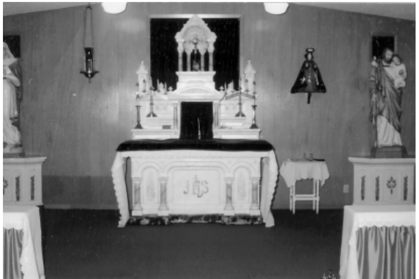
Before the 1986-87 renovations, this is how the sanctuary in the Sanger chapel appeared, with a rather low ceiling and without a predella (the altar platform).