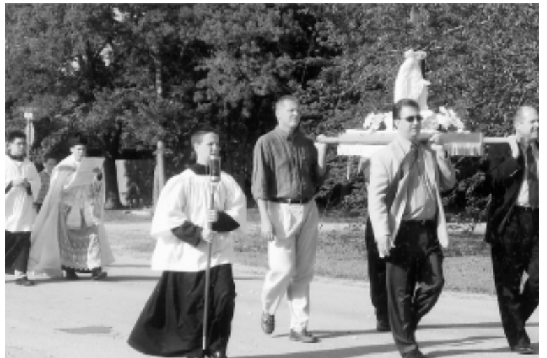
Carried by 4 men on a decorated bier, the statue of Our Lady makes its way through the local neighborhood during the procession in her honor and in thanksgiving for 30 years of graces.