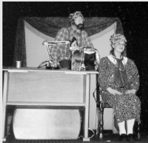
While another comedy was "The Night Before", written and directed by one of Immaculate Heart of Mary's own parishioners.

A close-up of the bas relief which features below the bust the joined initials of "M" and "R" surmounted by a crown, which denotes her title, Regina Martyrum (Queen of Martyrs), as Our Lady was "martyred" at the foot of the Cross. Eventually, several instruments of the Passion, such as the hammer, pincers, spear, and sponge of vinegar on a staff will be added on either side of these initials.