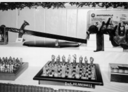
Some of the items sold during the live auction included high-quality chess sets, a replica of a sword from the Crusades, a wooden inlaid box and a cd set featuring the BBC's 1981 13-hour rendition of J.R.R. Tolkien's literary classic, The Lord of the Rings .