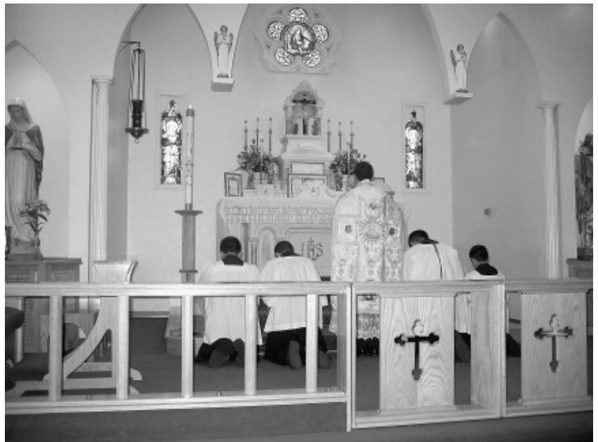
In this view of the anniversary High Mass, one can see some of the miraculous effects of the 1986-87 renovations. The ceiling was raised high above the altar, a suspended, triumphal arch (partially in view) was placed across the sanctuary that ties into arched statue niches on the sides, while stained-glass windows were installed above and on the sides of the altar, and a predella was installed.