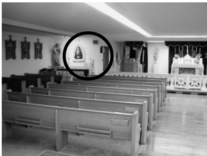
Seen from a distance, one can see how the plaque was carefully designed with a marbled, gothic arch to compliment the existing architectural elements of the chapel.

The bas-relief at Crookston was made by a parishioner of Our Lady of Sorrows Church, who coincidentally first came to the chapel on the day that the chapel was consecrated to the Sacred Heart using the same picture President Garcia Moreno had used for his consecration of Ecuador to the Sacred Heart in 1873 during a session of Congress. She had been working on this sculpture before she discovered Catholic Tradition, and when she came, she noticed a copy of the famous Sacred Heart picture in the chapel. Subsequently, she decided to donate her sculpture to the chapel as soon as it was finished.