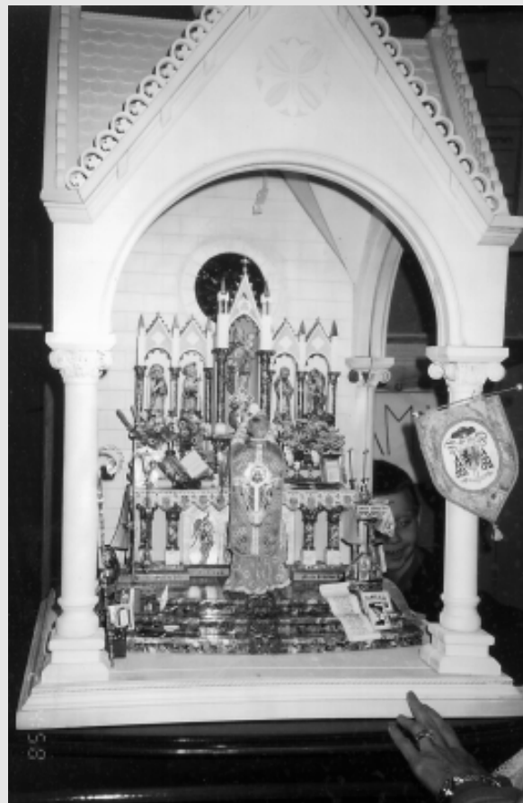
A close-up of the magnificent miniature, complete with hand-made altar (built and painted to match the one in the St. Paul chapel), vestments, replicas of books written by the Archbishop (on the left-hand side of the marbled altar steps), pontifical regalia and various other items. Over 500 hours by 10 different people were spent on this intricate masterpiece which sold during the auction for $4100.

these miraculous events gave the Ecuadorians a strong impulse to fight against this malicious agenda.