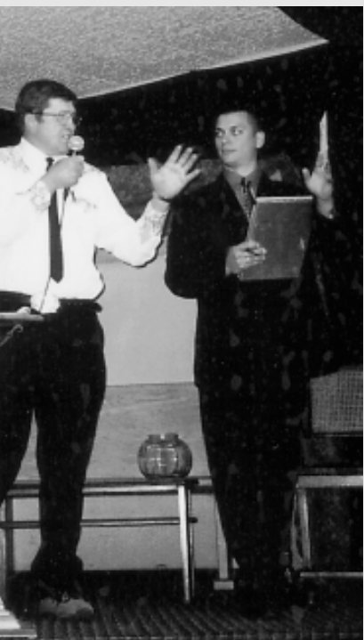
The auction in progress. The professional auctioneer was a parishioner from the nearby Prairie chapel of St. John Vianney.