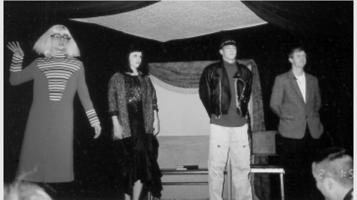
A view of one of the skits featured during the theatre-auction, "The Joke Show", a stand-up comedy routine that kicked off the day's festivities.

The entire event was enjoyed by all attending, and was successful in raising $40,000 for the academy.