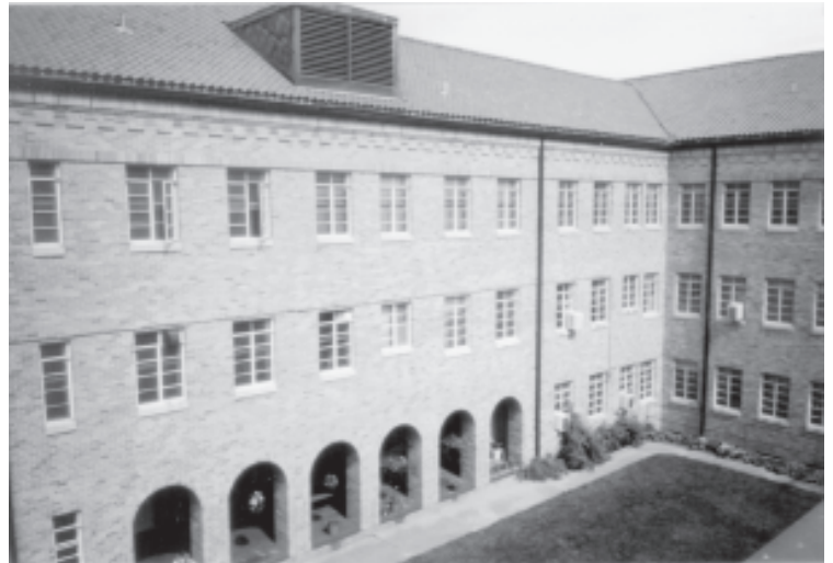
A view of the cloister courtyard that also shows the brick exterior of the beautiful Romanesque style building.

All donations are tax-deductible under the IRS code and the sisters' tax id # is: 931297177