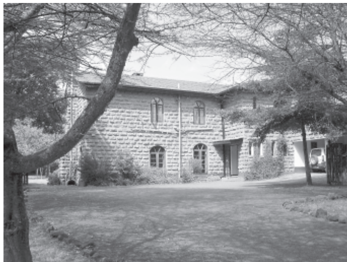
The beautiful, stone priory of Our Lady Help of Christians in Nairobi.

One of the apostolates undertaken by the priory is the bi-monthly publication of Kwa Msalaba ( The Cross in Swahili), which is distributed throughout Kenya in order to promote traditional Catholic doctrine, which has been sorely lacking for 40 years.