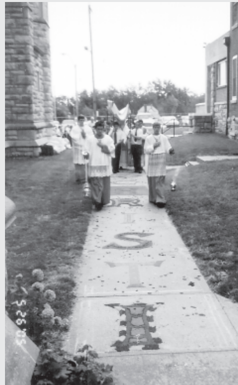
As Our Eucharistic Lord left the church, He crossed over a series of gothic letters spelling out "Corpus Christi", whose colors included red, blue, green, yellow and orange.

Readily seen from the front porch balcony of the Regina Coeli House was the massive mural containing a symbol of the Agnus Dei on the parking lot.