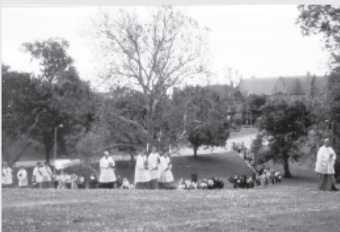
The imposing structure of St. Vincent's behind, the procession had crossed The Paseo and now passes through Troost Park just before crossing Tracy Avenue to reach the Regina Coeli House.

Readily seen from the front porch balcony of the Regina Coeli House was the massive mural containing a symbol of the Agnus Dei on the parking lot.