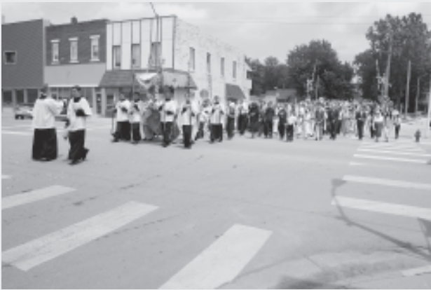
The procession crosses the railroad tracks and Highway 24 in downtown St. Mary's. Coordinated efforts with the railway, police and state troopers helped maintain a safe procession route.

Chapel Christi on High cession l that n of St. a third cle on s. The mbined nions, on the icants Panis