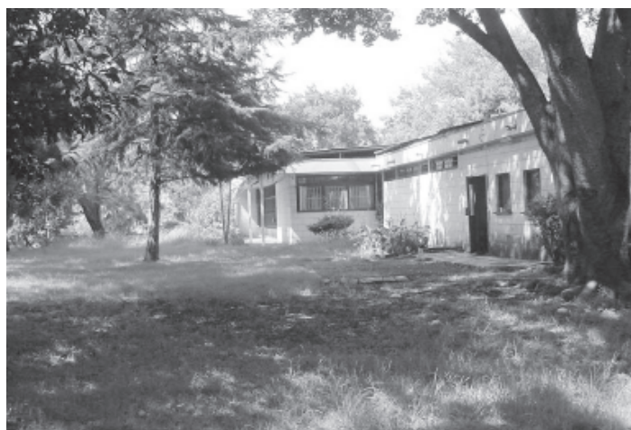
A view of the newly completed chapel in the Lavington neighborhood of Nairobi that seats 200, as the former chapel had become too small.