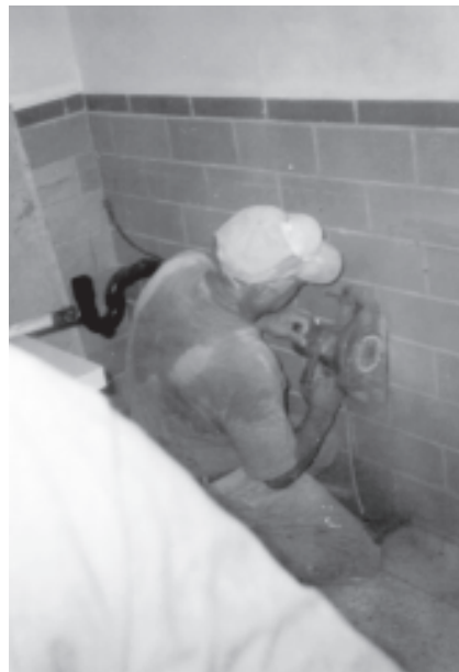
The worker seen here cutting through the wall shows that some of the work has already begun, starting in the west wing. When that wing is completed, the sisters will need to move there from the middle wing where the repairs will continue.