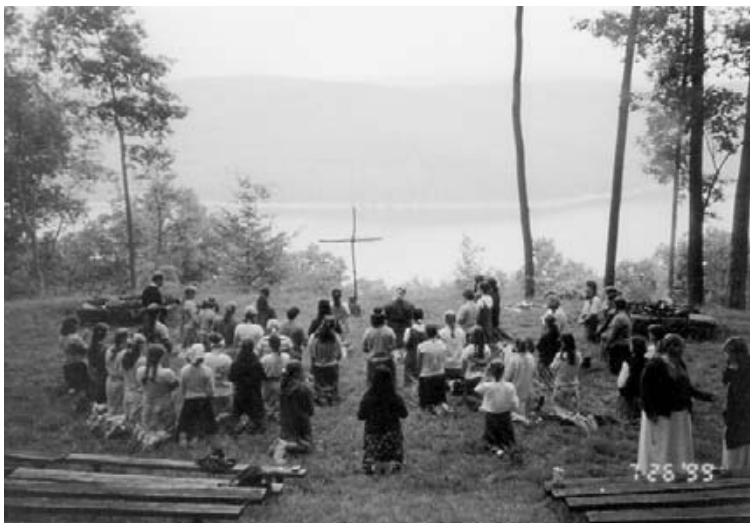
Kneeling at the foot of the cross erected overlooking the panoramic view offered by the Allegheny Reservoir at Camp Olmstead, the girls pray the Rosary.