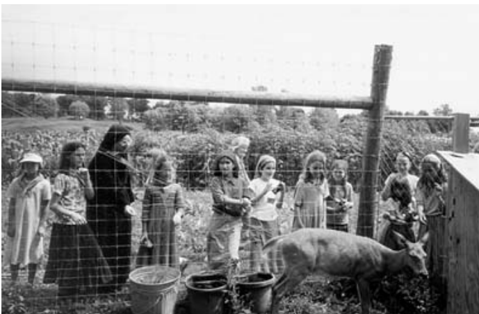
One of the excursions that the St. Maria Goretti camp made was to a deer farm...