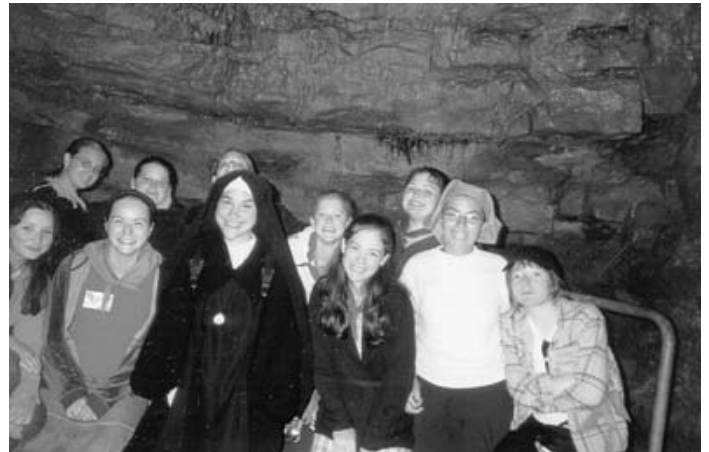
...while another was to the Mystery Cave in Forestville, MN.