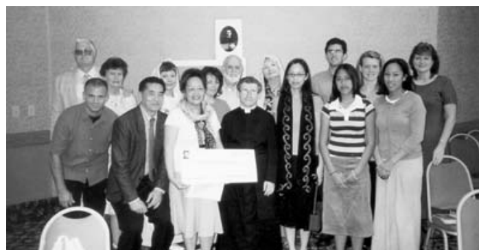
The mission in Escondido, CA gained second place, and here the parishioners pose proudly in their hotel room "chapel" with a check-facsimile of their efforts, demonstrating once again the fervor of the "poor in spirit".

These young ladies of the winning first place Springfield, MO chapel are in the process of tabulating just how many pennies (and other forms of currency) their generous parish donated to the Seminary's cause.