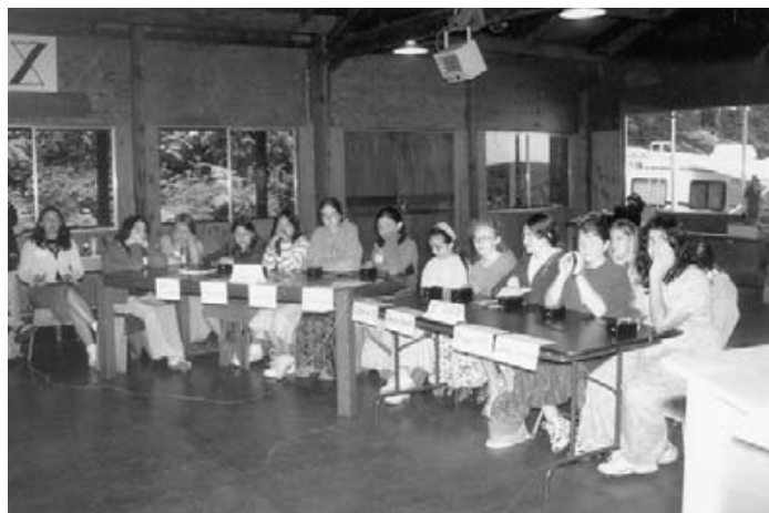
During the Tri-State Camp, the “Roman Catholic Challenge Game Show” (complete with electronic buzzers) was held, covering topics such as Catholic doctrine, history and saints, with each team taking a saint’s name.