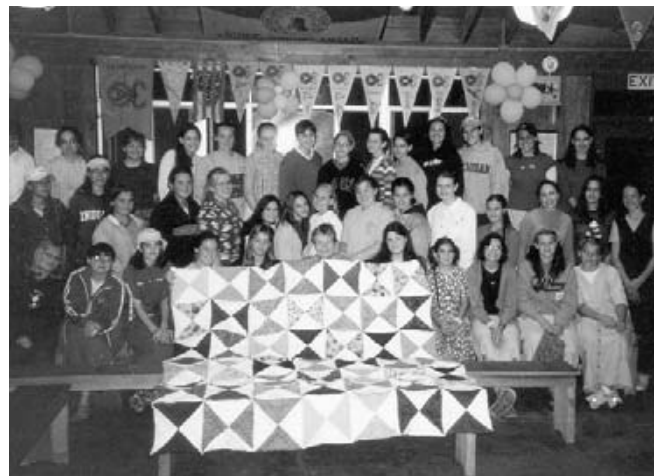
The girls at Camp Olmstead show off the quilt that they made in craft class. Signed by each one of them, the quilt was awarded to the best camper.

Eastern seaboard states, as well as the Midwest.