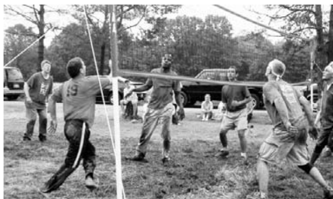
Remember that overcast sky? After some intermittent rains, the ground became "very wet" and volleyball began to resemble "mud ball"; nevertheless, spirits were not dampened. Here we see the Charlotte team on the left preparing to spike the ball against the Pittsburgh team.