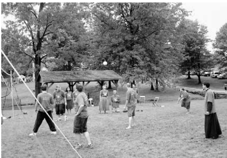
The Chicago team serves to the opposing side.