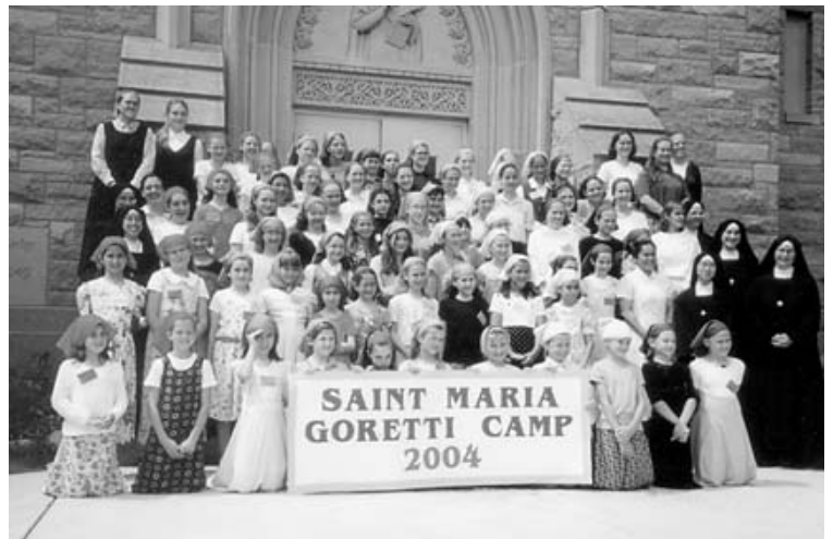
Organized into groups by colored head veils, the happy campers of the St. Maria Goretti Camp, their counselors and the sisters pose joyfully on the steps of St. Thomas Aquinas Seminary.