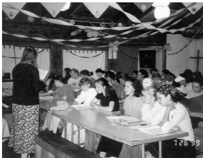
Having the joyful spirit of the saints is essential to sanctification. Here the girls at Camp Olmstead attend one of the daily music classes, which had them singing beautifully in no time.

Each camp also had a good balance of supernatural and natural activities. On the supernatural side, the girls were able to enjoy such spiritual events as daily Mass and public recitation of the Rosary, while some even had the opportunity to attend Sunday Vespers and Benediction. The girls also received conferences on spiritual topics that assisted them in their personal sanctification and exercising their charity towards God and neighbor, as well as catechism classes, which are essential to gaining knowledge about the Catholic Faith. While on the natural side, the girls enjoyed such fun activities as hikes, campfires, ingenious games, various craft making skills, and singing.