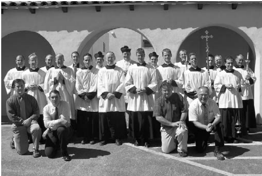
With the feast of Michaelmas having concluded the retreat, the brothers and new postulants jubilantly pose with the retreat master, the ministers of the Mass and some of the priests stationed at the retreat house.