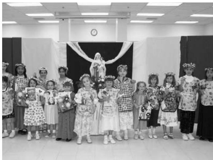
The girls of Our Lady of the Angels Church happily pose for a picture during their femininity program.