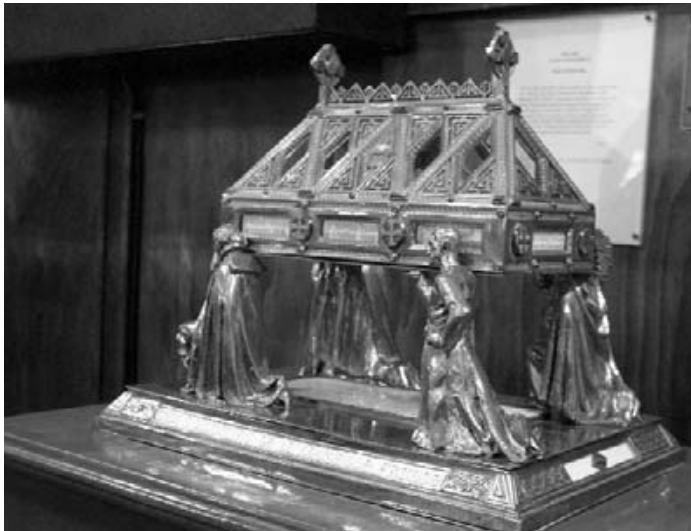
One of the two magnificent reliquaries containing major relics of the various North American Martyrs. An even larger reliquary (out of picture to the left), contains the skull of St. Jean de Brebeuf.

The walk to the shrine then followed, concluding with Stations of the Cross at the large outdoor stations located at the shrine. Unfortunately, Mass could not be said at the shrine this year, as the Jesuits forbid the SSPX use of it, as well as the actual field at St. Ignace Mission Site. Providentially (and ironically), a Protestant group, United Church Centre, allowed the pilgrimage group to use their field adjacent to the St. Ignace Mission Site for the preliminary Mass.