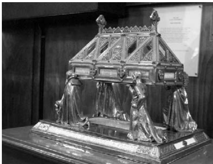
One of the two magnificent reliquaries containing major relics of the various North American Martyrs. An even larger reliquary (out of picture to the left), contains the skull of St. Jean de Brebeuf.

The walk to the shrine then followed, concluding with Stations of the Cross at the large outdoor stations located at the shrine. Unfortunately, Mass could not be said at the shrine this year, as the Jesuits forbid the SSPX use of it, as well as the actual field at St. Ignace Mission Site. Providentially (and ironically), a Protestant group, United Church Centre, allowed the pilgrimage group to use their field adjacent to the St. Ignace Mission Site for the preliminary Mass.