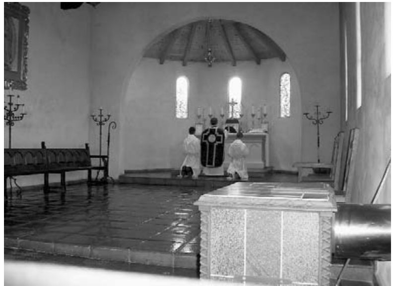
In the monastery's chapel, Fr. Nichols celebrates Mass assisted by two of the Arcadia boys as servers who according to Benedictine custom are wearing monastic robes with hoods and cords, instead of cassock and surplice. In the foreground on the right is a cast iron stove, the only source of heat for the chapel, and once a common site in churches located in areas where winters are harsh.