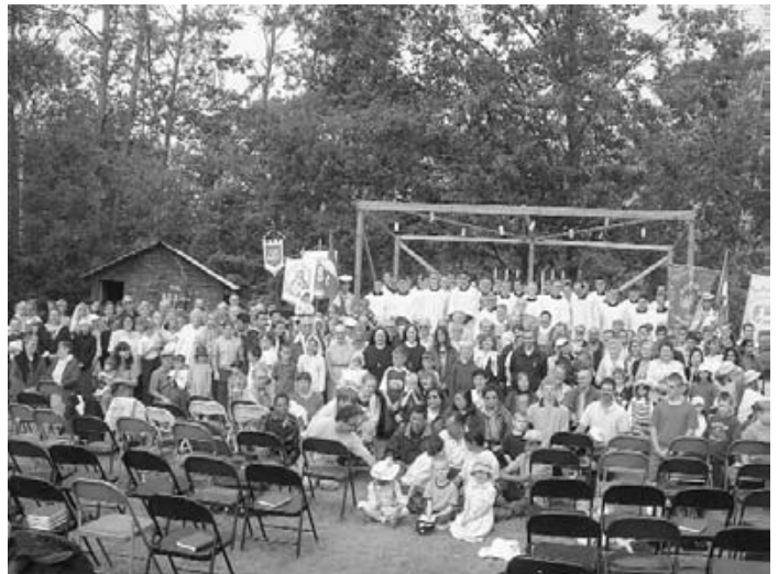
After the Mass, the nearly 300 pilgrims pose for a picture before beginning their walk to the shrine.