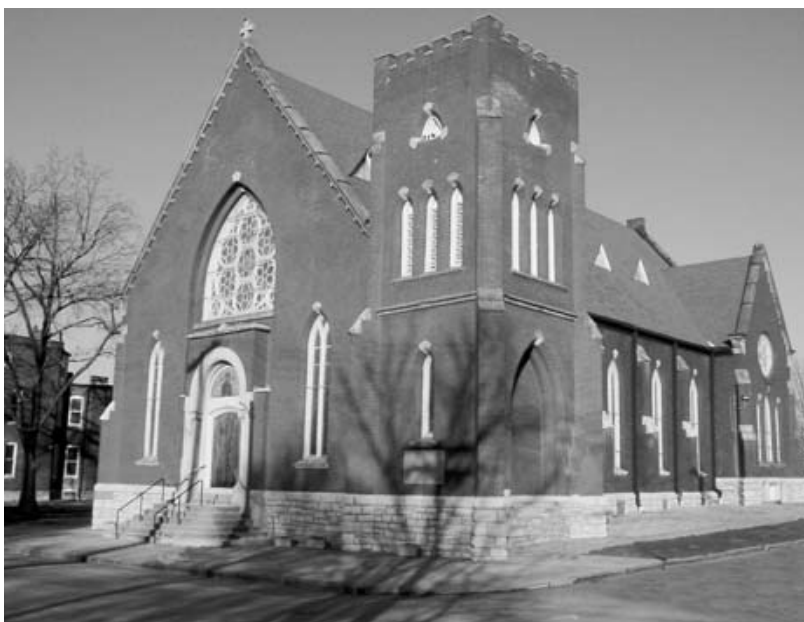
The simple stone and brick Gothic-Revival exterior of St. Mary's Assumption Church which was built for Ruthenian Rite Catholics between 1903 and 1917.