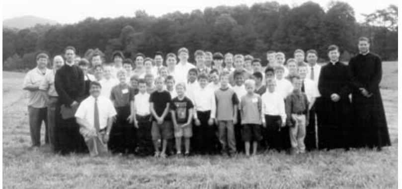
After the camp, with the local mountains providing a beautiful background, the boys, camp counselors and clerics pose happily for a picture.