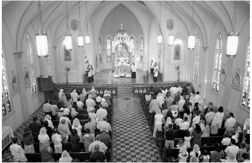
A shot of the church's beautiful interior during the anniversary Solemn High Mass. Conspicuous is the magnificent gold-leafed and domed ivory, or four-pillared canopy, over the High Altar, which crowns the stone of sacrifice, and focuses the eyes upon the divine action.

To date, the parish numbers approximately 300 parishioners and has 55 students enrolled in its academy.