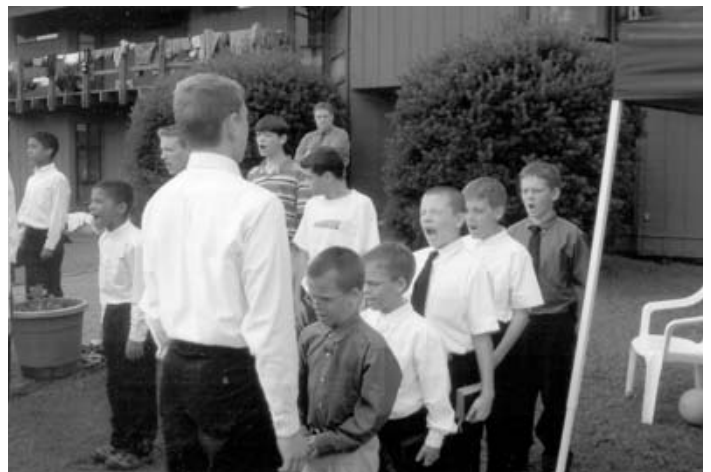
Organized into two groups for line-ups, the boys belonged either to the Cristeros or the Knights of Malta team. Shown here are the Cristeros giving their battle cry of "Viva, Cristo Rey!", while the Knights had "For King and Queen!" as theirs.

With the help of an experienced "bushwhacker" (the taller boy), two younger apprentices learn the secrets of discerning true north with a magnetic compass, a valuable skill to have for trail navigation.