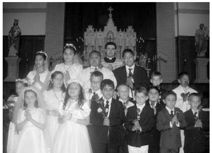
After the Mass and procession, the First Communicants pose with their pastor in front of the Communion Rail, where they can now receive Our Lord at every future Mass.