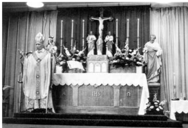
A historic photo of Archbishop Lefebvre during his visit to Queen of the Holy Rosary Chapel in April 1985 to administer Confirmations. The sanctuary was actually on the auditorium's stage.