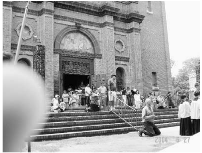
Strikingly different from last year, was the kneeling reverence paid by some of the faithful of the Novus Ordo St. Mary's Church, where the procession made a brief stop.

The turnout of the faithful was again encouraging, with the 240 in attendance coming from as far away as Pittsburgh, PA and Girard, OH. Even more heartening this year, was the marked respect paid by locals as the Blessed Sacrament made Its way during a nearly hour-long procession through the streets of Wilmington. It was commented that people on porch balconies could be seen making the Sign of the Cross as Our Lord passed them by, a sorely missed sight from last year's Eucharistic procession. Perhaps even more remarkable was the fact that the procession could even be held, for since the previous year, the city of Wilmington has enacted an anti-noise ordinance that necessitates the previous permission of every homeowner on the proposed parade route, which incredibly was unanimously given! Upon the return of the procession to St. Thomas, Benediction was held, then followed by a Southern style BBQ banquet.