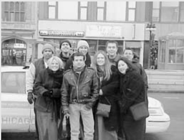
Members of the Saint James the Greater Youth Group pose in front of one of Chicago's famous "To Serve and Protect" police cars during their trip downtown. Just minutes before, these young Catholics acted as Good Samaritans after assisting a man whom they witnessed being struck by a taxi until the police and ambulance could arrive.