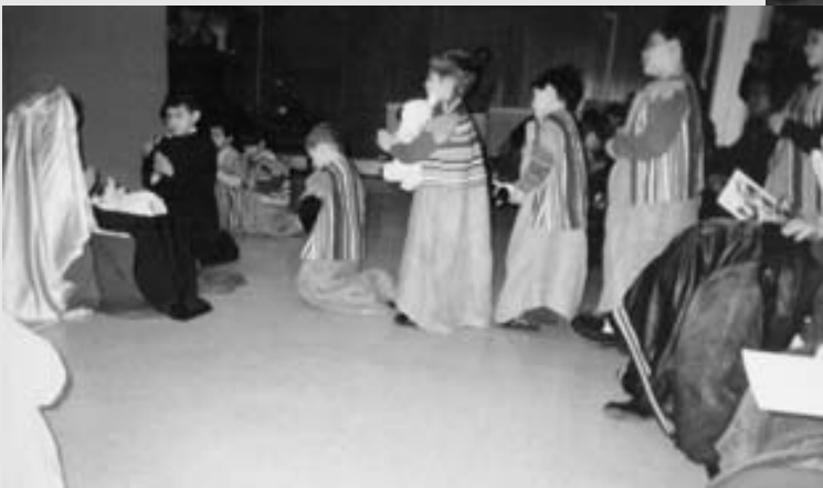
The shepherds wearing burlap and Mexican-style vests approach the manger, flanked by Mary and Joseph, to adore the newly born Christ Child.