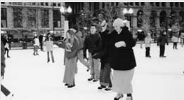
After paying heed to Our Lord's precept to "love thy neighbor", the youth group then continued to their intended destination, Millennium Park, for some fun on the ice.