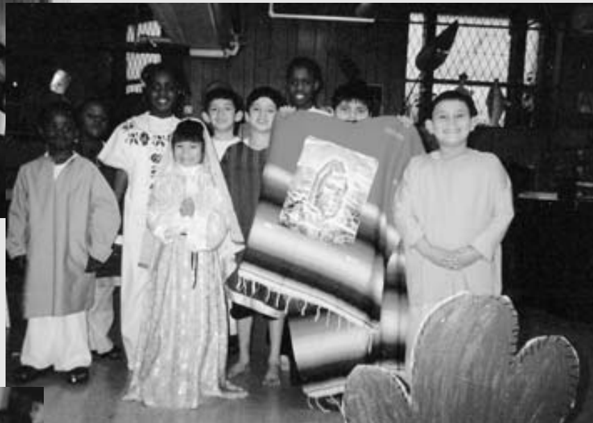
The members of the Guadalupe cast pose with some more of their ingenious stage-props, a replica of the tilma on which is imprinted the miraculous image of Our Lady of Guadalupe and in the foreground a cardboard cactus. One can also tell that much work went into the costumes used for both plays.