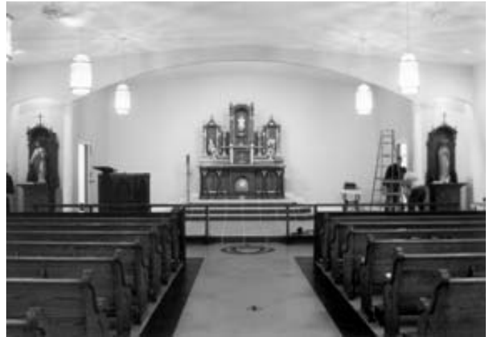
The completed sanctuary with its simple yet elegant lines correctly focuses the view of the faithful upon the altar, the center of every Catholic church.