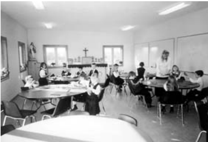
This room serves as a combination 1st grade, lunchroom and school chapel (notice the altar to the rear).