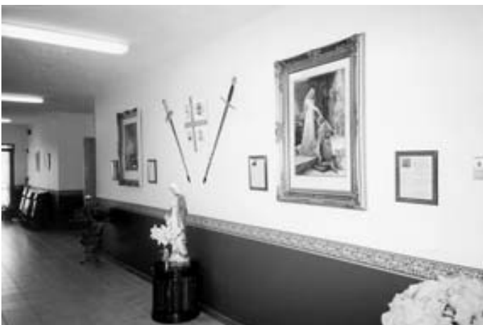
The "Knights of Mary Hallway" which connects the classrooms. The shield on the wall (flanked by the swords) contains the same emblems as the aforementioned inlaid floor pattern.