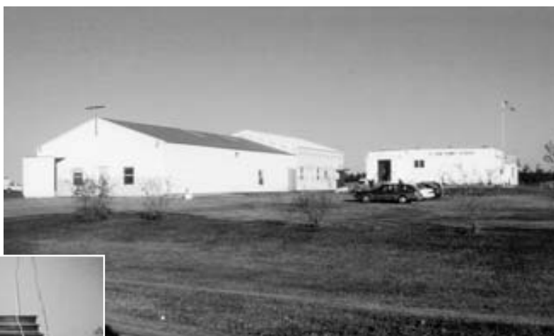
An exterior view showing the addition which contains the new sanctuary and sacristies to the rear of the chapel, with the school building to the right.