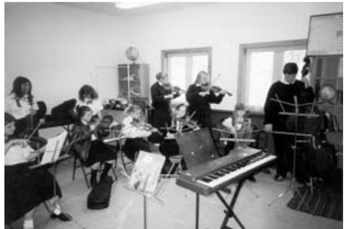
A shot of the High School orchestra practicing. Is that Mozart or Haydn?