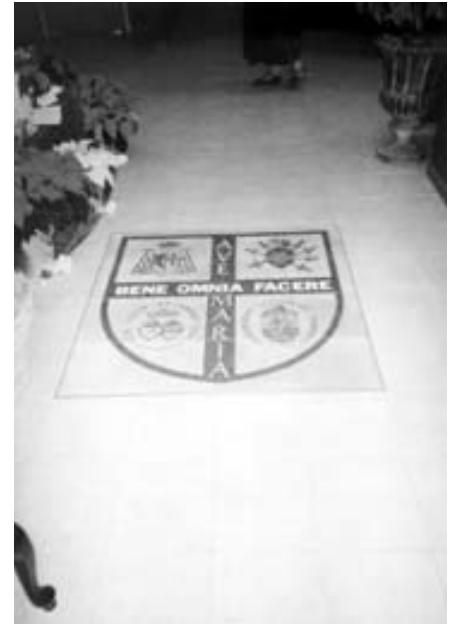
An inlaid pattern on the floor of the school's entrance containing St. Pius X's and Archbishop Lefebvre's coats of arms, an image of the Sacred Hearts of Jesus and Mary, and a logo of the Society of Saint Pius X. The words "Bene omnia facere" means in Latin, "To do all things well" echoing Scripture's description of Our Lord which all students should imitate.