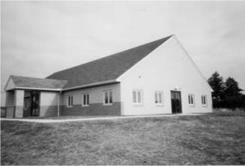
St. Peregrine's Academy, the exterior of which is two-tone stone-concrete facing.

through High School. The well-constructed building would have cost the parish almost $500,000, but through the abilities and efforts of parishioners, it was constructed for less than half that amount.