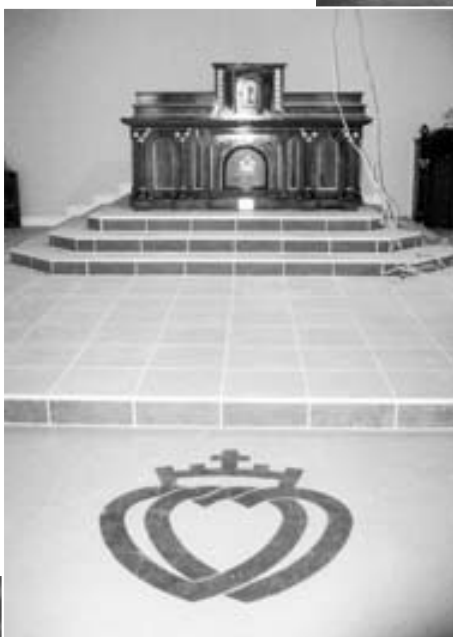
The nearly completed sanctuary, complete with a tiled floor and predella, and the logo of the Society of Saint Pius X inlaid on the nave floor (the Communion rail has yet to be installed).