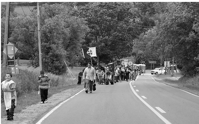
Treading upwards through the hilly terrain of New York State, various chapters continue along the path to the shrine.