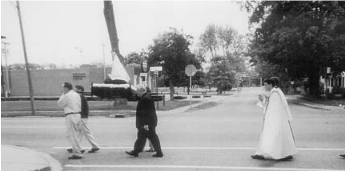
The crowned statue of Our Lady is carried by four men of the parish while the Rosary is recited over a loud speaker through the streets of Nappanee, IN.

The town of Nappanee, IN is located in the heart of Amish country. Yet it is the site of a Society chapel – Our Lady of Perpetual Help. Rightly proud of their Catholic Faith and heritage, the faithful of Our Lady of Perpetual Help recently took part in two processions through the streets of Nappanee thus manifesting their adherence to the One, True Faith. In May, a statue of Our Lady was crowned and lavishly decorated in order to be carried during a Rosary procession after Mass. Then in June the faithful participated in a procession of the Blessed Sacrament on the feast of Corpus Christi making it clear to the little town of Nappanee just Who is their King and Lord.