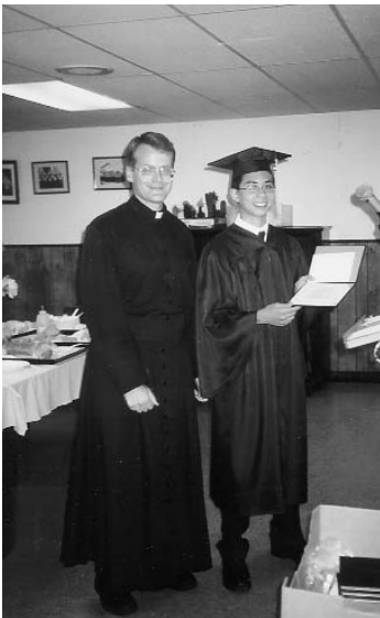
An eighth-grade graduate receives his diploma from his pastor and principal during the graduation ceremonies for St. Vincent de Paul Academy.