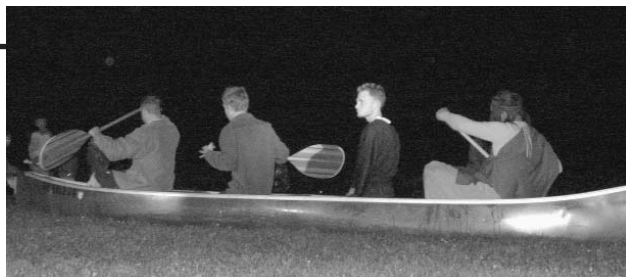
On Friday evening, members of the Girard chapel gave a play recounting the martyrdom of Sts. Isaac Jogues, Rene Goupil and John Lalande. The play was in the form of a narration of the events by Blessed Kateri Tekakwitha who appeared to a young girl in a vision. Here St. Isaac Jogues is rowed downstream for last time by the Huron Indians to the Iroquois camp, where he will ultimately be martyred.