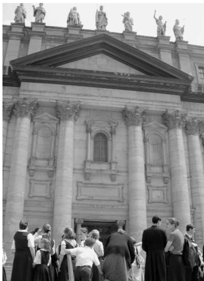
The pilgrims approach the Cathedrale de Marie Reine du Monde giving the viewer a good look at the impressive exterior of the basilica.

The first stop was the Chapel of Our Lady of Bon Secours (named by a group of sailors because of Our Lady's help in getting them safely to shore). The chapel is noteworthy for a relic of Saint Marguerite Bourgeoys as well as a number of miniature boats which hang from the ceiling of the church in honor of the "Star of the Sea".