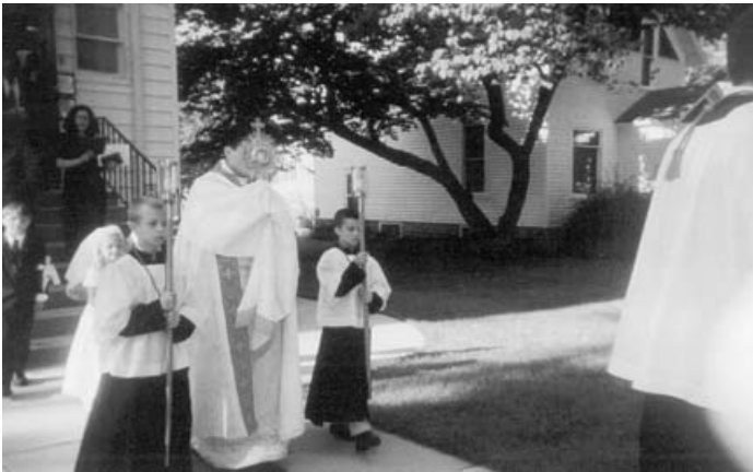
The procession of the Blessed Sacrament on the feast of Corpus Christi. Immediately following the Celebrant are three young children who had just received their First Holy Communion during the Mass.