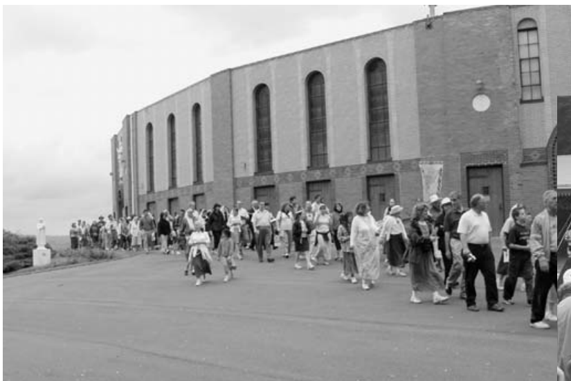
For several years now, the local bishop has not allowed the Society's pilgrims to use the Shrine's Coliseum Chapel to celebrate Mass, so in protest for this ironic unecumenical "lock-out", the 800 or so pilgrims process around it chanting the Litany of Saints and then proceed to the campsite where Mass will be said.