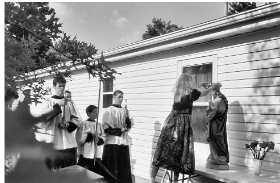
One of the girls of the parish crowns the statue of Our Lady outside St. Mary Magdalene Church.

A popular devotion during the month of May is the May Crowning of a statue of Our Lady. The faithful of St. Mary Magdalene Church in Mexico, MO, honored the Blessed Virgin by crowning Her image on May 25 and also choosing one of Her feast days, the Queenship of Mary (May 31), as a workday to increase the beauty of the church property and maintain the upkeep of the property as well.