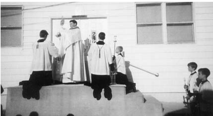
The procession of the Blessed Sacrament pauses at an outdoor altar where Benediction of the Blessed Sacrament takes place.