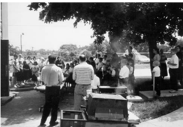
The children of the Academy say their grace before meals on the annual Field Day.