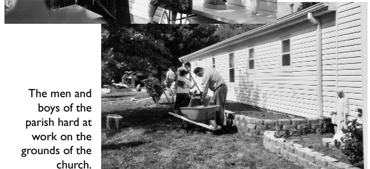
The men and boys of the parish hard at work on the grounds of the church.