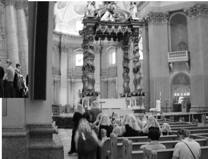
A shot of the interior of the Cathedrale de Marie Reine du Monde featuring the replica of Bernini's baldacino.

saints selected by benefactors to the church grace the exterior of the Cathedrale de Marie Reine du Monde. The church, which was named a minor basilica in 1910, contains a replica of Bernini's baldacino in St. Peter's, as well as historical paintings of the foundation and colonization of Montreal.