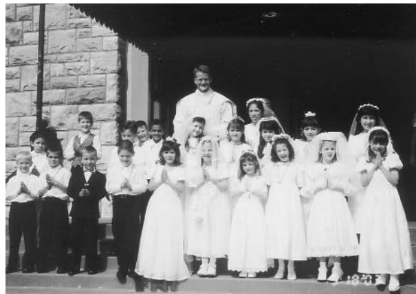
Twenty-one young boys and girls beam with joy as they pose for a group photo after receiving Our Lord in Holy Communion for the first time.