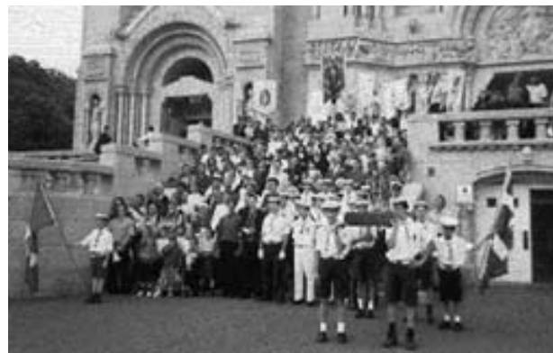
A group shot of the pilgrims on the steps of the basilica of the "Good Sainte-Anne" (the Canadian-Frenches' term of affection). Due to the Jesuit missionaries, the devotion to Saint Anne was an integral part of the French colonization in the Canadian regions of North America.

On July 27th, the 19th annual pilgrimage to the Basilica shrine of Saint Anne de Beaupre in QUEBEC, Canada took place. Despite the rain, the early morning pilgrims first processed with their statue of Saint Anne, mother of the Blessed Virgin Mary, to the Marist Brothers chapel at Chateau-Richer, where a Solemn High Mass was celebrated. After a picnic lunch the pilgrims then continued their trek to the basilica, finally reaching it in the evening. There the pilgrims recited the Litany of Saint Anne, and revered her relics, as well as her famous statue located in the Basilica.