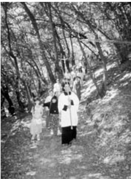
The girls were given a Day of Recollection during the camp. Here they make the outdoor Way of the Cross around the Los Gatos Retreat grounds.