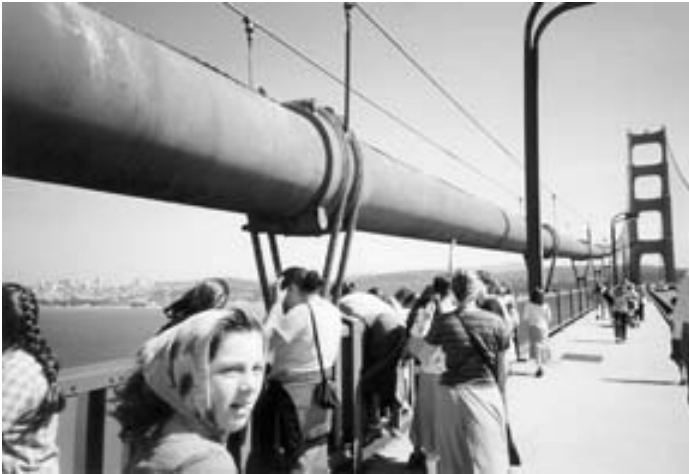
Campers try out the Golden Gate Bridge in San Francisco.