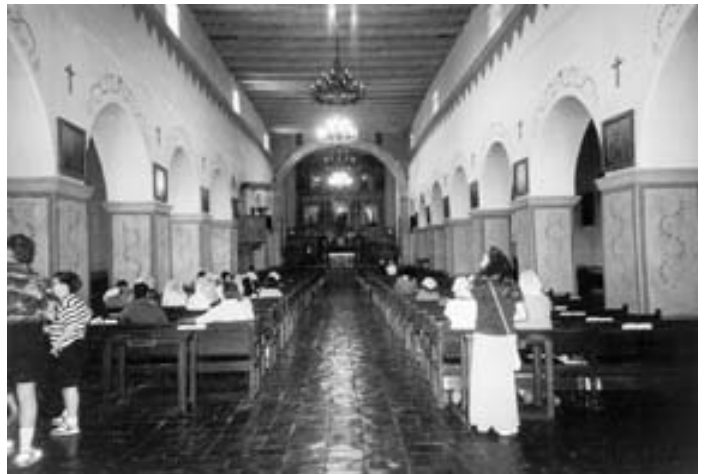
On the feast of the Assumption the campers visited the San Juan Bautista Mission and prayed the Rosary at the Mission chapel.