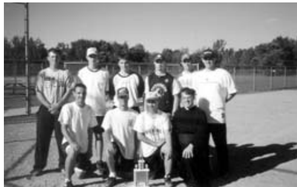
The winning team poses with the trophy at home plate at the conclusion of the tournament.