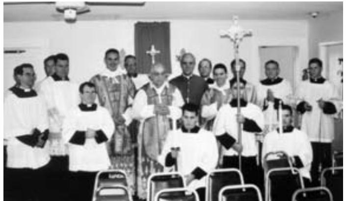
After the Solemn High Mass, the various clergy and servers attending gather for a photo.

So in 1970 he was sent back to Saint Anthony's Seminary. He remained there until October of 1972 when he was transferred to Australia. During his tour of duty down-under, Father made the acquaintance of some traditional Catholics who wanted the Tridentine Mass. Father obliged them, and as of 1973, he would sneak out of the Capuchin priory in order