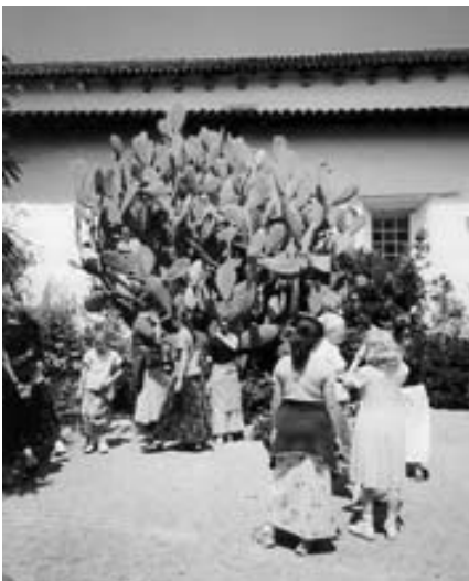
The girls examine a giant cactus outside the Mission chapel.