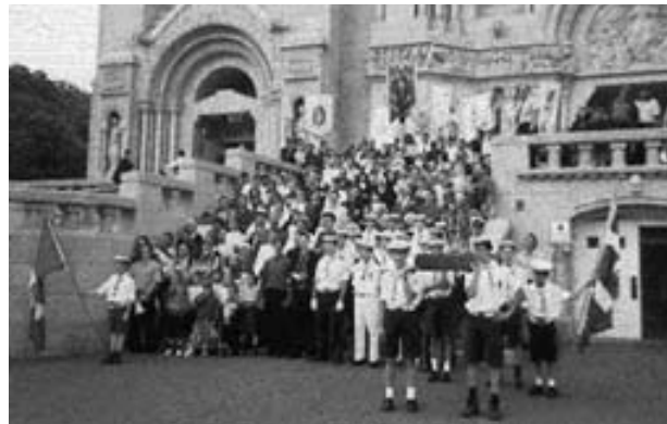
A group shot of the pilgrims on the steps of the basilica of the "Good Sainte-Anne" (the Canadian-Frenches' term of affection). Due to the Jesuit missionaries, the devotion to Saint Anne was an integral part of the French colonization in the Canadian regions of North America.

On July 27th, the 19th annual pilgrimage to the Basilica shrine of Saint Anne de Beaupre in QUEBEC, Canada took place. Despite the rain, the early morning pilgrims first processed with their statue of Saint Anne, mother of the Blessed Virgin Mary, to the Marist Brothers chapel at Chateau-Richer, where a Solemn High Mass was celebrated. After a picnic lunch the pilgrims then continued their trek to the basilica, finally reaching it in the evening. There the pilgrims recited the Litany of Saint Anne, and revered her relics, as well as her famous statue located in the Basilica.