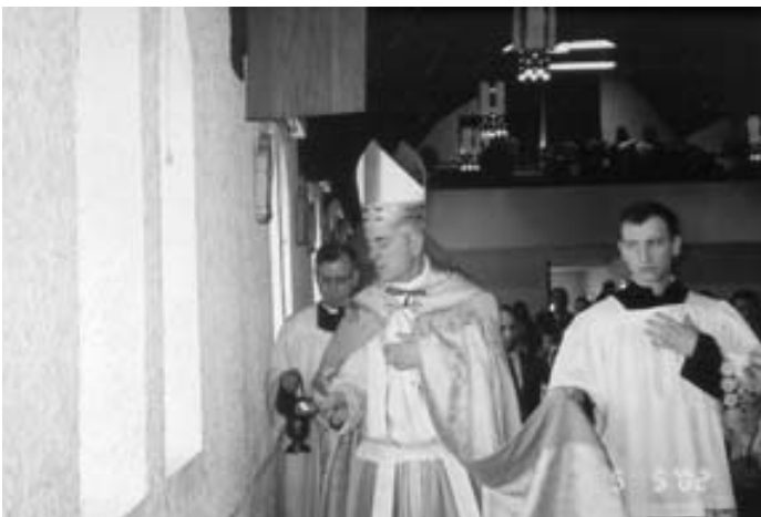
Blessing of the interior walls of the church