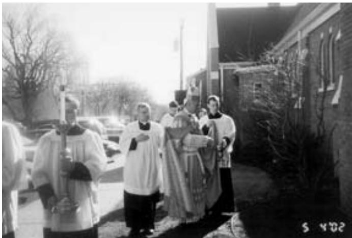
Blessing of the outside walls of the church with holy water