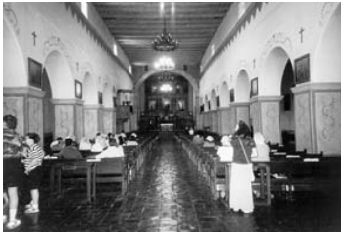
On the feast of the Assumption the campers visited the San Juan Bautista Mission and prayed the Rosary at the Mission chapel.