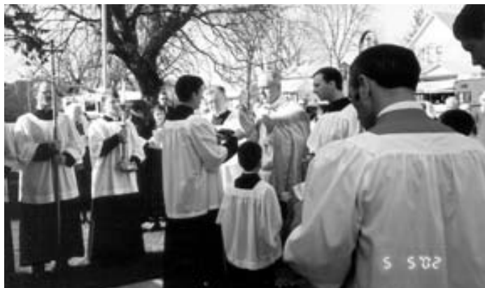
Bishop Williamson prays outside the church entrance at the beginning of the blessing ceremony of St. Michael's Church.

May 4 was the date of the blessing of St. Michael's Church in MANDAN, ND. His Excellency Bishop Richard Williamson performed the ceremony for this brick church which had formerly served as a Lutheran church. Now the building is the site of the Holy Sacrifice of the Mass for the dedicated faithful of St. Michael's which has been a Society mission since 1990.