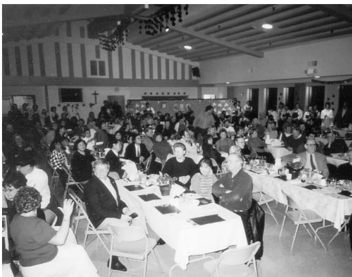
The parish hall was filled to capacity for the occasion. Each table was set in banquet style, with an Irish blessing at each setting.

ST. THOMAS BECKET in VENETA held for the first time a St. Patrick's Dinner open to the public, on March 17, St. Patrick's Day. A total of 160 dinner tickets were sold, along with a raffle, raising $15,000 for the school.