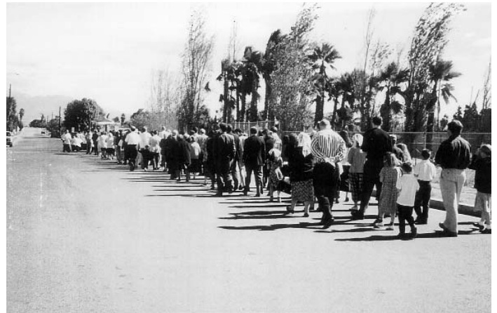
The faithful walk in procession through the neighborhood, following the Blessed Sacrament.