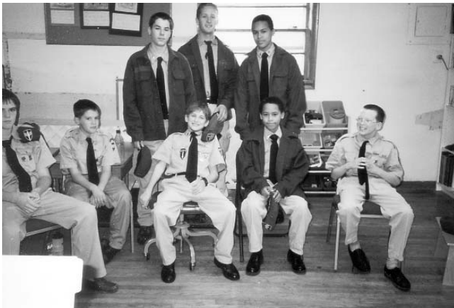
The League scouts gather in their meeting room in between their busy schedule of activities.

join up with the boys of Our Lady of Mt. Carmel. The scouts are taught skills necessary for survival in the woods, as well as sportsmanship and fearless and unselfish dedication to their team. Merits are awarded for exceptional acts of charity, generosity, willingness to serve, courage, camaraderie and humility. The boys are encouraged to prepare to earn the Presidential Award for fitness according to their age. In April the first Junior Scout camp took place.