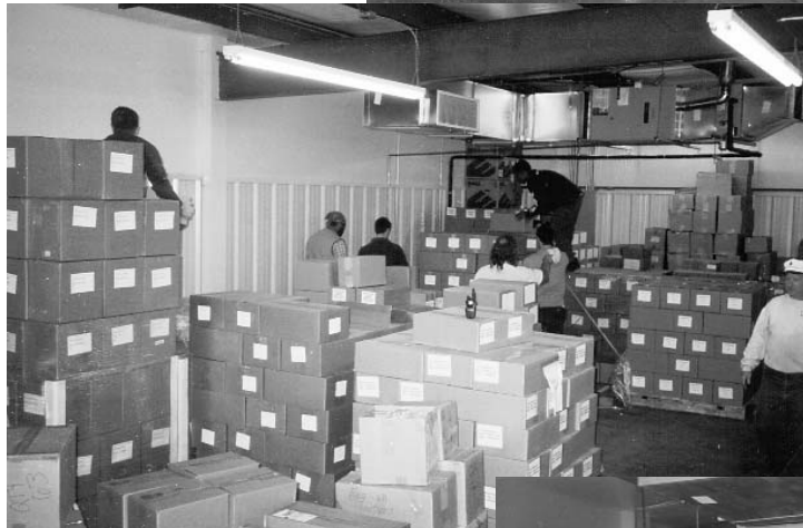
Arranging books on pallets in a systematic manner. This will greatly aid the efficiency of the staff.