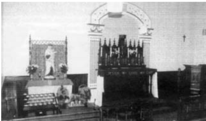
The sanctuary after remodeling, showing the main altar, the lady altar and the pulpit.