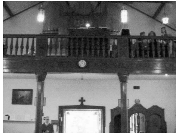
Looking back towards the main entrance, showing the confessional (right) and some choir members practicing in the choir loft.