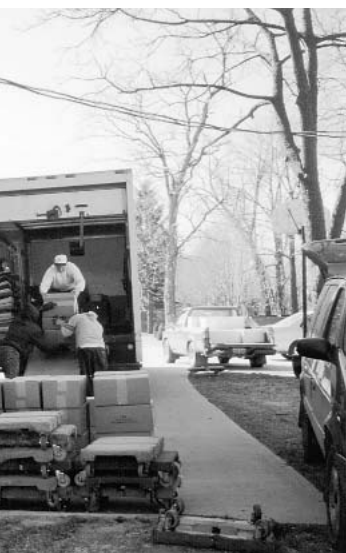
One of the many loads of boxes leaving the Regina Coeli House.