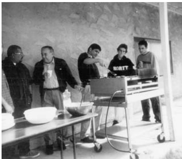
Men at work outside making pancakes —an example for our other chapels.