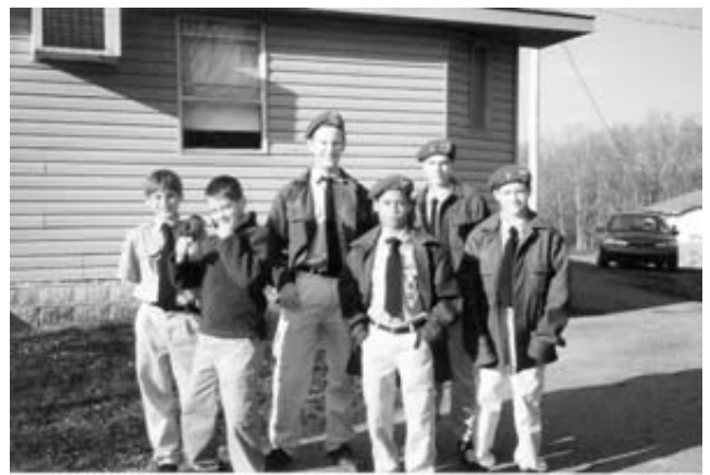
Some of the boys outside the chapel of Our Lady of Mt. Carmel.