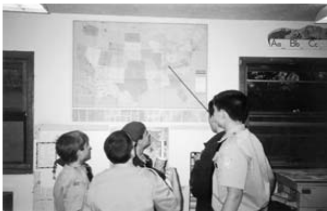
Discovering the "holy land" of Kentucky on a map of the U.S., and planning excursions and hikes as far a field as Georgia.