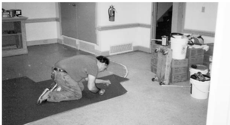
The departure of the Angelus Press offices enabled remodeling of the first floor of the Regina Coeli House into a general secretarial area. This included a new work bench, new floorings and a needed paint job.