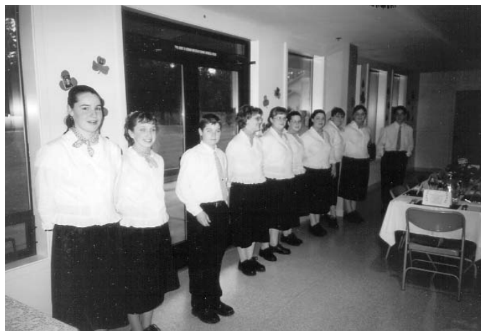
The school children were the waiters and the entertainment, providing folk songs, violin playing and the river dance.