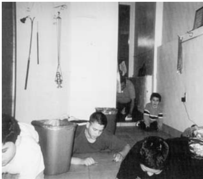
Altar boys on the sacristy floor scraping it clean.