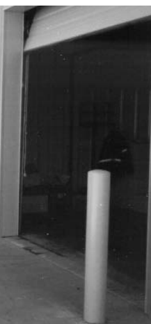
Delivery at the main entrance to the new Angelus building.