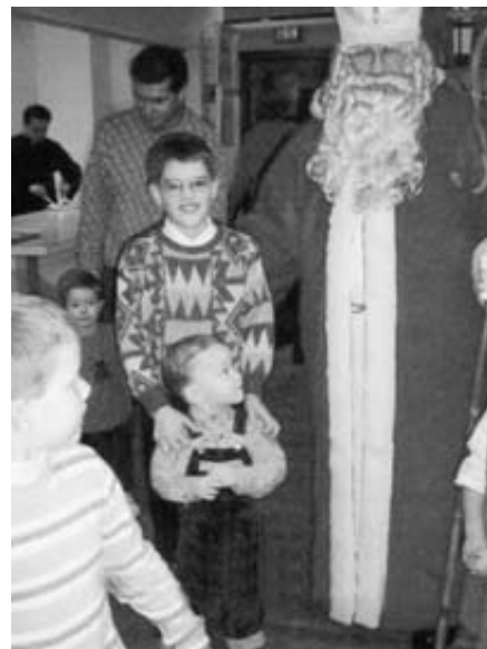
The celebration of St. Nicholas' feast day in the parish hall last December.