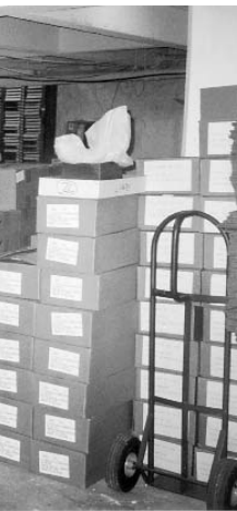
Shipping and handling department in the new warehouse.

ing of the shipping and handling department into a warehouse, and then organizing the space for ease of packing and distribution. It was quite an enterprise move. They were excitedly preparing for the formal inauguration and the enthronement and consecration of the new building on May 13.