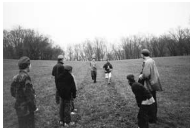
Running and football are amongst the different competitive sports that the scouts participate in.