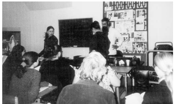
Choir practice in preparation for the Sunday High Mass.