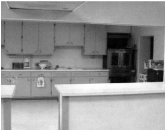
The kitchen facilities of St. Pius V church located in the parish hall in the basement.