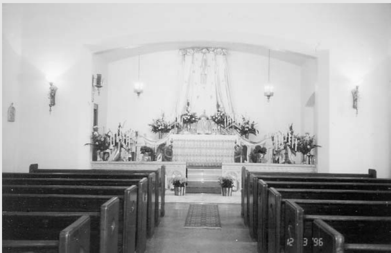
The altar of repose set up in the basement of St. Vincent's church for adoration until midnight on Holy Thursday, March 28.