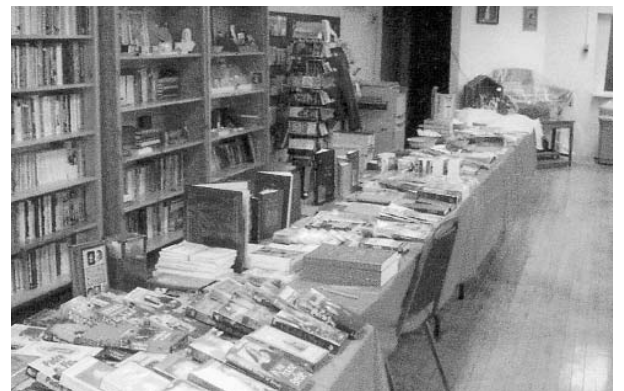
One side of the basement is a bookstore. Here is a view of some of the traditional Catholic books available in the bookstore.