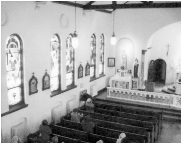
Another view of the church, as taken from the choir loft.