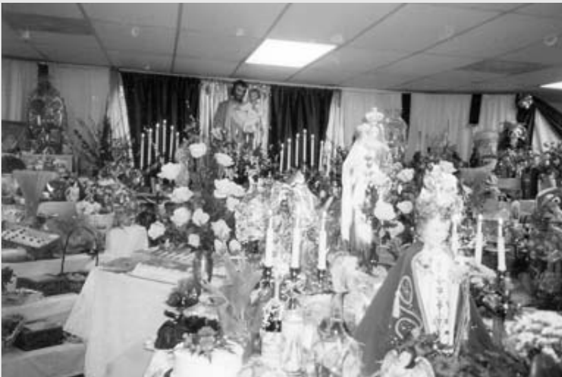
Another view of the St. Joseph's table, which took up most of the parish hall.