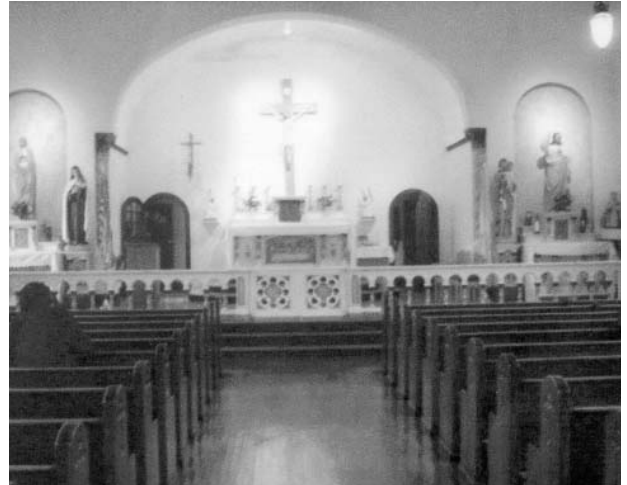
A view of the altar, looking from the nave of the church.