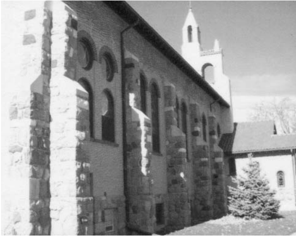
A side view of the church shows the handsome stone work.