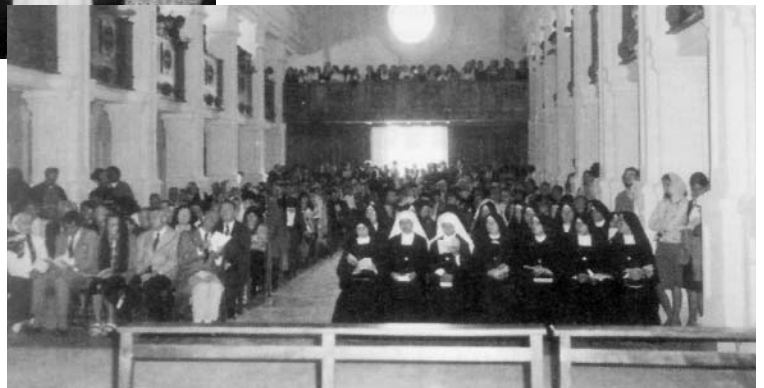
The Sisters and the hundreds of faithful who filled the grand church to overflowing on the day of its consecration.