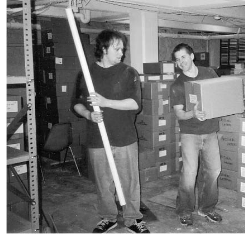
Moving boxes out of the former home for the shelter department, the basement of the Regina Coeli Hall.

The end of March also saw the moving of ANGELUS PRESS into its new building. Moving thousands of books from a basement to a new building, setting up shelves, is now done and the Angelus staff is now in the process of the blessing and dedication of their new building, its blessing and dedication of the Angelus to the Sacred Heart of Jesus.