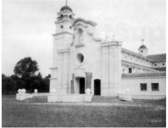
An exterior view of Immaculate Conception church.