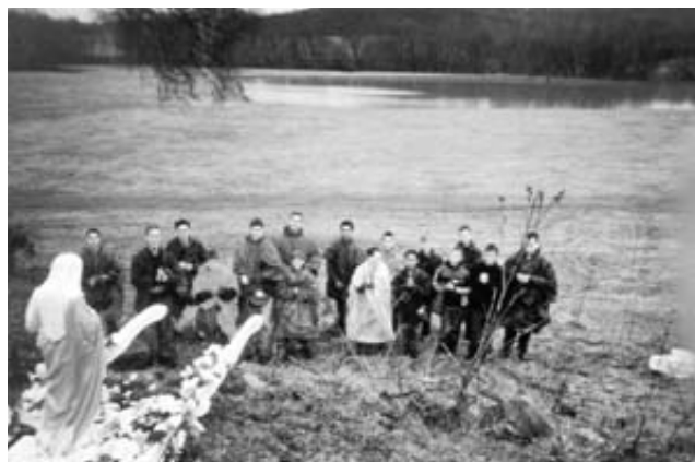
After an impromptu procession of the Blessed Virgin Mary in the rain, they take advantage of a break in the rain to stop and recite the Holy Rosary before the statue of Our Lady.