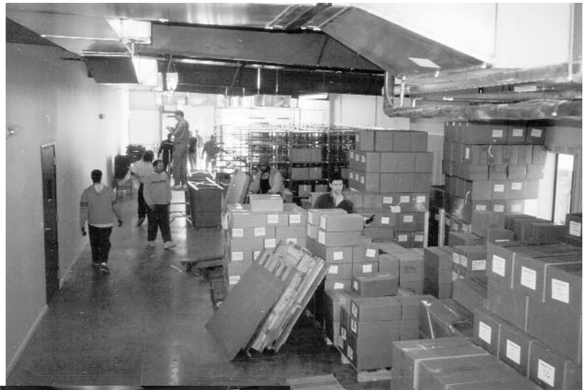
A view of a part of the storage area in the 5,000 sq ft building.