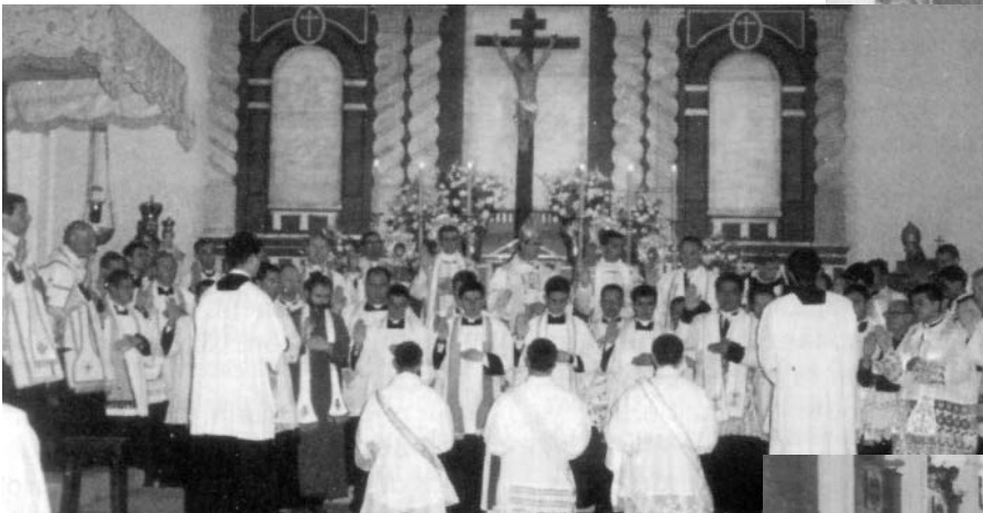
The first ordinations in the new church. The imposition of the hand by all the priests present on the three Argentinians ordained on December 10.