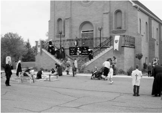
Preparing for the ceremony. The sawdust for the emblem of the ciborium and host, with adoring angels, is prepared by the Sisters in front of the Novitiate chapel.

BROWERVILLE is every year the site of a magnificent Corpus Christi procession, organized by the Sisters of SACRED HEART