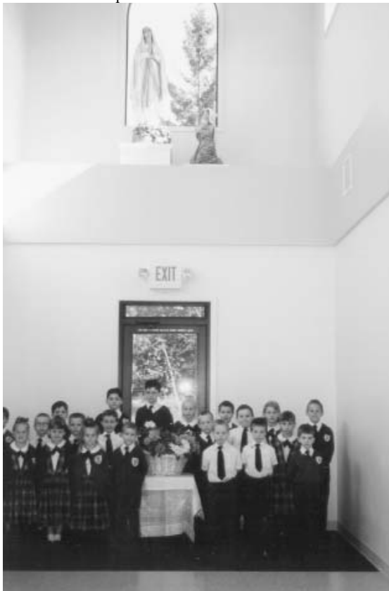
A closer view of the niche of Our Lady of Lourdes, with Kindergarteners and First and Second graders underneath.