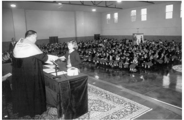
Another view of the remodeled gym, during the lower school awards ceremony.