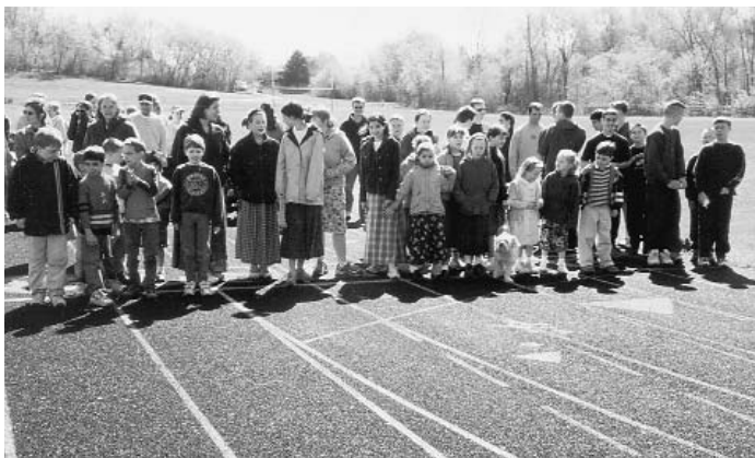
The children of Blessed Virgin Mary, Mother of God Academy get ready to start their annual jog-a-thon, that raised nearly $20,000 to help with the school expenses.