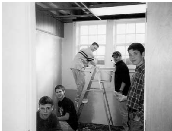
Many hands make light work.