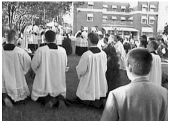
The clergy and some of the faithful seen kneeling before the grotto. The Regina Coeli House can be seen in the background.

This ceremony was followed by an open house for the faithful and friends to visit the operations of the newly installed Angelus Press. Each of the employees explained his or her particular duties, and at the end many of the visitors took advantage of the special discount that was available for everybody