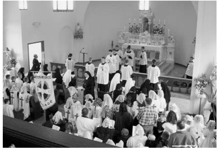
The procession heads out of the Novitiate chapel.