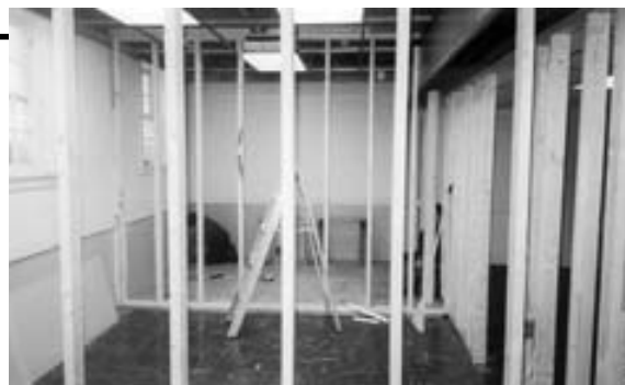
Framing in the new room.