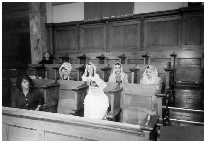
Eucharistic Crusade field trip to Mount Angel Benedictine Abbey on Saturday, April 27. Here some of the Crusaders try out the choir stalls of the famous Abbey church.