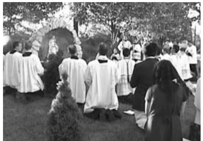
A view of the grotto, as all kneel in prayer to the Blessed Virgin Mary.