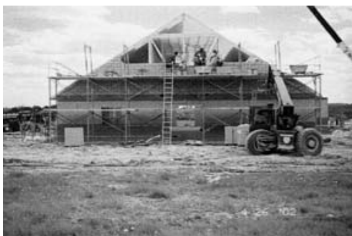
The roof structure in place and stone cladding being added to the front of the building.