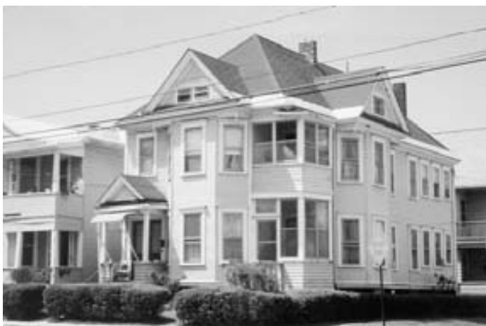
The other two family dwelling, also immediately opposite the church, purchased a couple of years ago to accommodate Sister and the teachers.