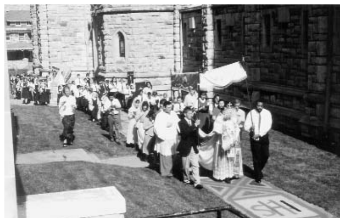
The Blessed Sacrament returns to the church over its specially decorated walkway.