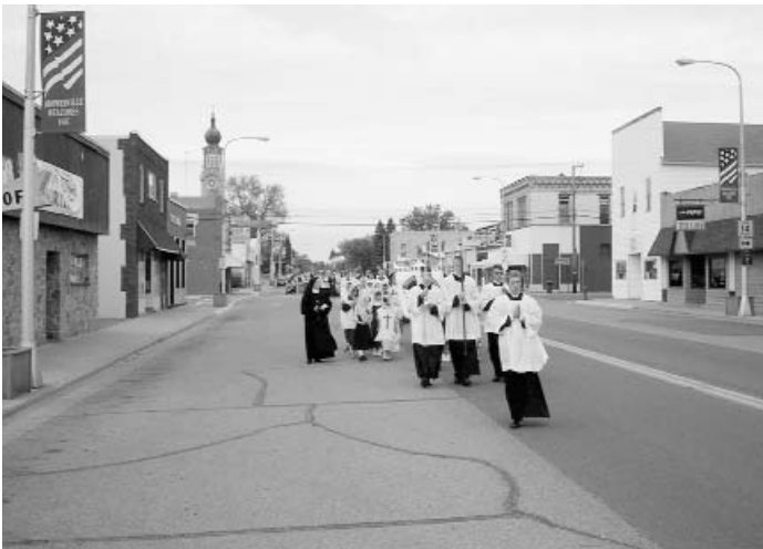
The procession makes its way up the main street of Browerville.