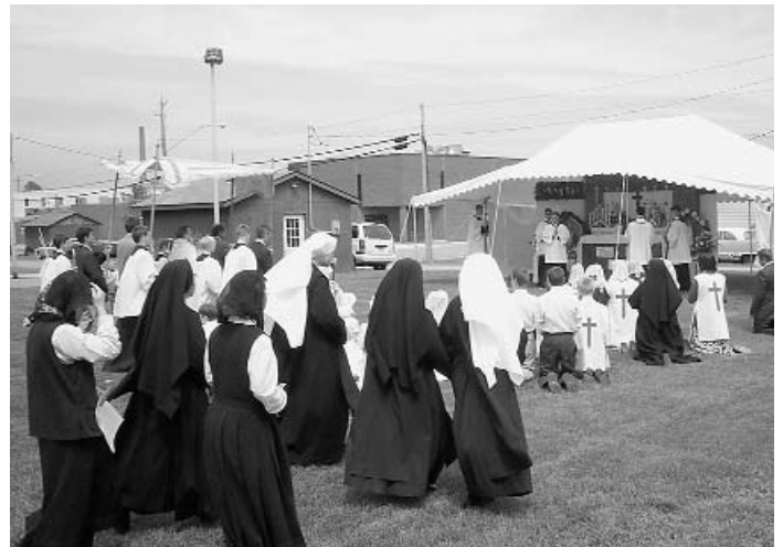
Sisters and Eucharistic Crusaders in adoration before one of the altars, set up on the site of the former St. Peter Catholic Church.