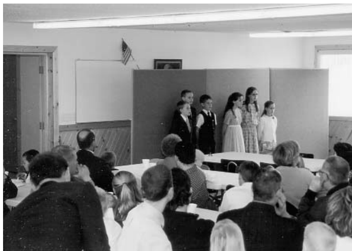
Some of the children express their gratitude to the Bishop by reciting poetry after the ceremony.