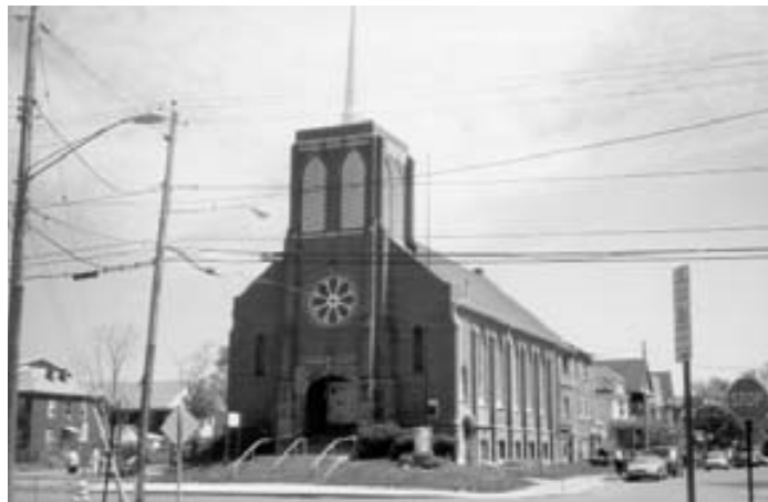
Blessed Virgin Mary, Mother of God church. The school is in an intermediary level between the church and the basement, and the priory is at the rear of the building.