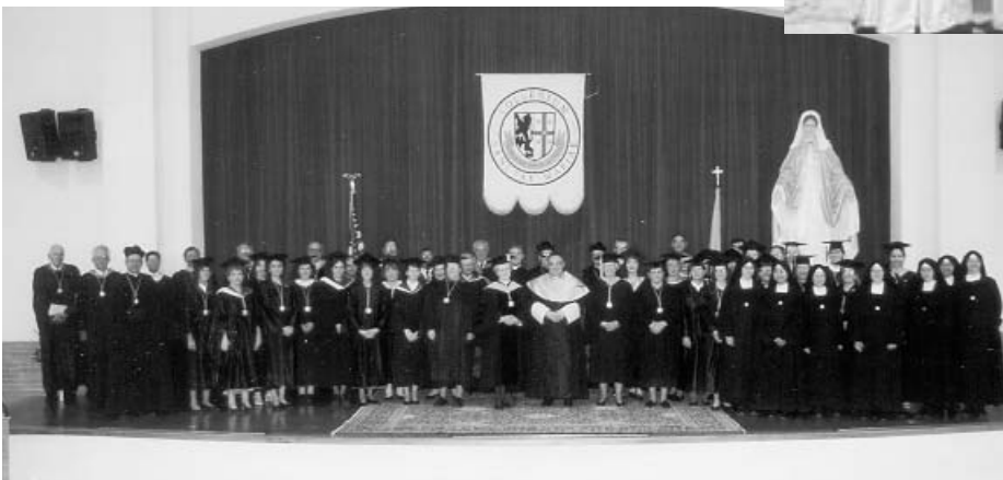
The faculty of St. Mary's Academy and College gathered together in the remodeled gym on graduation day.