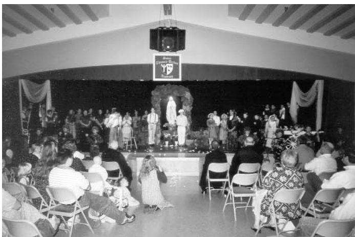
The end of year school program was performed on Thursday, May 30. It was a musical story of pilgrims visiting the Grotto of Our Lady of Lourdes from all over the world.