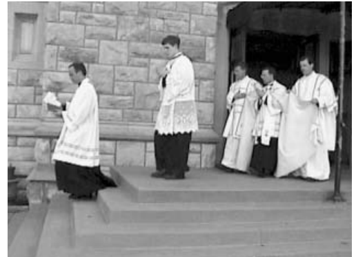
The ministers leave St. Vincent's during the procession, with the District Superior now officiating.

The clergy, the statue, and the faithful process along Tracy Avenue to the Regina Coeli House. The magnificent stone St. Vincent's can be seen in the background.