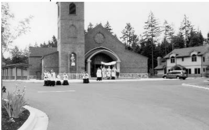
The procession of the Blessed Sacrament leaves the front of the church immediately after Mass. The colorful statue to the left is that of St. Thomas Becket.