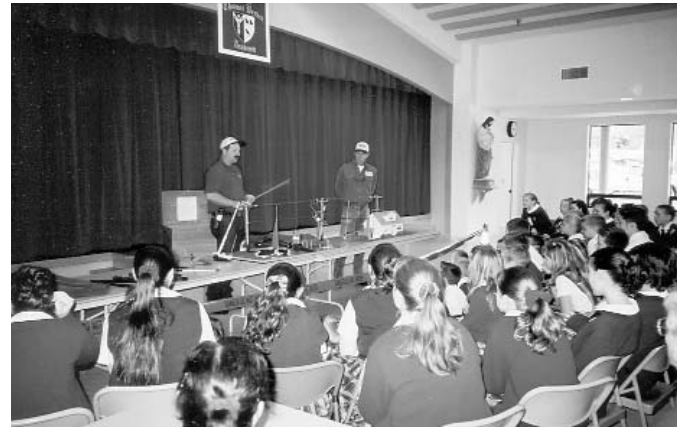
Friday, May 24 one of the parishioners directed an electricity safety demonstration for the children of St. Thomas Becket Academy.