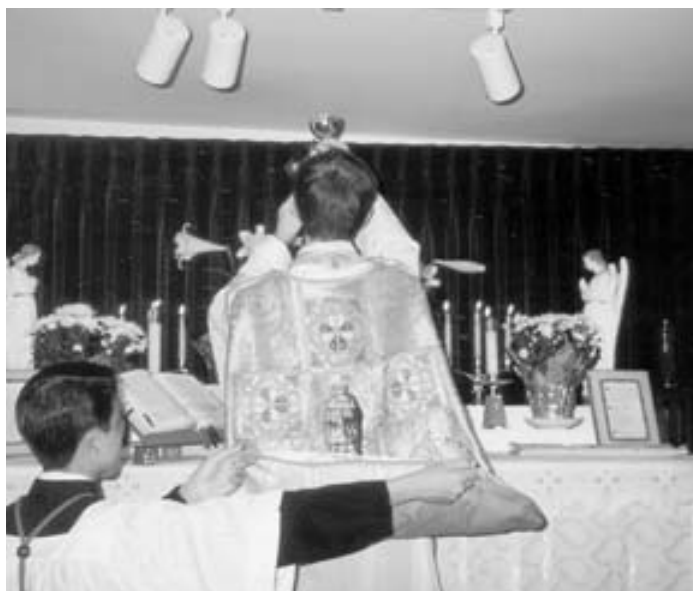
The elevation at the midnight Mass of the Paschal Vigil.