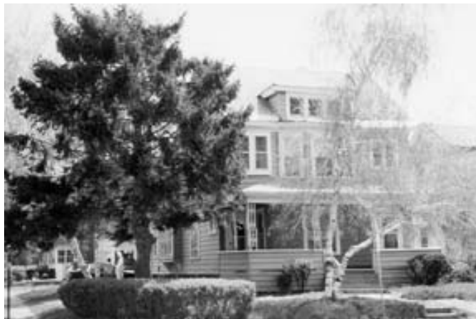
The two-family dwelling, also immediately opposite the church, that has been purchased to accommodate the teachers.