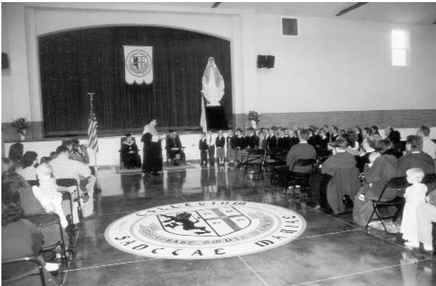
A view of the entirely remodeled and refurbished large gymnasium, now a magnificent auditorium, during the Kindergarten graduation ceremony.