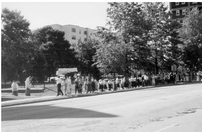
The faithful follow the Blessed Sacrament through the streets of Kansas City.