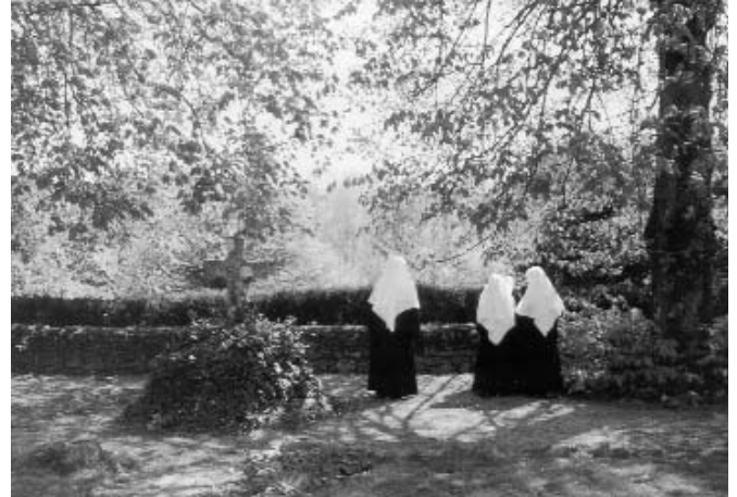
The sisters at recreation in the monastery garden.