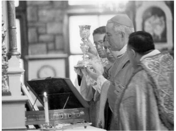
The bishop raises the chalice at the offertory of the Pontifical Mass.