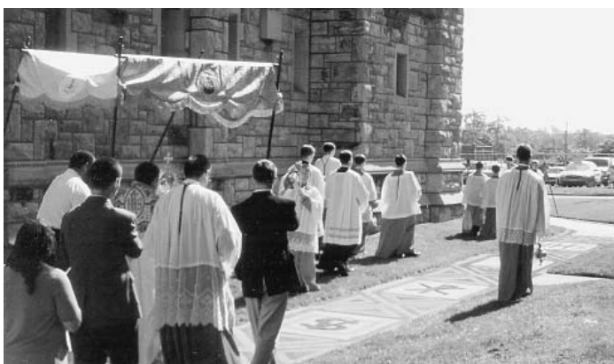
Another view of the procession.