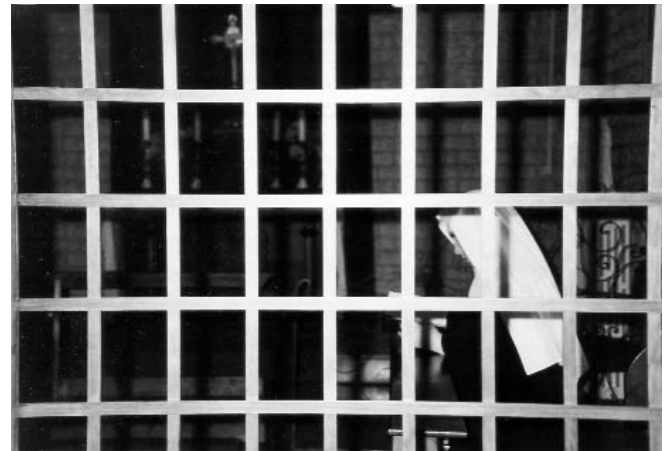
Sisters behind the grill at the prayer of the divine office, the work of God, or Opus Dei , as St. Benedict calls it.