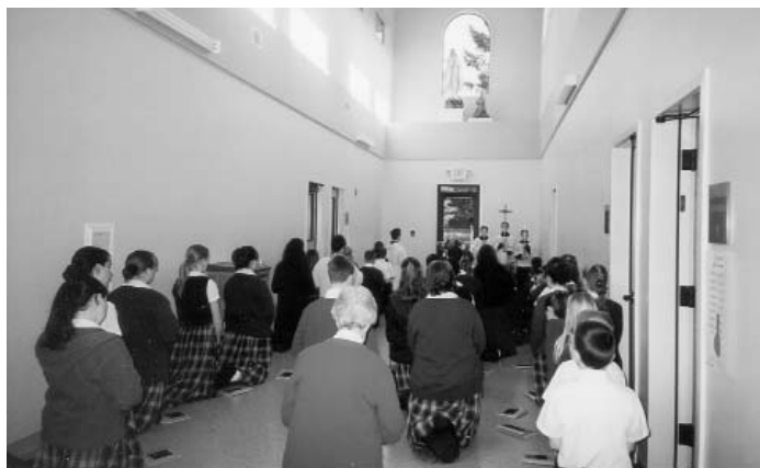
The students of St. Thomas Becket Academy offered their flowers to Our Lady of Lourdes during this procession in the school hallway on Friday, May 3.