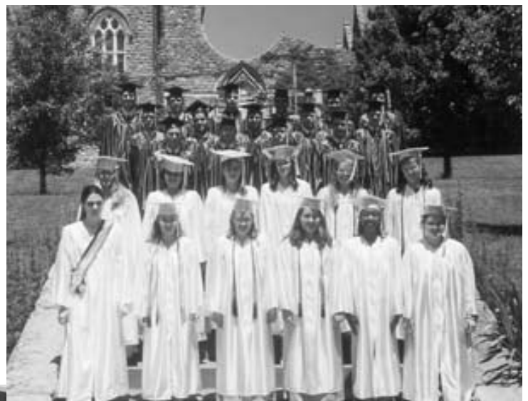
The Academy graduating classes for school year 2001-2002 in front of the ruins of the Immaculata chapel.