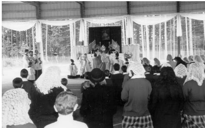
Outdoor Benediction of the Blessed Sacrament under the covered recreation area at the back of the school.