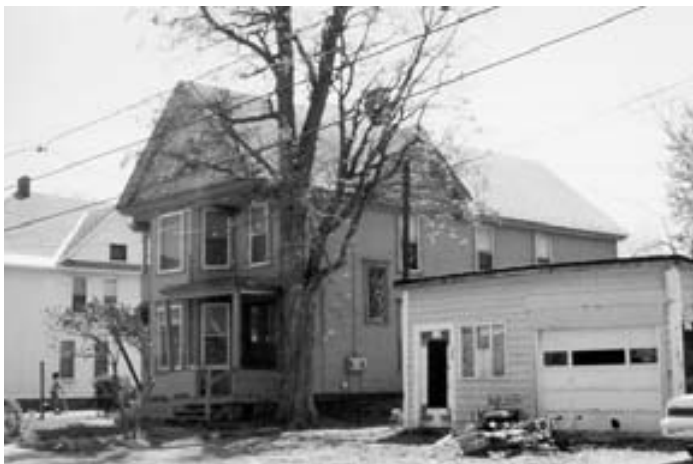
The two properties slated for demolition that were just purchased by the church are immediately opposite the church and school.