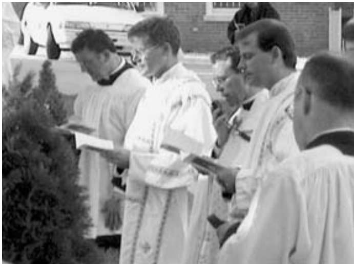
A close-up of the priests, as all recite the formula of consecration.

On arriving at the Regina Coeli House all knelt in veneration of the Blessed Virgin Mary before the outdoor grotto built a couple of years ago. The Litany of the Blessed Virgin Mary was sung, followed by the formula of consecration of the District to the Immaculate Heart of Mary.