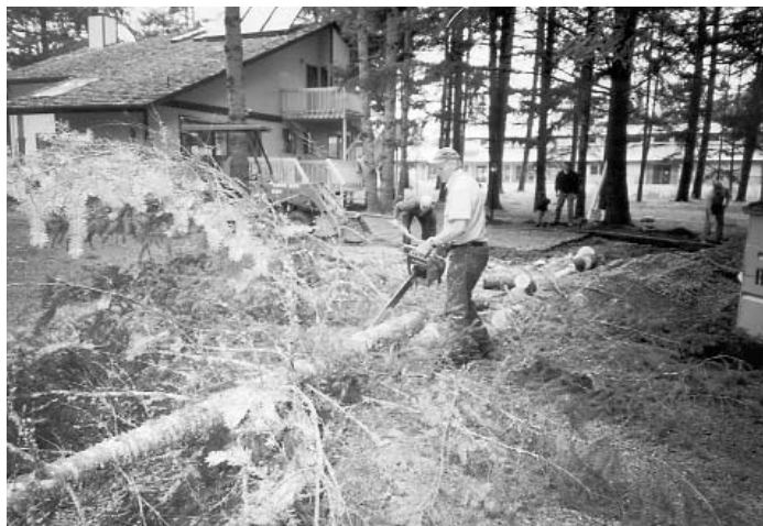
Holy Name workday, Saturday, April 13 brought many men of the Holy Name Society out to clean up the grounds. Here they are seen working on the grounds of the teachers' house. The school can be seen in the background.