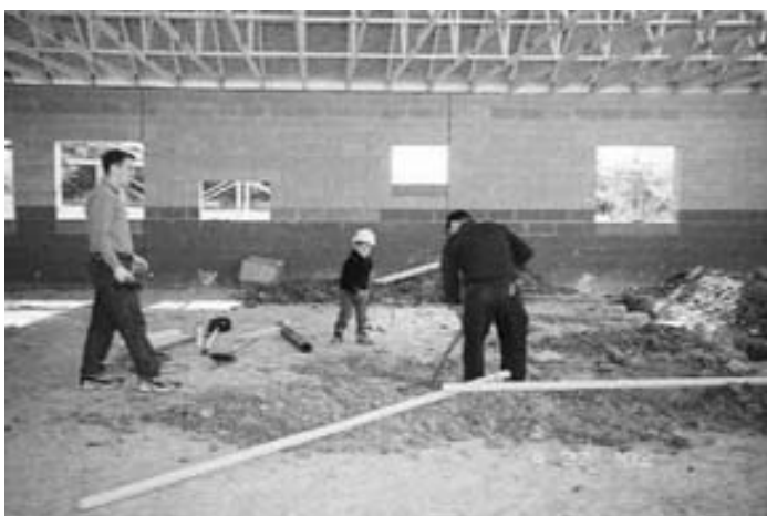
Parishioners work on preparing for the pouring of the concrete floor.

part thanks to the volunteer help of the parishioners, who have invested hundreds of hours into this project, including preparing and finishing the concrete floor.