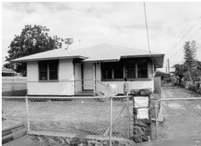
A front view of the house.

The faithful of OUR LADY OF LOURDES in HONOLULU have just been able to purchase a house, in the neighborhood of Ewa Beach. This great deal became available on the island of Oahu where property values are unreasonably elevated. It will need a little work, but will eventually become a great place at which the priest can stay during his few days in Hawaii every month. It will also eventually be remodeled to contain a chapel for daily Masses.