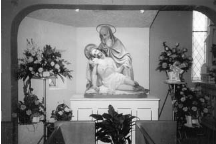
The magnificent statue of the pieta in its permanent place in the side chapel. The parishioners made the base, the lighting and painted the chapel.