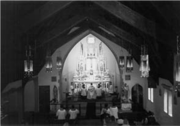
Back inside the church building after the procession for Benediction of the Blessed Sacrament immediately after the Corpus Christi procession.