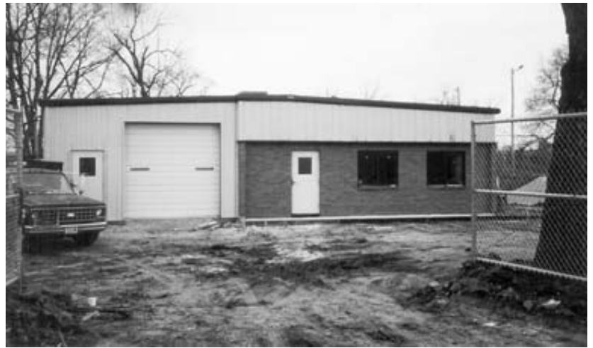
The finished exterior aspect of the building, before the pouring of the cement parking lot.