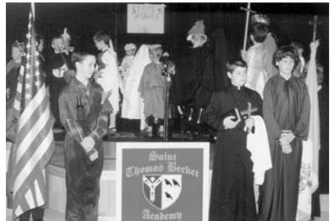
Some of the Saints from the All Saints day party that followed.

An altar was sent up in the indoor-outdoor gym facility, normally used by the school students for gym activities and ball games. Here it was that the consecration of the human race to the Sacred Heart was renewed, as is prescribed for the feast of Christ the King.