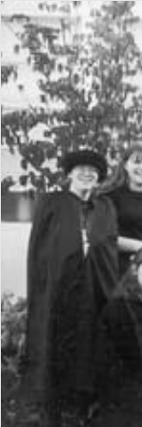
The girls wh