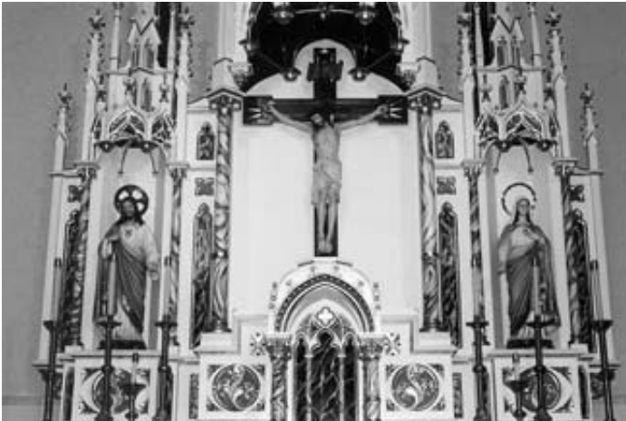
The bright colors of their newly refinished altar cannot be seen in black and white. The parishioners recently purchased matching statues of the Sacred and Immaculate Hearts to complete the altar.

beautification of their church, and are now able to have the ceremonies that were not possible before they purchased their church.