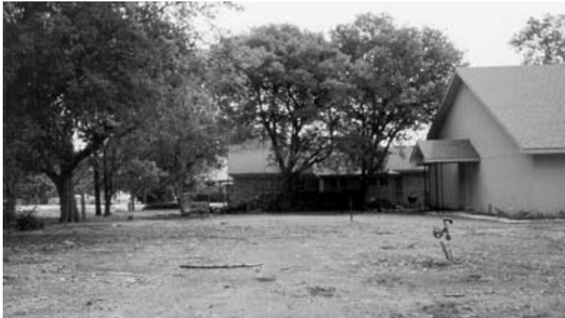
The cleared lot, with the school building to the right and the rectory in the background.

Several years ago the faithful of OUR LADY OF FATIMA in SANGER purchased a small old house to complete the entire city block, which now consists of church, school building and rectory and a couple of vacant lots. However, it was only recently that this old house was demolished.