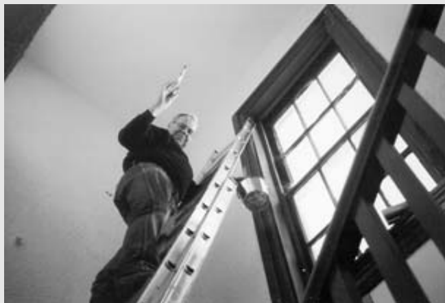
Painting and finishing of the stairway going up to the altar boy sacristy.