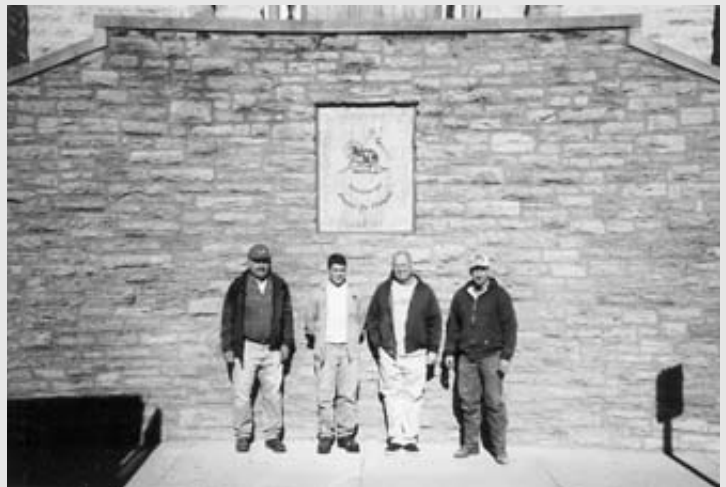
Men of the parish installed a new stone of the paschal lamb, with the inscription in Latin "to restore all things in Christ", at the base of the main steps leading up into the church.