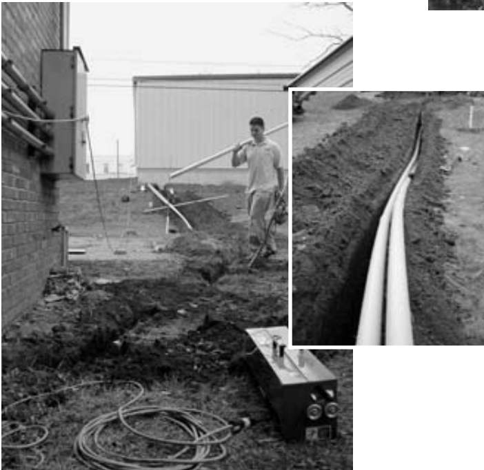
Installing a direct telephone connection between the Regina Coeli House (left), and the Angelus building in the background.