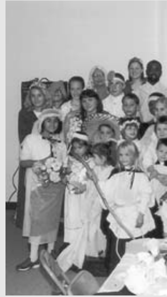
Following themselves. He