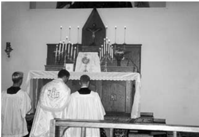
Benediction of the Blessed Sacrament back inside the church.