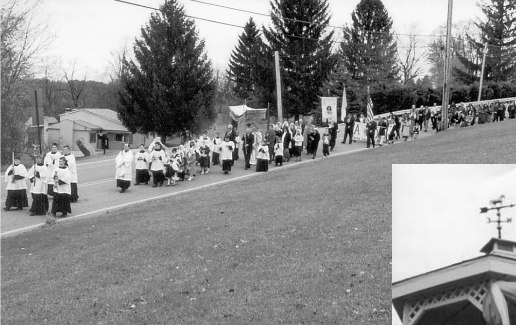
The procession leaves the church property in its beautiful country setting, to head towards a nearby park.

The feast of Christ the King is the high point of the year for OUR LADY OF FATIMA in PITTSBURGH (Carnegie). A lengthy procession of the Blessed Sacrament follows the High Mass, to proclaim the social Kingship of Our Lord Jesus Christ. After lunch the all day activities continues with an All Saints day party. This year, in addition, the girls of the St. Joan of Arc Society (JAS) from the Pittsburgh and Girard (OH) chapels put on an excellent and entertaining presentation of Milne's "The Ugly Duckling".