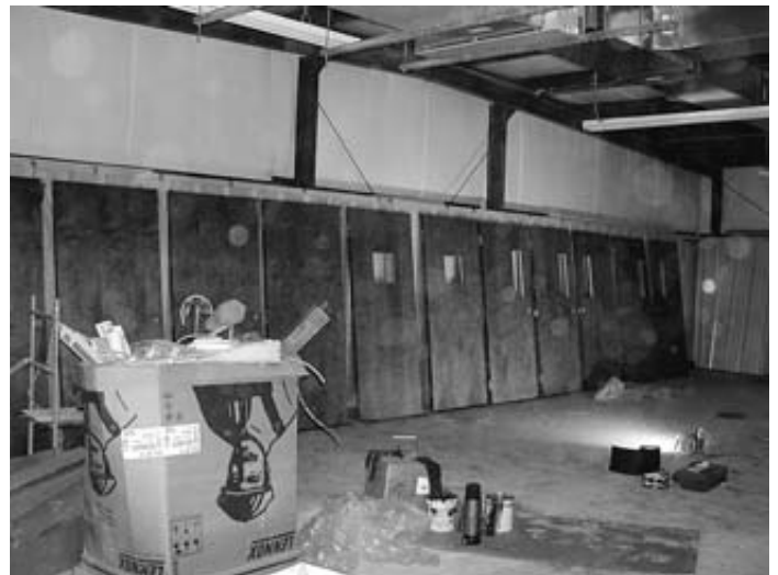
The interior doors all lined up along the side of the shipping and handling area to be stained, before being installed.