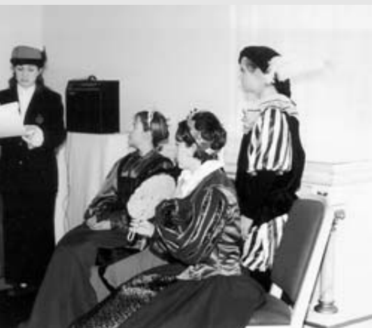
The chancellor reads the riddle that will decide if the suitor prince is worthy or not.