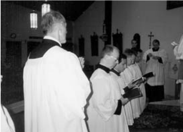
Four of the brother renew their vows in the main church of Our Lady of Sorrows on Saturday September 29.