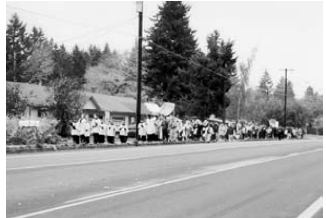
The Eucharistic Crusaders headed up the procession following the Blessed Sacrament.