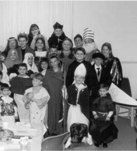
At the dinner the "saints" had the opportunity to present. Here are most of the 48 participants, dressed in costume.