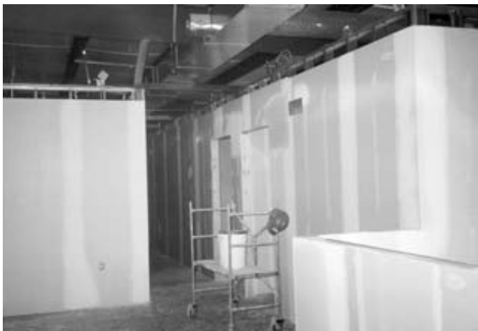
Taping the dry wall in what has now become the main entrance area to the Angelus offices