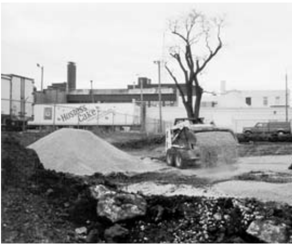
Laying of gravel in the parking lot, in preparation for the pouring of cement.