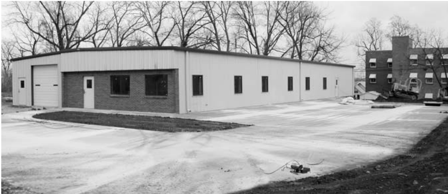
The finished building and parking lot, as seen from the front entrance on Forest, showing its proximity to Regina Coeli House.

T he mild Fall in Missouri this year enabled outside work to continue uninhibited well into December, so that all the exterior work, including the parking lot and landscaping could be finished. The interior finish to the practical new building, including painting and floor coverings was finished in the last couple of weeks before Christmas, thanks to excellent coordination and rapid progress of the work. The delighted Angelus staff were poised to begin their move immediately after Christmas.