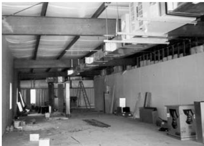
Work on the ductwork in the main storage, shipping and handling area.

T he mild Fall in Missouri this year enabled outside work to continue uninhibited well into December, so that all the exterior work, including the parking lot and landscaping could be finished. The interior finish to the practical new building, including painting and floor coverings was finished in the last couple of weeks before Christmas, thanks to excellent coordination and rapid progress of the work. The delighted Angelus staff were poised to begin their move immediately after Christmas.