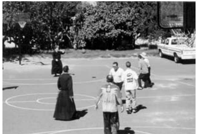
A well-earned recreation in 105 degrees of heat. The brothers realize that it is not easy to compete with the Fathers Pfeiffer when it comes to basketball.