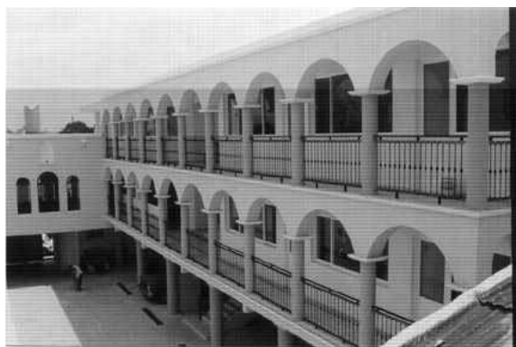
The newly finished school wing at St. Athanasius Priory in Guadalajara.