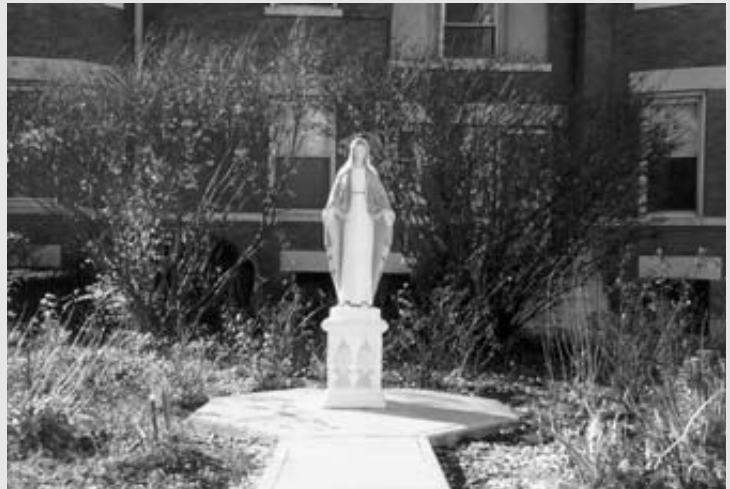
The newly erected hand painted statue of Our Lady of Grace that stands in the courtyard between the church and rectory.

The parishioners of ST. PIUS X in CINCINNATI are continuing their ongoing work to improve their church and rectory facility.