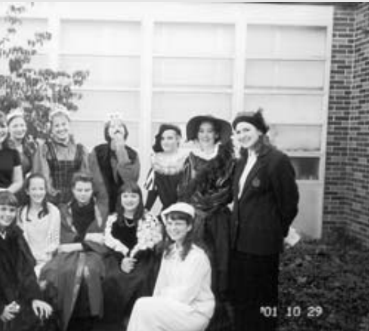
Who made up the cast of "The Ugly Duckling" in costume outside the Pittsburgh chapel (school) building.