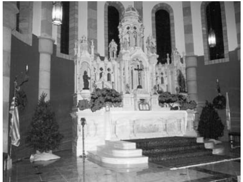
St. Isidore's altar ready for its first Christmas.