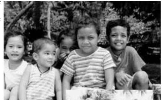
A group of children from the village of Rotuma.