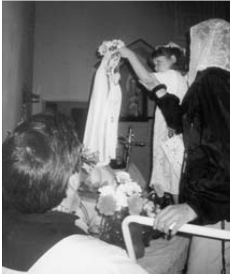
The May crowning ceremony on May 6, 2001