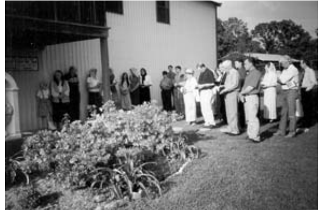
Faithful in prayer as they assist at the blessing of Palms on Palm Sunday 2001. A very tasteful chapel is found within the large metal building.