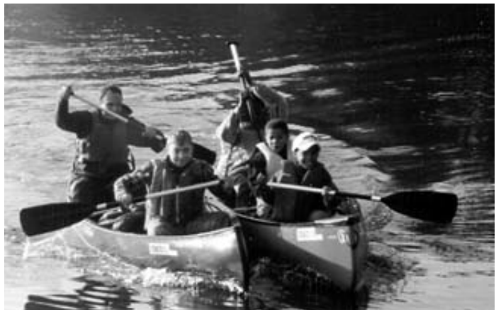
The next morning Father Novak reenacted the battle of Lepanto in the form of canoe races.