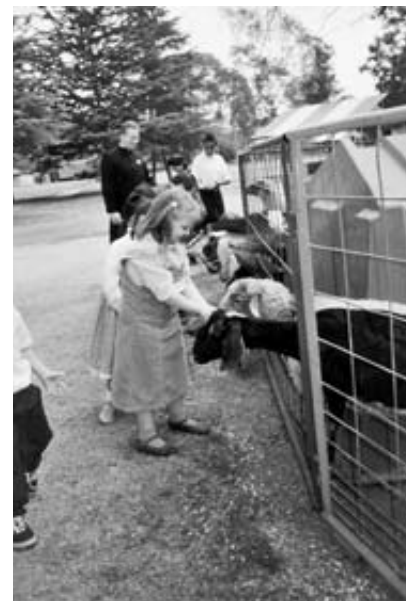
The kindergarteners feed goats and sheep at the farm. They were later able to enter into the corral to become more acquainted with their new friends.