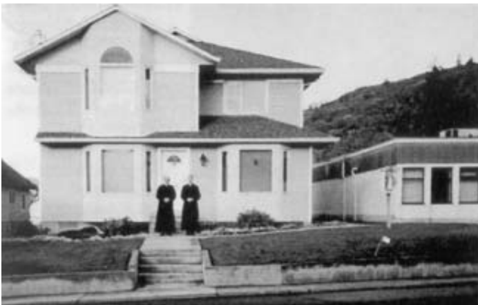
The large residence built by Father Greuter with the Society priests in mind, with three offices as well as the bedrooms.