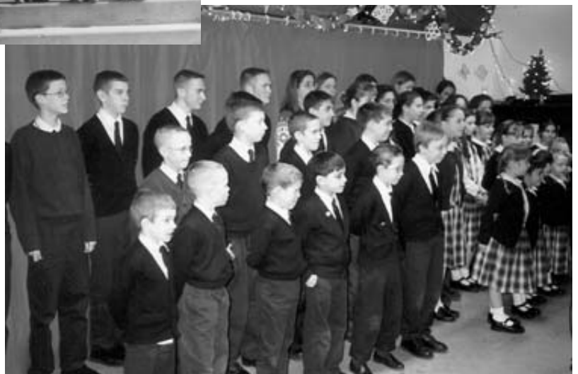
On the same day the high school girls from Immaculate Heart of Mary Academy put on their Christmas play "The Christmas Stranger".