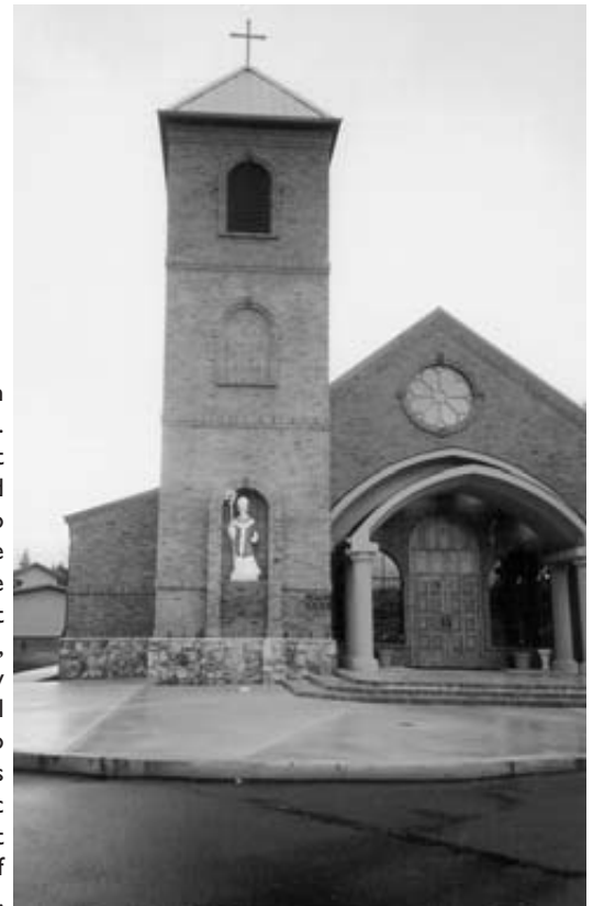
The main entrance to St. Thomas Becket church, guarded by the saint who defended the rights of the Church against secularism, symbolic of how traditional churches exist to defend the rights of the Catholic Church against the invasion of secular novelties.