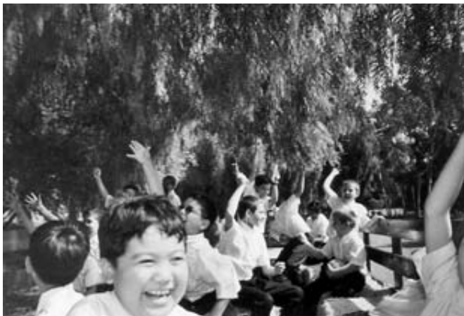
The boys enjoyed the hayride more than anything else.