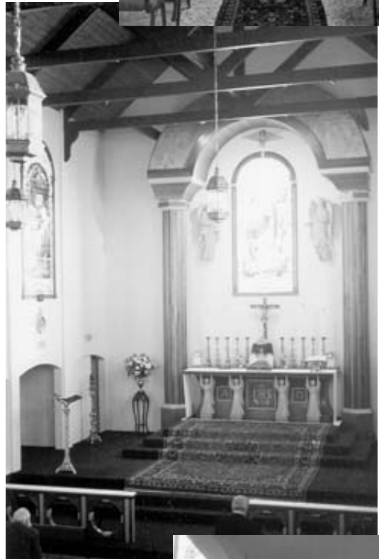
A close up of the main altar, set up for High Mass.