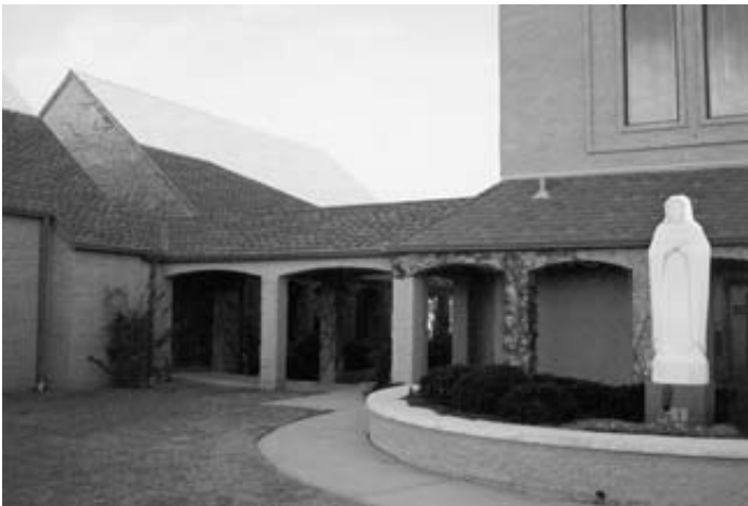
The courtyard with the main entrances into the church, to the right and the rectory to the left.