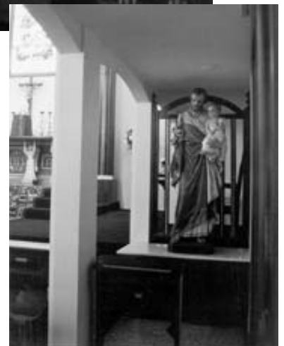
The devotional altar of St. Joseph on the epistle side.