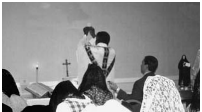
The elevation at Mass in the rented conference room.