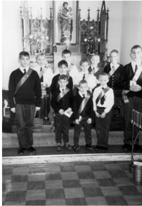
The Eucharistic Crusade boys before the St. Joseph side altar at Mother of God.