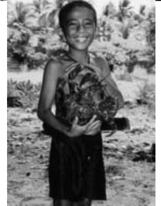
One of the children holding a Coconut Crab.