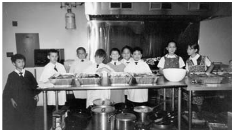
Each of the students received a pumpkin and brought it back to the Academy. Here they can be seen in the parish kitchen slicing, cleaning, cooking, scraping, purifying, mixing, setting and baking pumpkin pie, pumpkin bread and chocolate chip pumpkin cookies, all of which were served at the All Saints party.