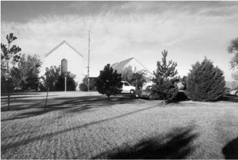
The front yard and parking lot with Queen of Angels chapel to the left and the rectory to the right.