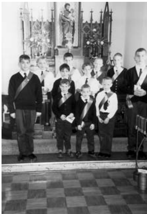
The Eucharistic Crusade boys before the St. Joseph side altar at Mother of God.