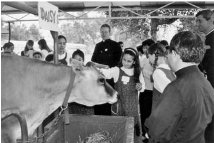
The Fathers and children look on as the instructor explains to the children how to take care of Daisy the cow.