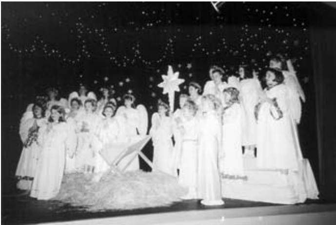
The girls sing with angelic voices during the Christmas program on December 19.