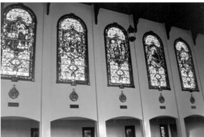
The magnificent stained glass windows on the sides of the nave of the church.