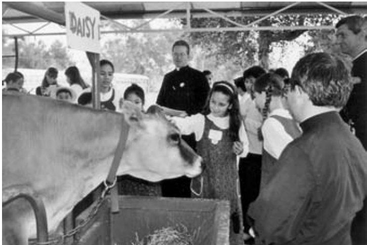
The Fathers and children look on as the instructor explains to the children how to take care of Daisy the cow.