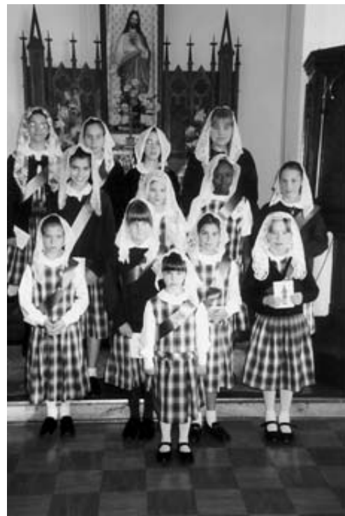
The Eucharistic Crusade girls before the Sacred Heart side altar at Mother of God.