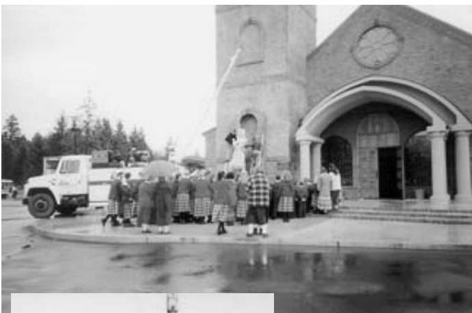
The students of St. Thomas Becket Academy look on as the statue is hoisted up into the niche prepared for it.

The main entrance to St. Thomas Becket church, guarded by the saint who defended the rights of the Church against secularism, symbolic of how traditional churches exist to defend the rights of the Catholic Church against the invasion of secular novelties.