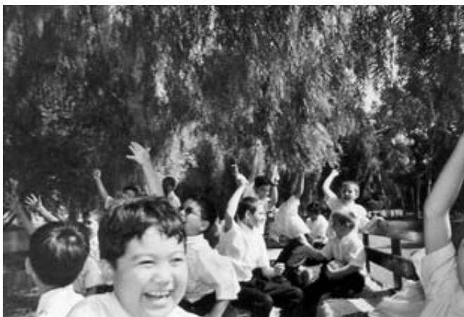
The boys enjoyed the hayride more than anything else.