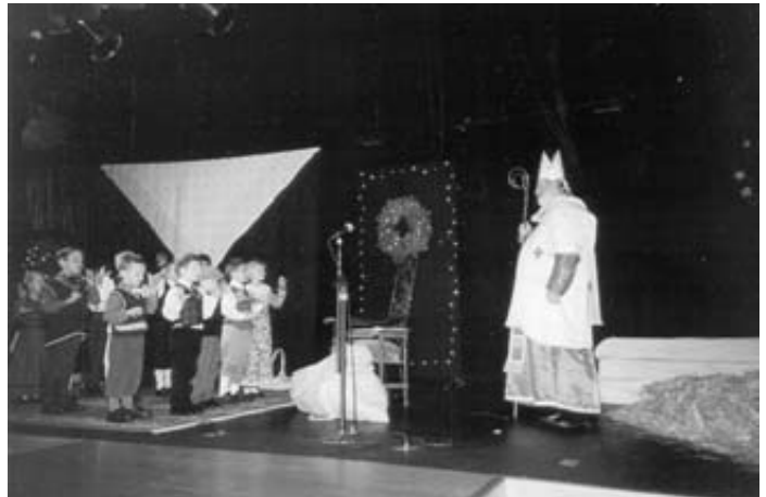
The Christmas program would not have been complete without this surprise visit of St. Nicholas to the little children.