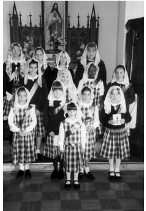
The Eucharistic Crusade girls before the Sacred Heart side altar at Mother of God.