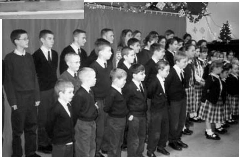
On the same day the high school girls from Immaculate Heart of Mary Academy put on their Christmas play "The Christmas Stranger".