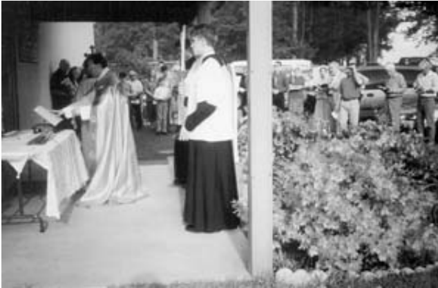
The District Superior, visiting last year, blesses the Palms before the procession that proceeded the Mass.