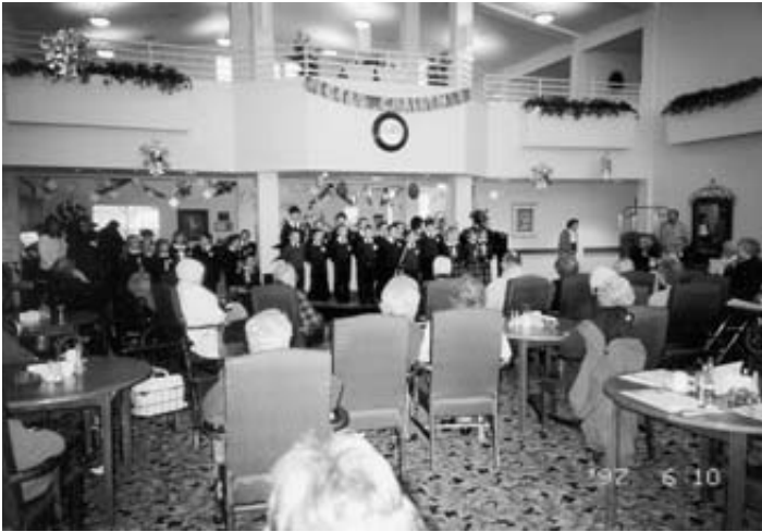
The children of St. Thomas Becket Academy visit a nearby nursing home of December 13 to sing Christmas carols to Senior Citizens.