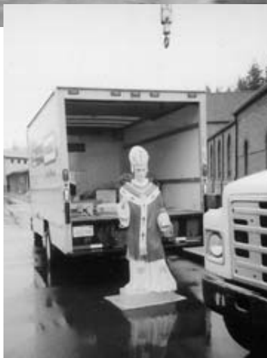
The moving van delivers the colorful statue of St. Thomas Becket in light rain.

The statue made it, and was carefully uncovered. It can barely be seen, but St. Thomas Becket holds a chess piece of a black king in his hand, as a sign of the fact that the king did not overcome him, but was overcome and checkmated by the saint's Faith.