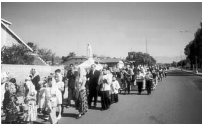
The outdoor procession throughout the surrounding neighborhood that followed the ceremony.