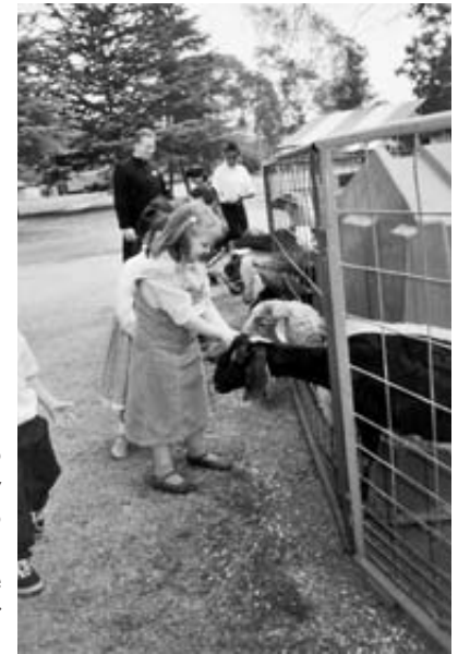
The kindergarteners feed goats and sheep at the farm. They were later able to enter into the corral to become more acquainted with their new friends.