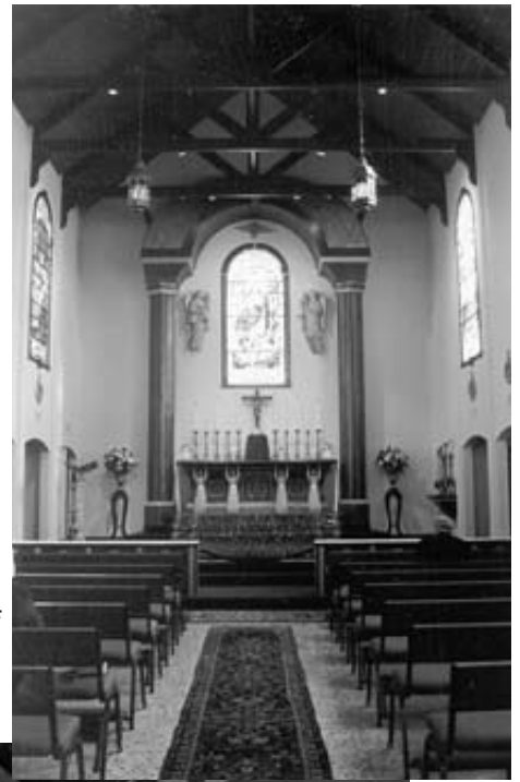
The interior of Queen of Angels chapel.