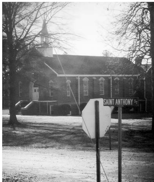
A shot of the church with the new sign in front of it.

At Septuagesima Father Novak resurrected a curious old ceremony from the Middle Ages: the "Depositio" of the Alleluia man, that is the burning of a straw man with Alleluia written on him, symbolizes that there would be no Alleluia until Easter.