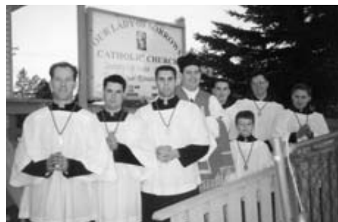
Father Ockerse together with the archconfraternity members outside Our Lady of Sorrows church after the ceremony.