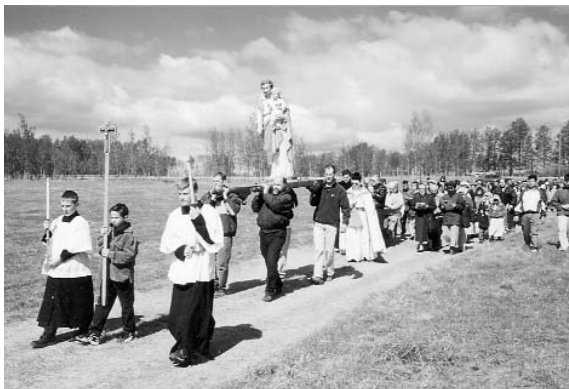
A view of the 150 faithful in attendance for the pilgrimage.