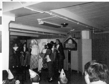
The high school girls wrote and performed their own musical.