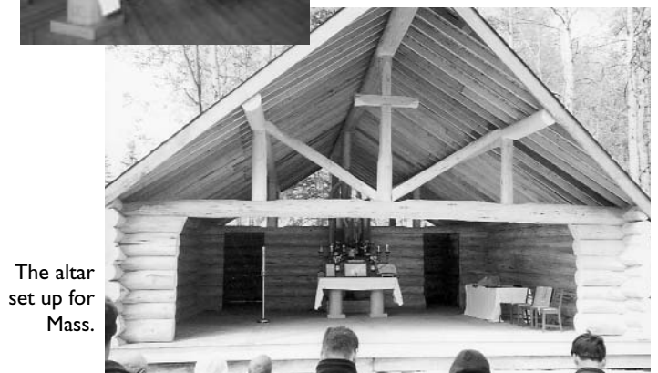
The altar set up for Mass.