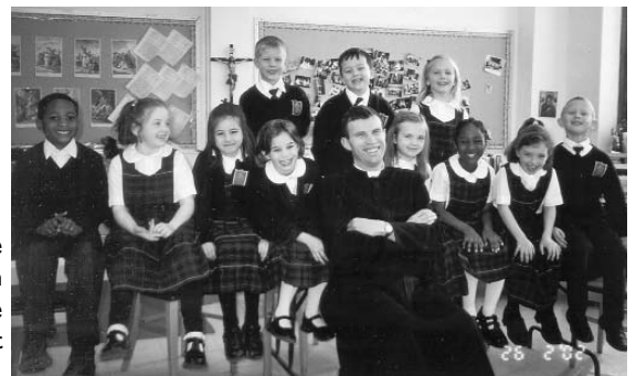
Back in the classroom with the First Graders.