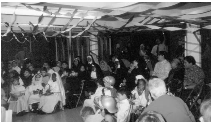
The annual All Saints party in the church basement, with the children dressed in the costume of their favorite saint, waiting to present the life of the saint.

The 65 students of OUR LADY IMMACULATE ACADEMY have worked on several projects over the past few months.