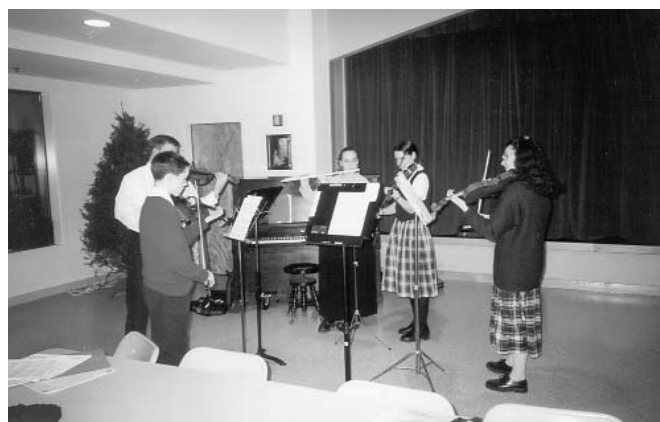
The students practice with their teacher in the parish hall.