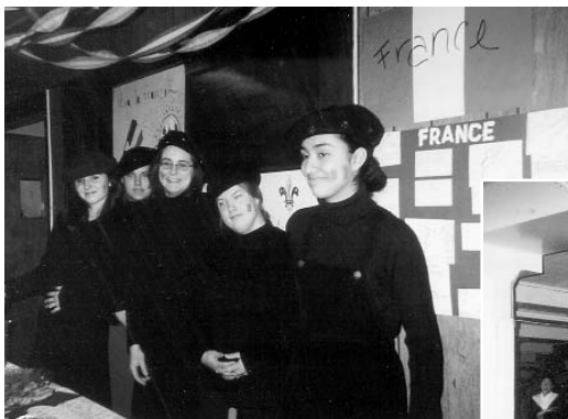
The high school girls chose to serve the culinary delights of France.