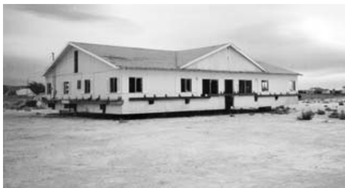
The house sitting on the desert sand, waiting to be converted into a useful building.

the church. The parishioners are now in the process of raising funds and obtaining the permits to have the house placed on a permanent foundation and finished off as a rectory and venue for parish activities.