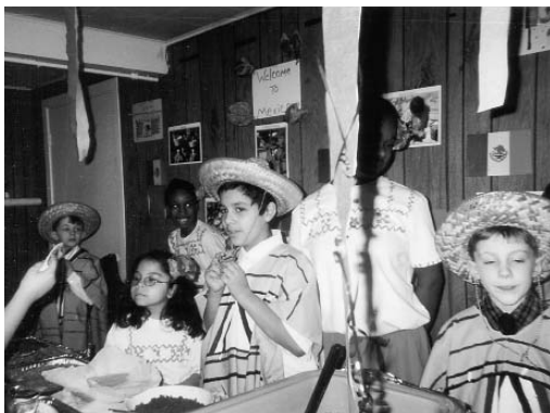
The school students prepared an "Around the world" luncheon fundraiser, with each class choosing a different country, and preparing the food from that country. The 3rd & 4th graders chose Mexico.