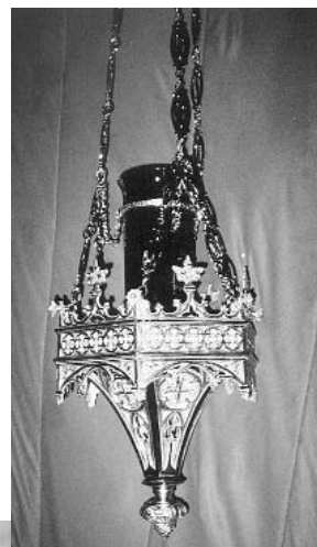
A close up of the sanctuary lamp.