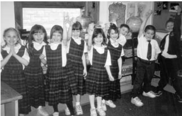
The Kindergarten class from St. Vincent's enthusiastically answering questions.