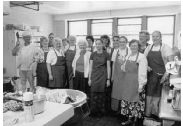
Behind the scenes in the kitchen. The chef together with the ladies that made the meal happen for the 200 invitees in the refectory and for the 1,100 faithful who ate outside.