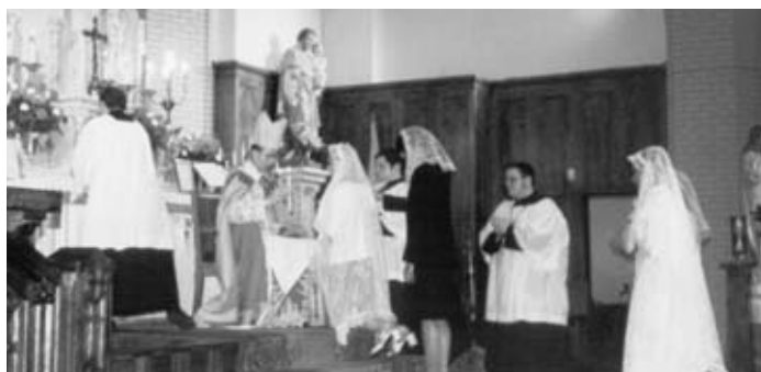
The administration of the matter and form of the sacrament by the bishop on the predella before the main altar.