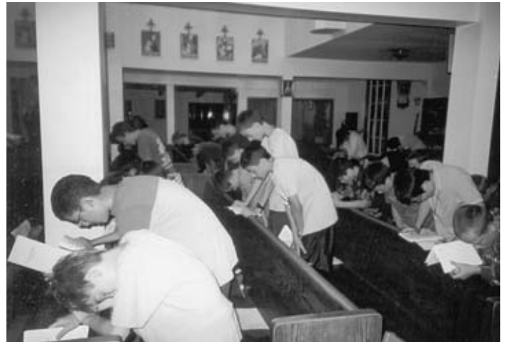
Campers at the boys' camp in July all learnt to recite the office of Compline with the priests. Here they are bowing profoundly for the recitation of the Confiteor .