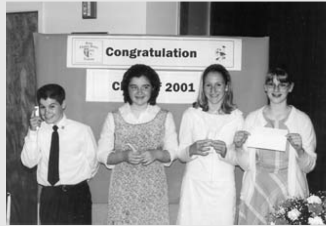
The month of June started with the ceremony of 8th grade graduation. The four graduates will be continuing their high school at the Academy.