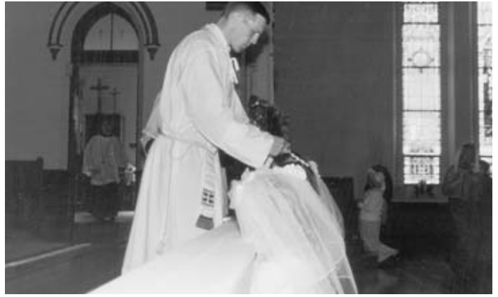
Father enrolls the First Communicants in the brown scapular after Mass.

After Mass on the feast of Corpus Christi, June 14, Father organized a public procession in honor of the Blessed Sacrament throughout the local neighborhood, with the help of the police who closed off the main streets through which the procession passed.