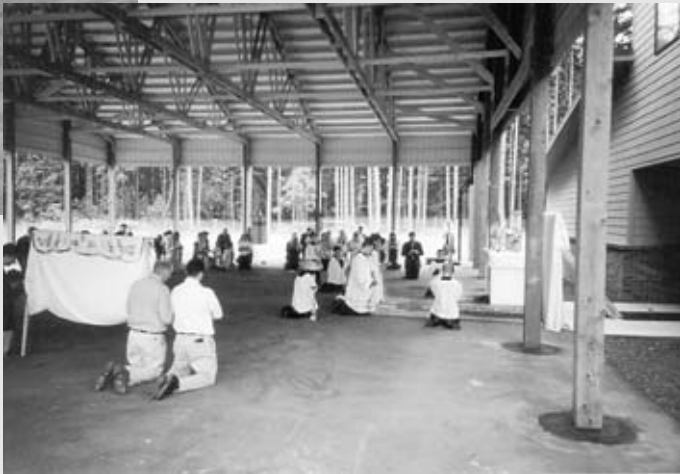
Consecration of the parish to the Sacred Heart of Jesus on Sunday June 24, Solemnity of the Sacred Heart, on an outdoor altar set up in the outdoor gym built for the children's recreation, especially during the winter time.