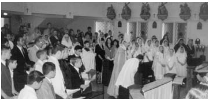
The bishop enters the church for the ceremony of Confirmation. This photo shows the 26 confirmands and their sponsors in the front rows, the girls and women on the gospel side and the boys and men on the epistle side.

Since it was also the Solemnity of Corpus Christi, the bishop led the public procession of the Blessed Sacrament that followed Mass, showing in practice the new confirmands how to be soldiers for Our Lord really present in the Blessed Eucharist.