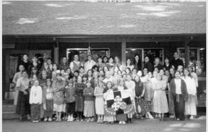
Father, the counselors and the campers in front of the main pavilion, together with the Eucharistic Crusade banner which gave the motto for the camp.