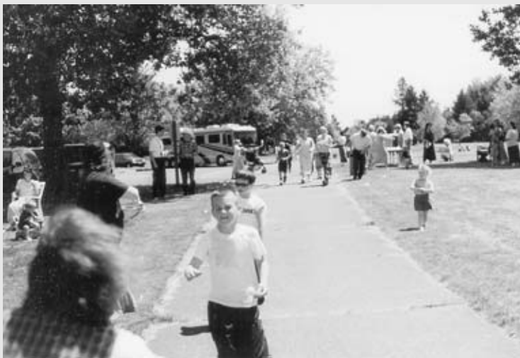
The two boys who won the record certificate of 24 laps of 1/4 mile in one hour.