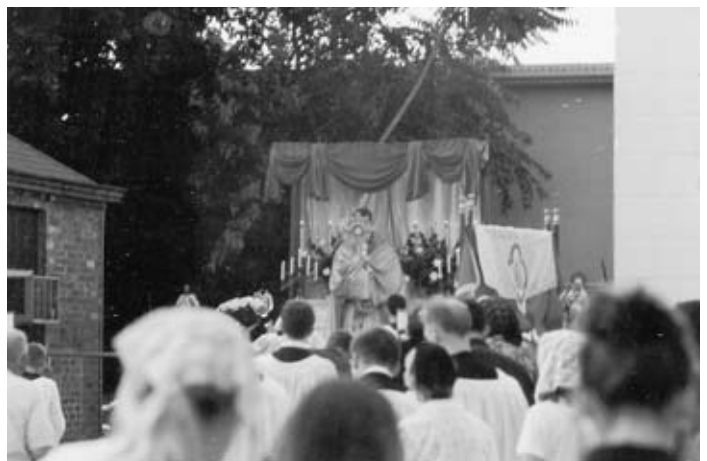
Benediction of the Blessed Sacrament at another of the outdoor altars.