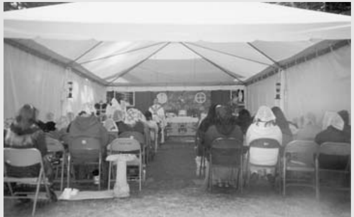
Father Novak preaches in the outdoor tent chapel on the day of enrollment of girls into each of the three levels of the Eucharistic Crusade.