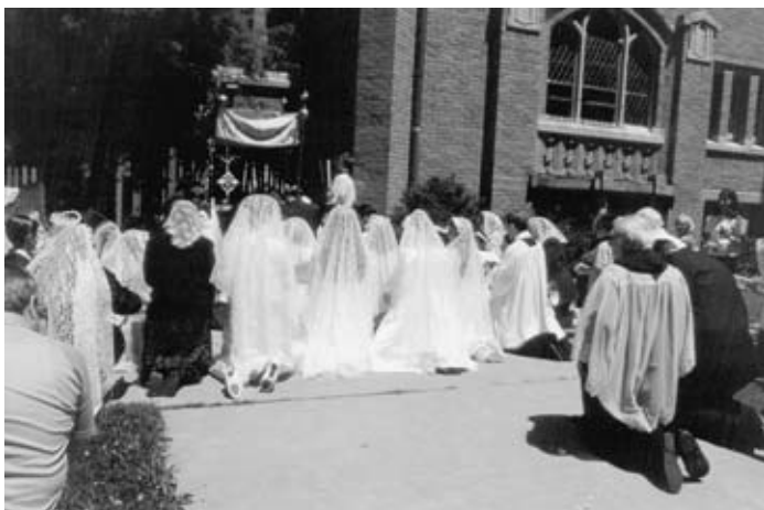
Confirmands and parishioners kneel in adoration before the Blessed Sacrament at an outdoor altar set up for Benediction.