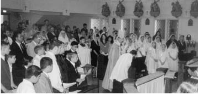
The bishop enters the church for the ceremony of Confirmation. This photo shows the 26 confirmands and their sponsors in the front rows, the girls and women on the gospel side and the boys and men on the epistle side.

Since it was also the Solemnity of Corpus Christi, the bishop led the public procession of the Blessed Sacrament that followed Mass, showing in practice the new confirmands how to be soldiers for Our Lord really present in the Blessed Eucharist.