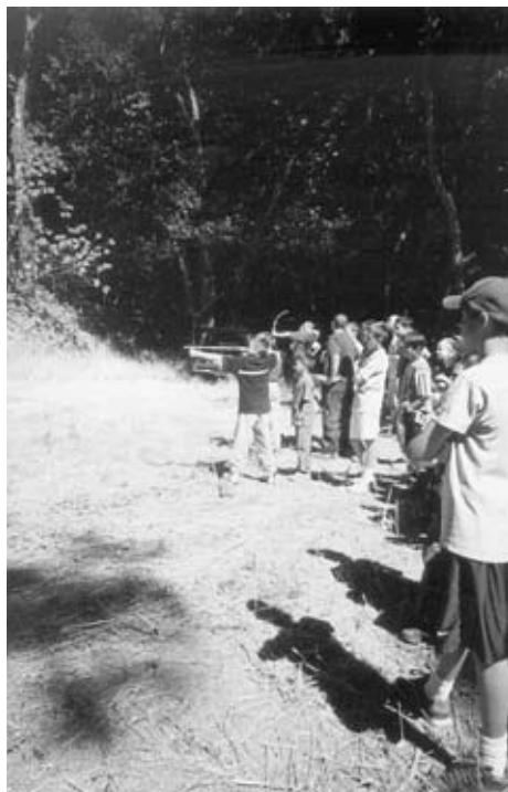
Archery competitions on the retreat house grounds.