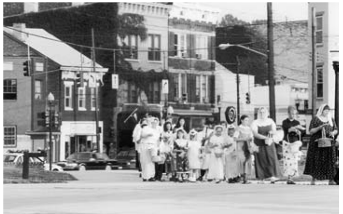
Another view of the women and children leading the procession.