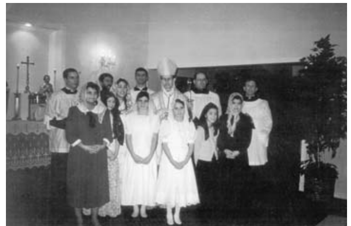
The bishop together with the altar boys and seven confirmands in front of the altar that had been set up for the Holy Sacrifice of the Mass.