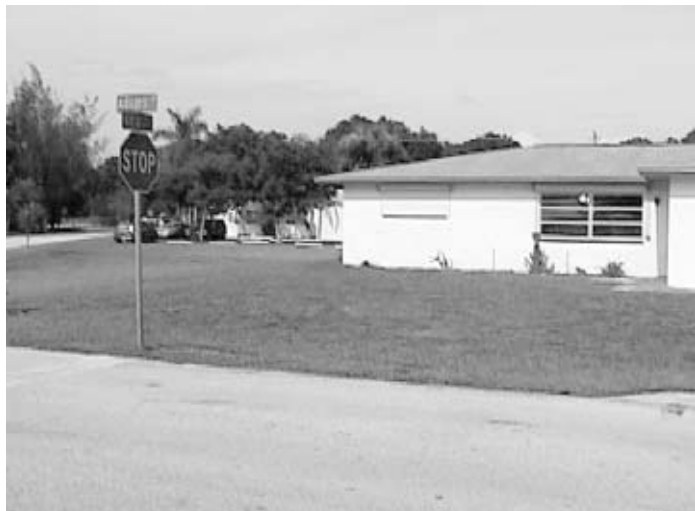
The new three-bedroom rectory, with the church and parish hall complex in the background.

Like all of our chapels, our faithful there are hopeful of one day having resident priests. However, in the meantime Father has certainly a more restful place to spend Sunday nights before his trek back to his home base in Davie, FL.