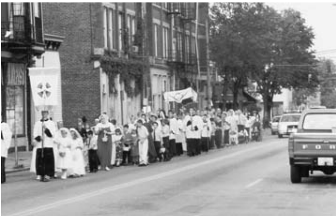
The procession heads down the main street, with the children of the Eucharistic Crusade sprinkling flower petals in honor of their God.

After Mass on the feast of Corpus Christi, June 14, Father organized a public procession in honor of the Blessed Sacrament throughout the local neighborhood, with the help of the police who closed off the main streets through which the procession passed.