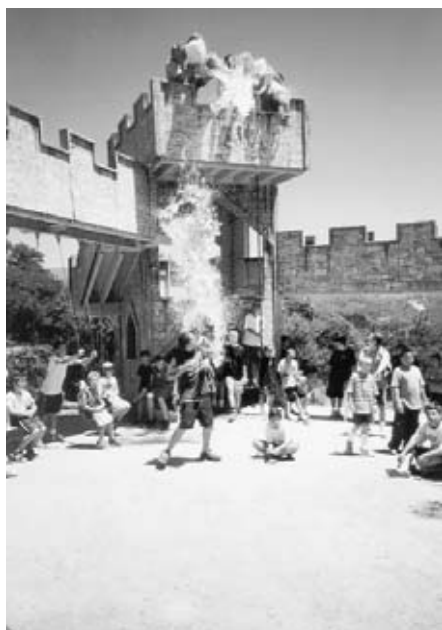
Event of the camp: —a totally unexpected ambush of the campers by the counselors from the castle, while the campers were sitting around like sitting ducks at the end of the camp.