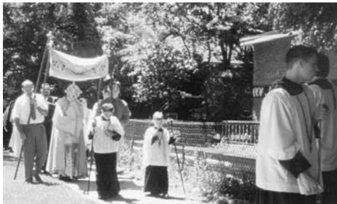
The bishop takes the Blessed Sacrament through the neighboring streets.