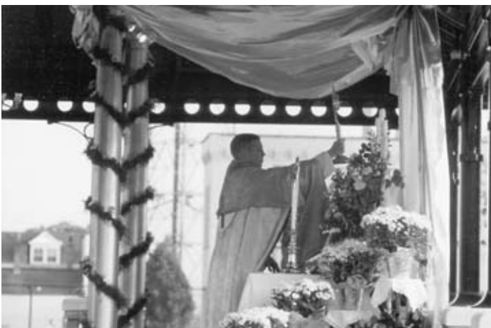
Father places the Blessed Sacrament on the throne of one of the outdoor altars set up for Benediction of the Blessed Sacrament.