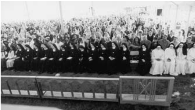
The crowd in attendance at the ordinations ceremony, flowing out from all sides of the tent, with the sisters in front.