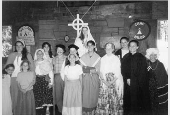
The girls who performed the play on St. Bernadette.