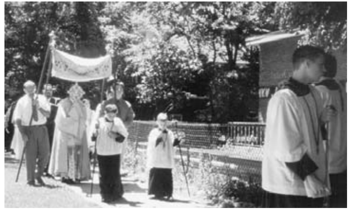
The bishop takes the Blessed Sacrament through the neighboring streets.