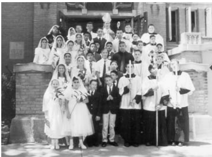
The bishop, altar boys and confirmands on the front steps of the church.