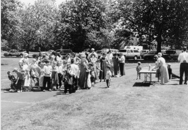
St. Thomas Becket Academy held its annual jog-a-thon on May 25, the students raising in this way $12,000 for their Academy. Here the little children prepare to take off.