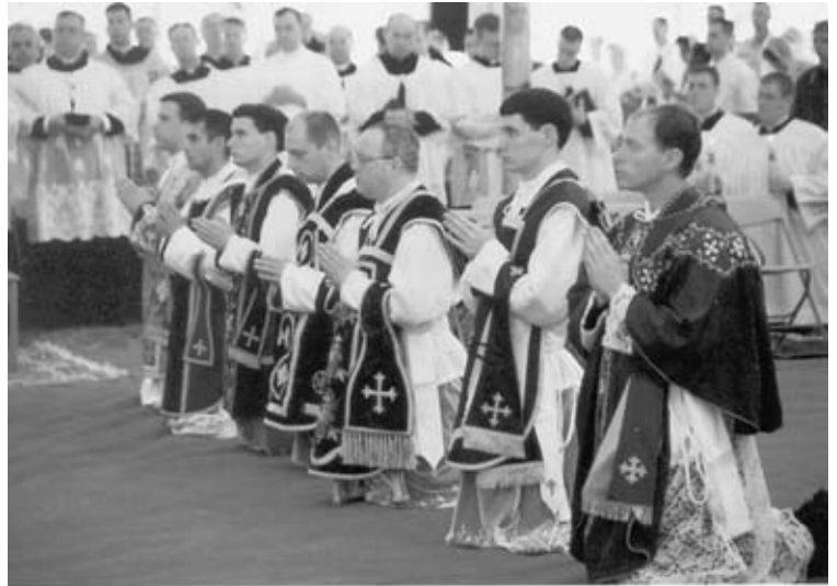
The seven newly ordained priests attentive while the bishop prays for them during the ceremony.