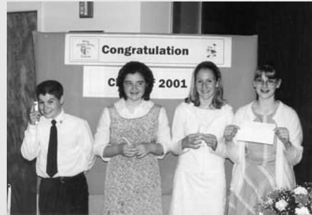
The month of June started with the ceremony of 8th grade graduation. The four graduates will be continuing their high school at the Academy.