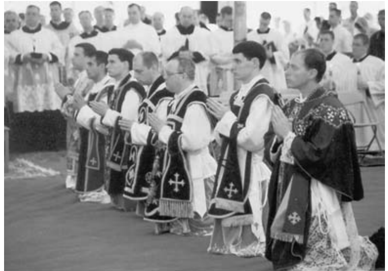
The seven newly ordained priests attentive while the bishop prays for them during the ceremony.