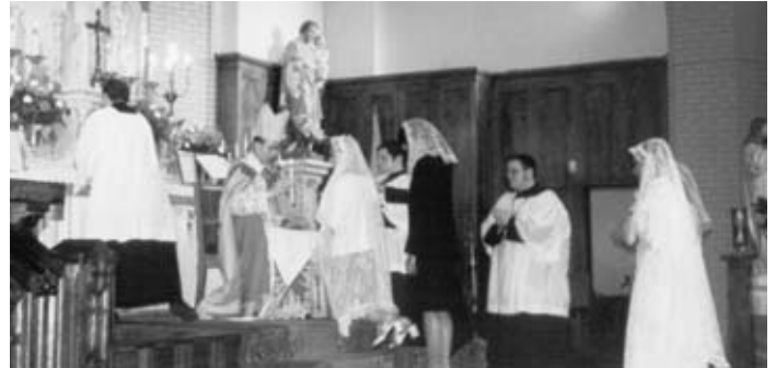
The administration of the matter and form of the sacrament by the bishop on the predella before the main altar.