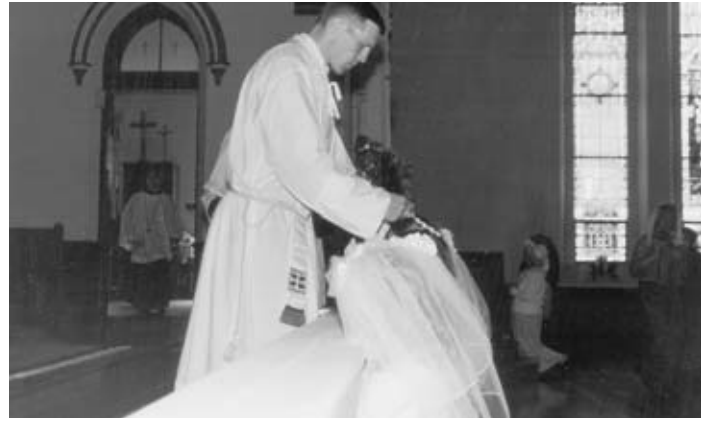
Father enrolls the First Communicants in the brown scapular after Mass.

After Mass on the feast of Corpus Christi, June 14, Father organized a public procession in honor of the Blessed Sacrament throughout the local neighborhood, with the help of the police who closed off the main streets through which the procession passed.