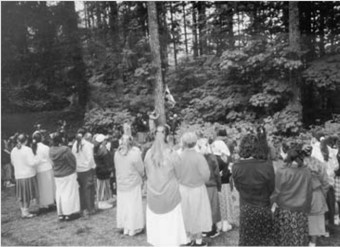
The raising of the Eucharistic Crusade flag took place every morning, together with the singing of "Sing Crusaders, Sing with Might".