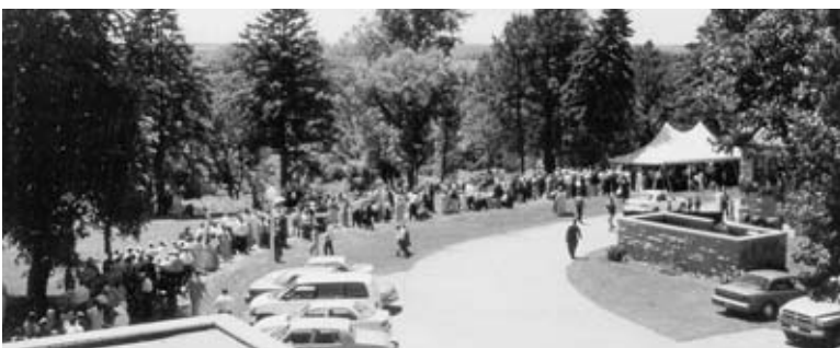
This view from the Seminary roof shows the faithful waiting patiently in line to pick up their meal after the ceremony.