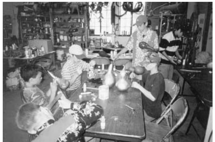
Boys paint gourds during the arts and crafts class.