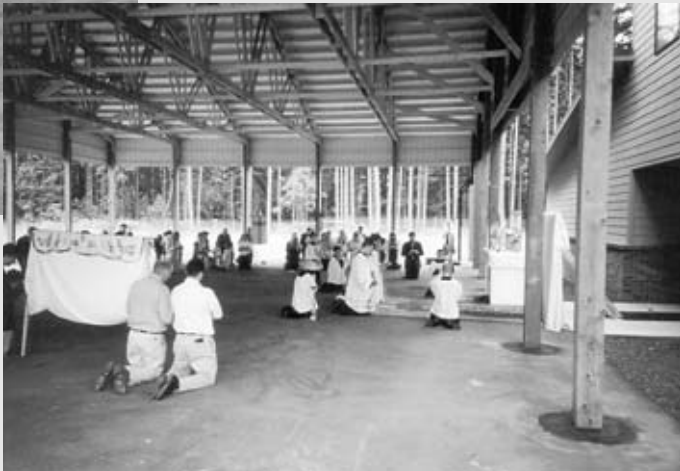
Consecration of the parish to the Sacred Heart of Jesus on Sunday June 24, Solemnity of the Sacred Heart, on an outdoor altar set up in the outdoor gym built for the children's recreation, especially during the winter time.