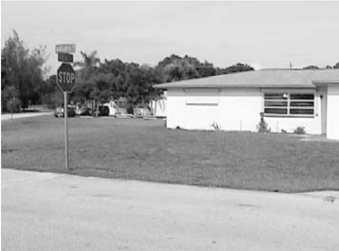
The new three-bedroom rectory, with the church and parish hall complex in the background.

Like all of our chapels, our faithful there are hopeful of one day having resident priests. However, in the meantime Father has certainly a more restful place to spend Sunday nights before his trek back to his home base in Davie, FL.