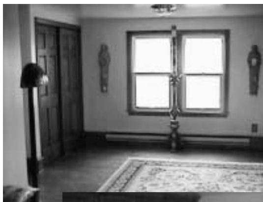
The large well-lit sacristy.

One of the big projects worked on last year was a complete remodeling of the sacristy at ST. JOSEPH'S in ARMADA . Instead of being exiled to a dingy hole in the basement, it is now a large lighted room with direct access to the sanctuary of the church. This became particularly urgent not