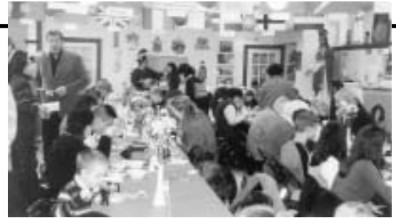
Parishioners lunch in the parish hall, with a multitude of flags hanging from the ceiling.