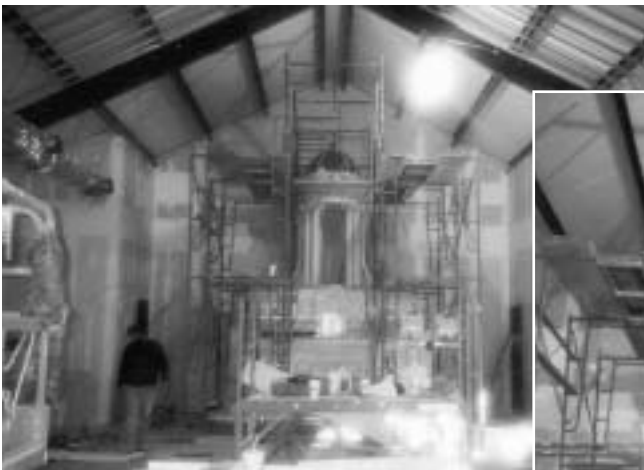
A view of the sanctuary area during the two month reassembling of the altar.