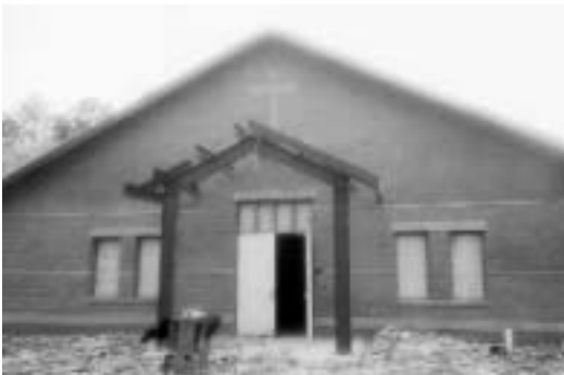
The front entrance, that will lead into the parish hall and kitchen area and via a hallway into the church.