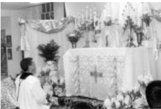
St. Jude's parish hall in the church basement has many different uses. Here it is as used for the altar of repose on Holy Thursday.