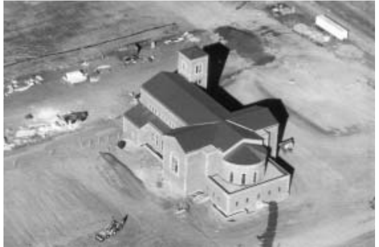
The view of St. Isidore's seen by the thousands of travelers that land and take off at the nearby Denver International Airport every day. The magnificent proportions and the cruciform structure can best be seen from the air.

Despite several delays caused by the scarcity of competent workers in these specialized fields and decisions by the planning commission, the ceremony for the consecration of St. Isidore's will take place on Saturday, August 18, to be officiated by the Superior General of the Society of Saint Pius X, H.E. Bishop Bernard Fellay. It will be a gratifying consolation after several years of planning, work and generous donations by the parishioners.