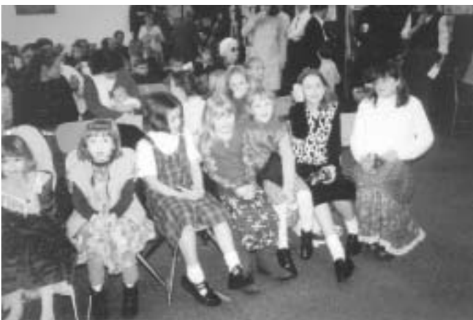
Young and old alike watch as the auction goes on.