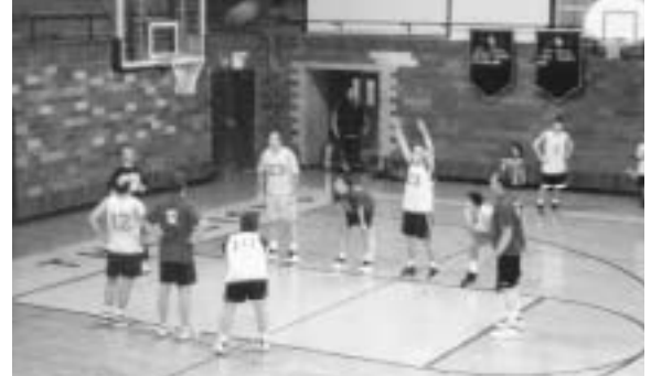
The teams from the Society's chapels in Cincinnati and Chicago do battle on the court.