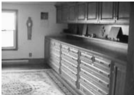
The magnificent set of built-in vestment chests in the sacristy.