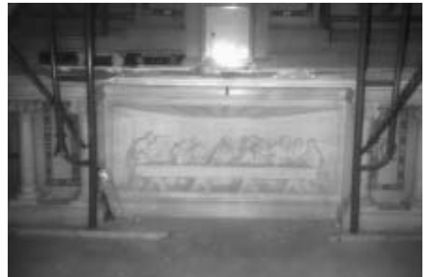
Reassembling the large marble altar in the sanctuary.