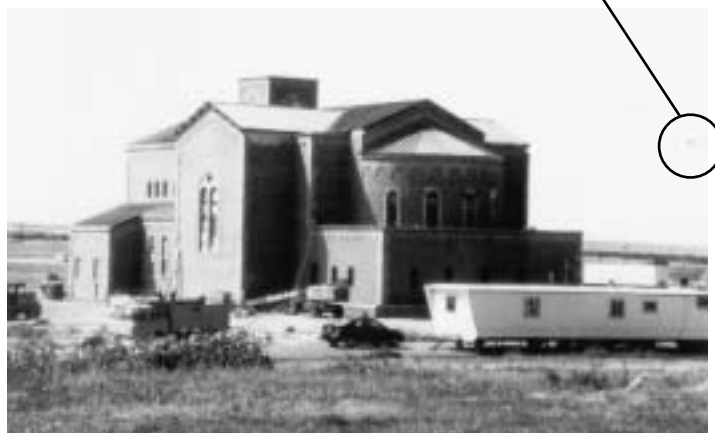
(Below) The brick and stone exterior as it appeared in the Fall of 2000, taken from behind the rear of the church. At the center right edge of the photo an airplane can be seen coming in to land at DIA.