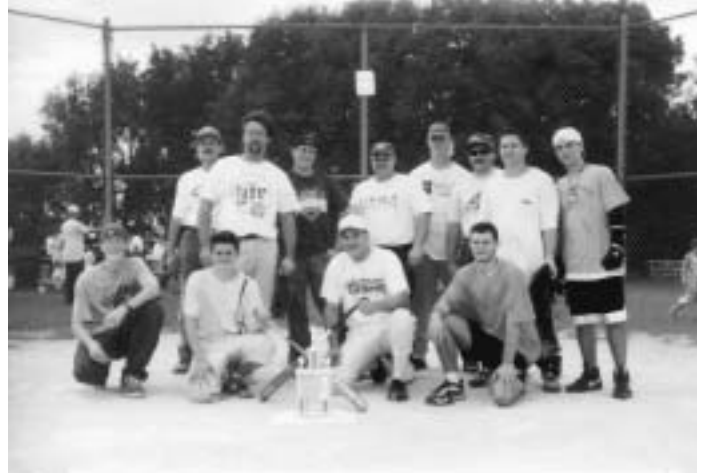
The winning team, the St. Robert Bellarmine Cardinals.

Immaculate Heart of Mary Academy recently held its fifth annual Our Lady of Guadalupe Table fundraising auction at the Academy building in Oak Grove, MN. It was an afternoon of fun for all, as they vied to obtain some of the valuable items up for bid, including handmade bookcases, a birdhouse, religious pictures etc. $4,800 was raised for the Academy.