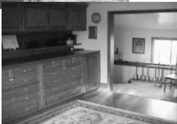
Direct access to the church from the sacristy.