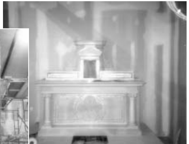
One of the two side altars that was also re-erected in the church.