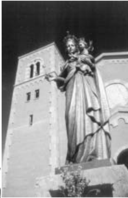
The 1000 pound Italian bronze statue of Our Lady Help of Christians stands outside the main entrance of St. Isidore's. This is highly symbolic, since the Society's small chapel in Denver is presently under the patronage of Our Lady Help of Christians.