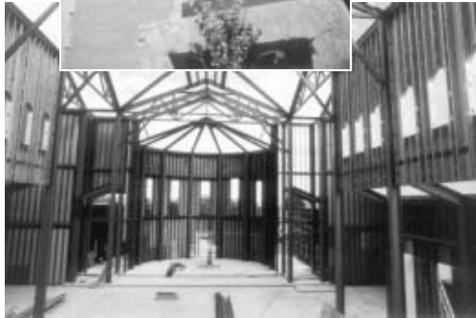
The steel structure of the church and sanctuary as it appeared in January, 2000.