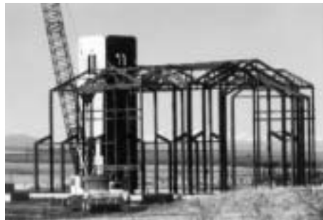
(Left) The steel shell of St. Isidore's as it appeared in December, 1999, looking across I-70 to the northwest, with the Rockies in the background.