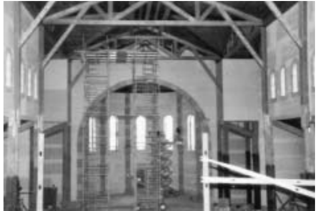
An interior view of the sanctuary taken in March, 2001. The stone worker on the lift, setting mortar between the stones in the apse, can barely be seen. The interior finish was at that time 70% completed, including the double layer of dry wall.