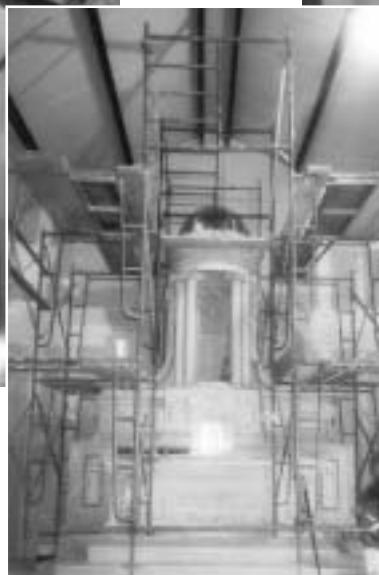
The main altar nears completion.