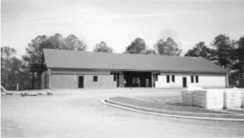
The exterior aspect of the church building as seen from the parking lot three months ago.