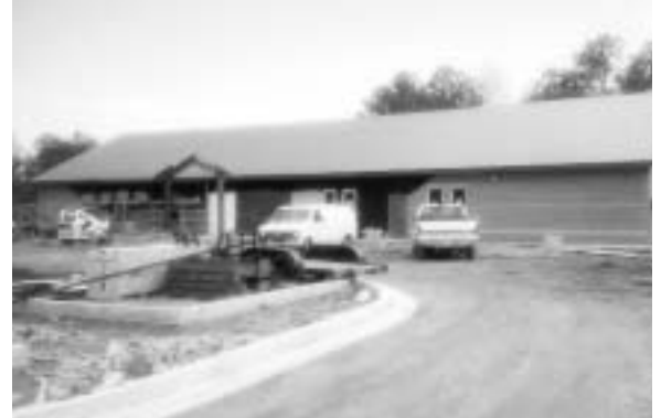
A more recent view, after the exterior had been clad with red brick.