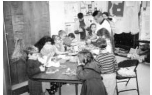
Children busy at work preparing posters and flags for the occasion