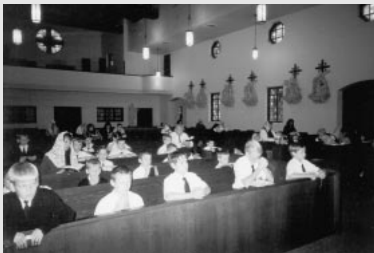
An unexpected snap shot of the children and their teachers assisting at Mass illustrates the different expressions that piety can have.