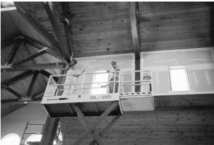
Painting the interior dry wall at 50 feet up, at the junction between the nave and the transept.