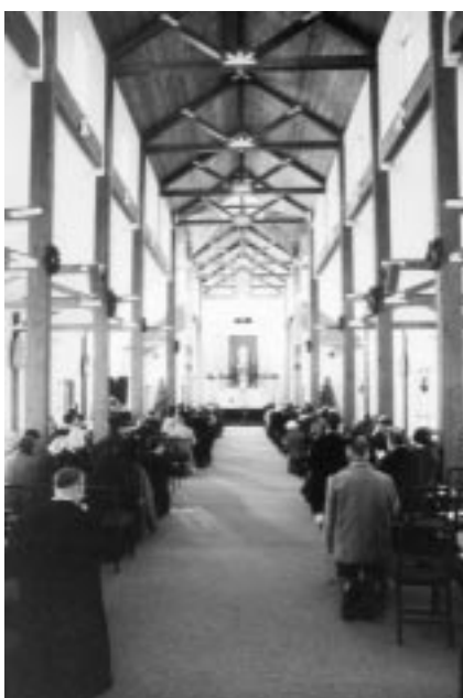
The faithful devoutly assist at the prayers at the foot of the altar, kneeling on soft carpet and sitting on chairs until the tile floor and pews can be installed. The magnificent dimensions of this church draw all eyes to the altar and to the Sacred Heart.