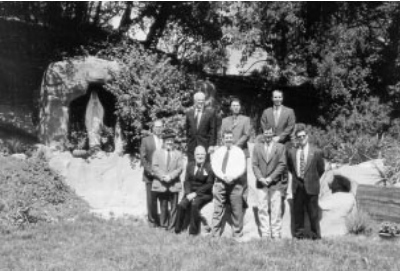
The new members of the Holy Name Society, wearing their pins proclaiming the Chi-Rho, the first two letters of Christ's name, in front of the grotto of Our Lady of Lourdes on the retreat center property.

took advantage of this opportunity to show their leadership of the retreat center chapel by professing their Faith and committing themselves to oppose obscene speech, and to lead their families in the observance of the duties of our Catholic Faith, and in particular in the respect of authority.