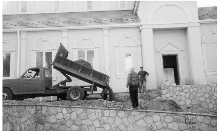
Building the retaining walls and handicap-accessible ramp, with an entrance under the new bell tower.

in order to obtain the necessary occupancy permit, and a temporary altar was installed. The first Mass to be celebrated was at midnight on Christmas, just two months after the original deadline. When funds are available the carpet will be replaced with tile, the sanctuary will be remodeled and a new altar constructed to match the magnificent Romanesque architecture of the building. The formal dedication will take place when these important details have been completed.