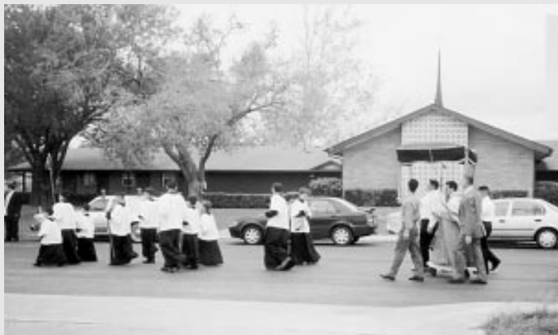
The procession returns to file past St. Joseph's church and academy building. The faithful follow.

Blessed Sacrament in honor of Christ the King, accompanied by many colorful banners made for the occasion, followed by Benediction of the Blessed Sacrament. The whole ceremony was followed by the customary All Saints' party.