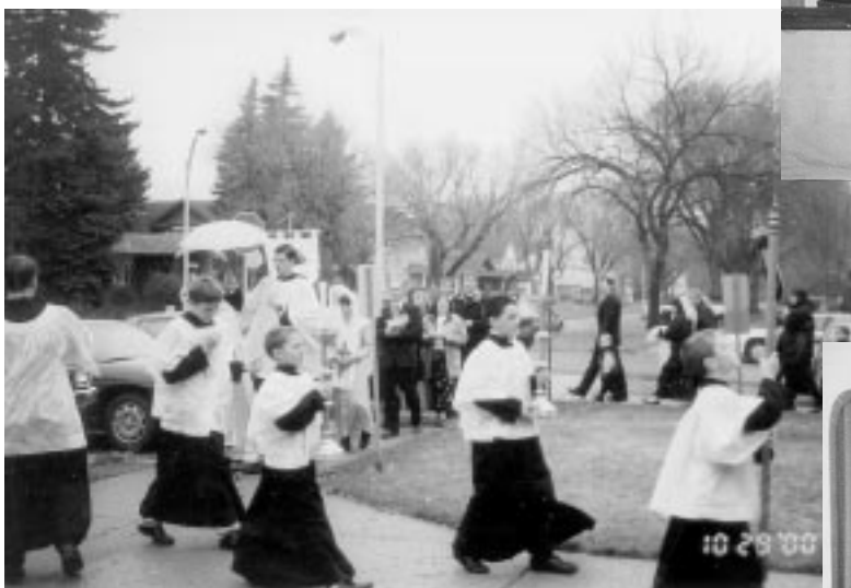
An outdoor procession of the Blessed Sacrament for the feast of Christ the King.

After Mass on Sunday November 5, the children presented their favorite saints to the whole parish in the church basement.