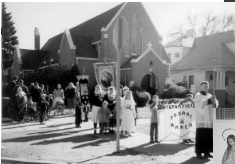
On Saturday October 7, the parishioners held a public Rosary March to request the longed for consecration of Russia to the Immaculate Heart. Here they can be seen about to leave in front of St. Michael's.