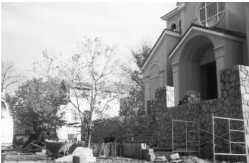
The new masonry work leading up to the main entrance of the new church.

It was in the early 80s, when St. Thomas Aquinas Seminary was located in the present facilities of St. Ignatius Retreat House in RIDGEFIELD, CT that the plan was formulated to construct a magnificent Roman basilica style church, large enough for Seminary ceremonies and especially for Masses of ordination. This project had to be abandoned in 1983 when the nine sedevacantist priests betrayed Archbishop Lefebvre and left the Society. The growth that followed, thanks to God's blessings, made it obsolete, since in 1988 the Seminary had to acquire a much larger facility in Winona to accommodate the growing number of seminarians.