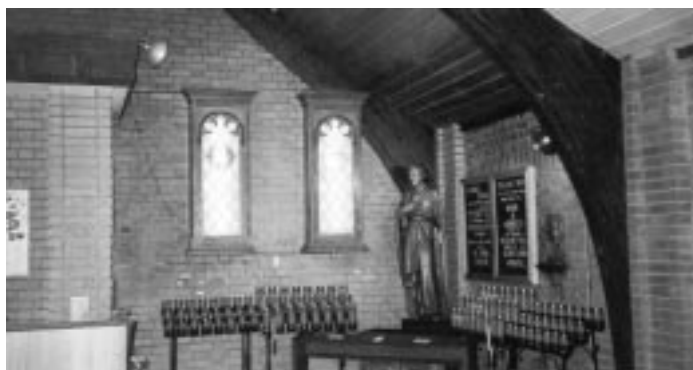
The shrine for St. Jude where the faithful who visit leave their special intentions and light candles.