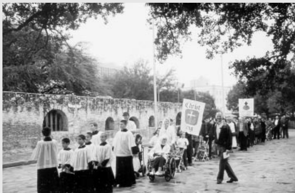
The procession sets out, singing the Litany of the Saints