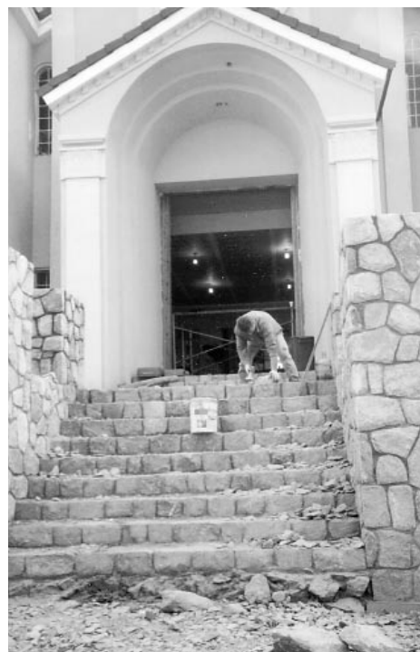
Masons complete the main staircase going up into the new Christ the King church.