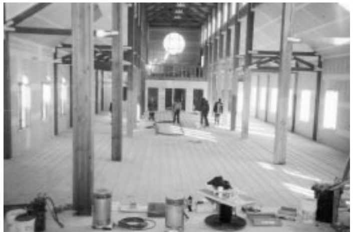
Installation of radiation heat in the floor. Hot water is pumped through these small tubes, from a boiler in the basement. The view is taken looking back towards the main entrance.