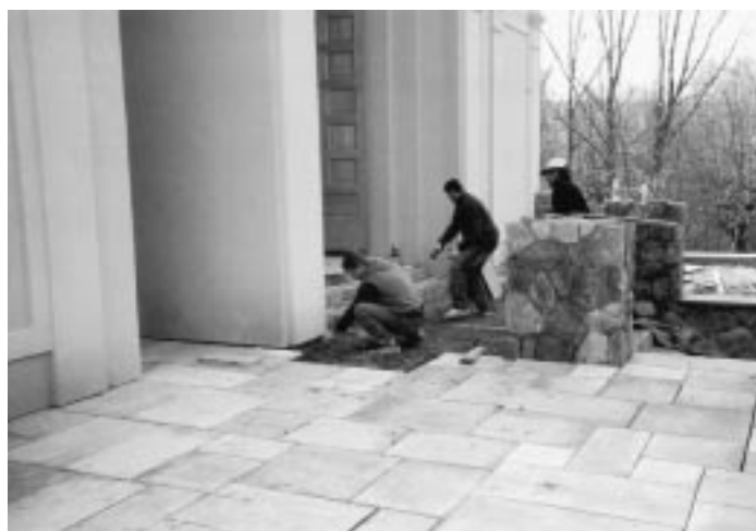
Completing the landing in front of the entrance to the church.