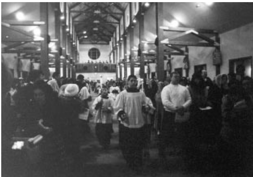
Finally, Father processes in, preceded by the altar boys, to celebrate the midnight Mass, filled with gratitude.