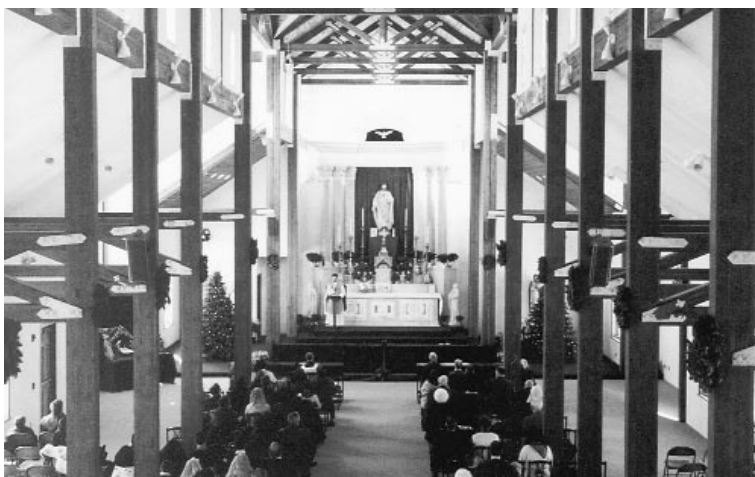
A zoom-in from the choir loft while Father preaches his homily.