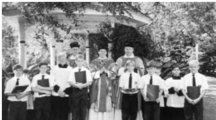
The Fathers accompanied by the altar boys and boys' choir, who all students at Queen of Angels Academy in Dickinson, and who gladly sacrifice the weekend in honor of St. Jude. This shot is taken on the shrine grounds. In the background can be seen a cross, marking the place where the new cemetery was blessed.