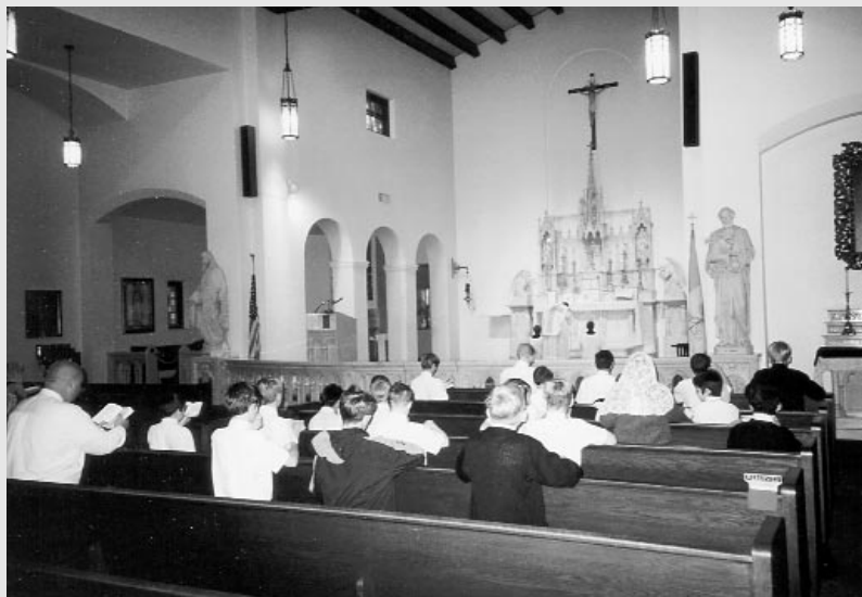
The boys' side of the church assists at Mass in Queen of Angels church.