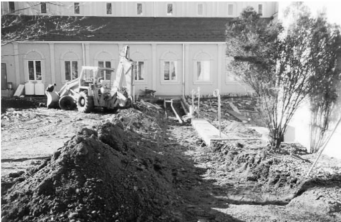
Building a concrete sidewalk to the parking lot.