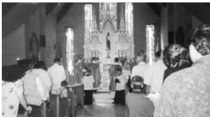
The faithful stand to assist at the Last Gospel at the end of Mass.