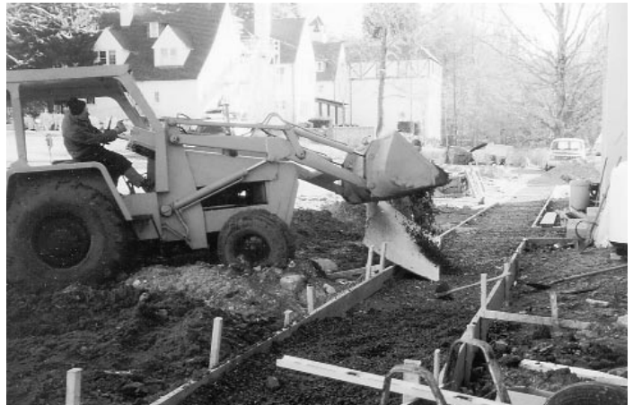
Building a sidewalk along the side of the church to the St. Ignatius Retreat House, seen in the background.