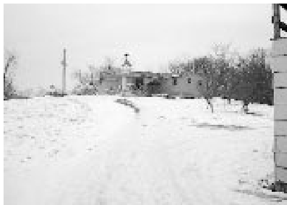
A view of the recently enlarged chapel of Our Lady of Mt. Carmel on the Pfeiffer family property just outside of Louisville.