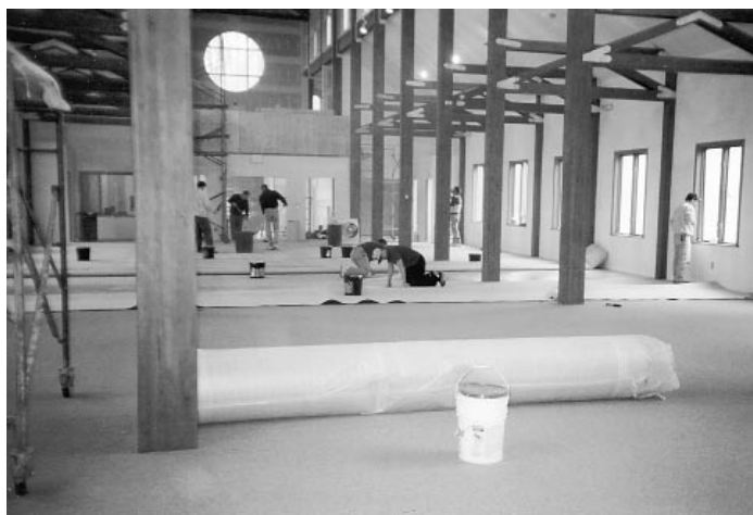
The laying of temporary carpet throughout the church, in order to meet up with fire regulation codes for occupancy. View towards the main entrance.