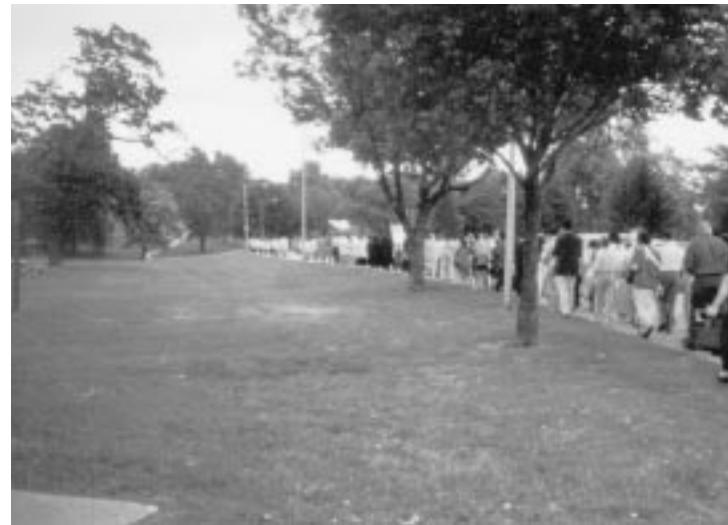
The procession proceeds along the Paseo and through Troost Park.