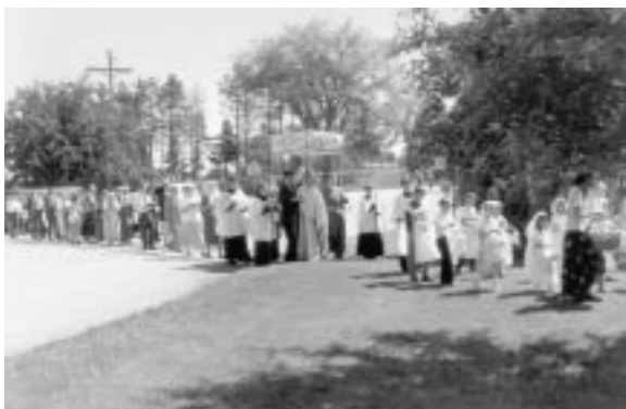
Father James Peek carries the Blessed Sacrament, preceded by the Eucharistic Crusaders and children throwing flower petals before their Divine Lord.

following the feast, namely June 17. The High Mass was followed by a procession in honor of the Blessed Sacrament, Benediction on a outdoor altar and final Benediction back inside the chapel. The whole ceremony was followed by a potluck celebration.