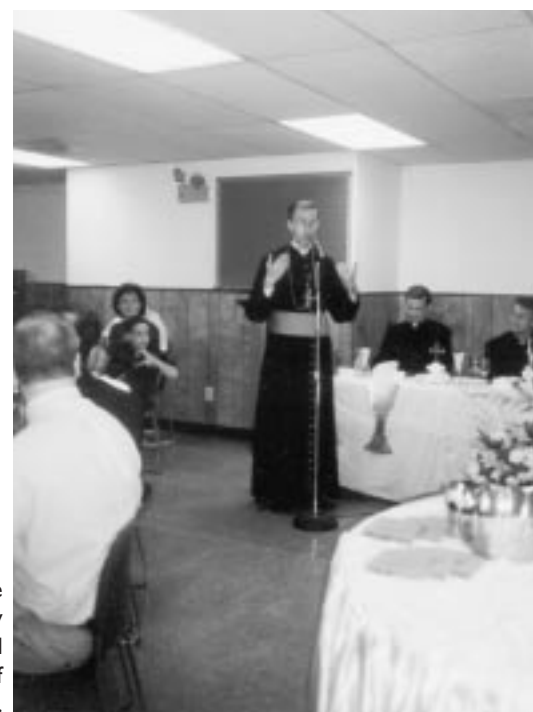
The bishop honors the faithful with a few words of wisdom and souvenirs of Archbishop Lefebvre.