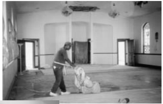
Sanding of the church floor before it could be refinished.