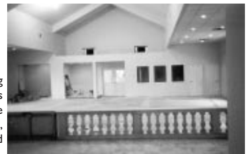
Looking backwards towards the cry room, baptistery and confessionals.