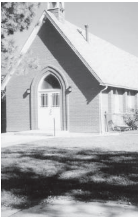
The very small chapel of Our Lady Help of Christians in Denver, which is a marked contrast to the magnificent church in Watkins. Sunday Masses are for the time being still being celebrated at Our Lady Help of Christians.