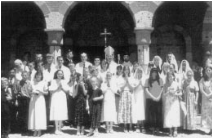
The bishop and the confirmands in front of the church portico.