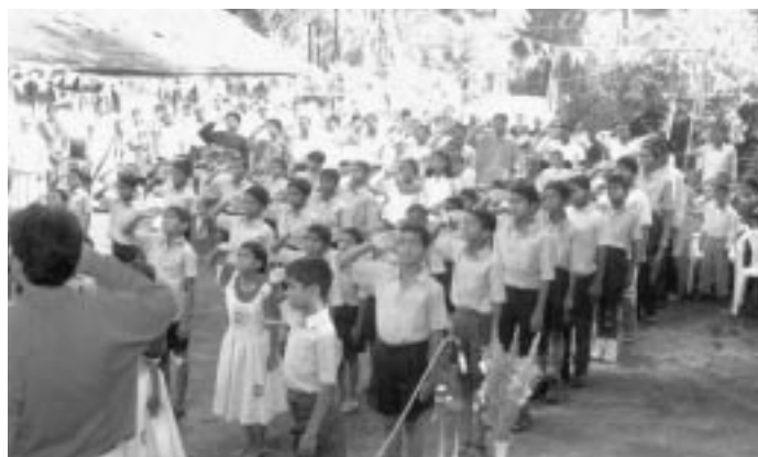
The whole orphanage salutes the flag at morning roundup.