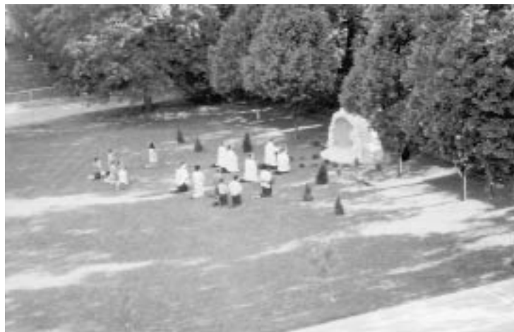
The Rosary as seen from the roof of the Regina Coeli House.