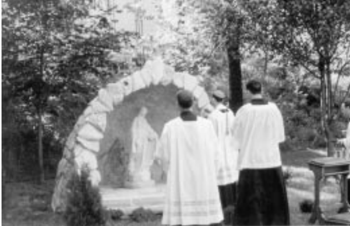
The bishop blesses the statue of Our Lady in the Regina Coeli House grotto.