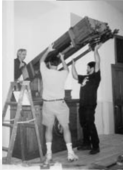
Men of the parish erected the wooden altar, salvaged and brought down from Minnesota.