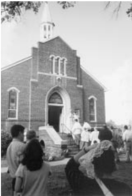
The bishop leads the faithful into the new St. Anthony's church, as it is about to be blessed on the inside.