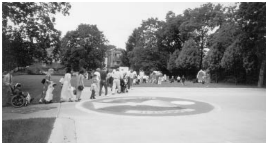
The faithful arrive at Regina Coeli House to adore their Eucharistic Lord on the altar set up on the grass. The girls of St. Vincent's Academy had made the sawdust ground image in honor of the Holy Eucharist, saying Gloria tibi Domine .