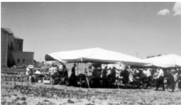
The picnic afterwards, conducted under picnic tents to protect from the sun, but not from the wind.