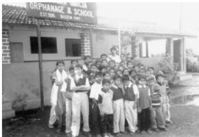
Some of the orphans of Gonzalo Garcia Orphanage outside their school building.

Donations for India or for St. Gonzalo Garcia Orphanage may be sent via the District Office. However, include a special note that it is for Gonzalo Garcia orphans, if this is your intention, to make it clear.