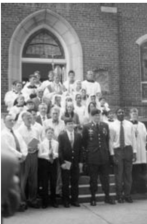
After the ceremony, the confirmands and their sponsors pose with the bishop on the front steps of the church.