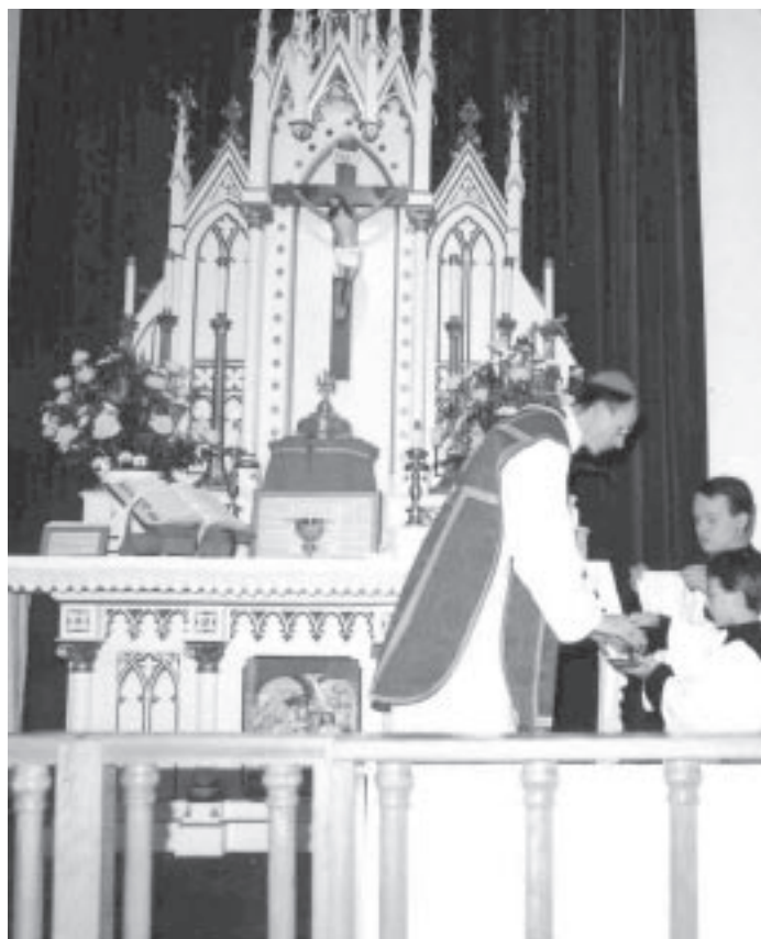
The bishop celebrates a weekday Mass at the chapel of Our Lady Help of Christians, in Denver.