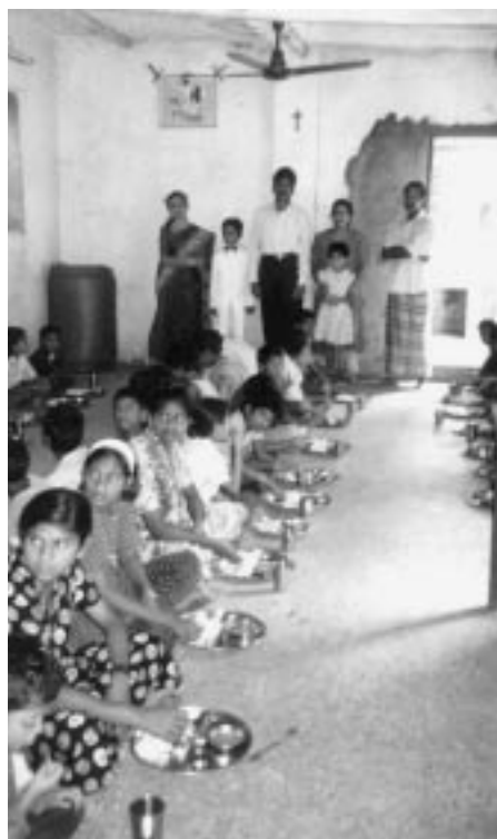
The girls sit on the floor to eat their meager fare.