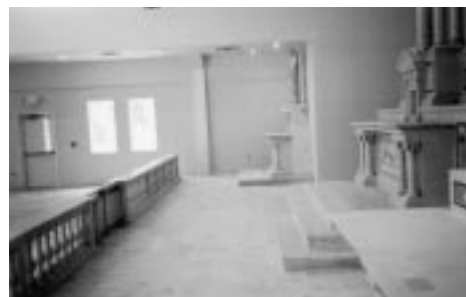
A side view of the sanctuary.