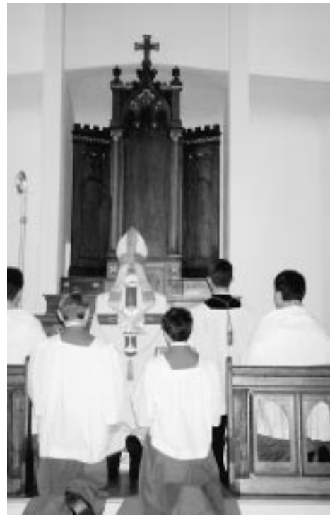
The bishop kneels before the altar during the singing of the Litany of the Saints .