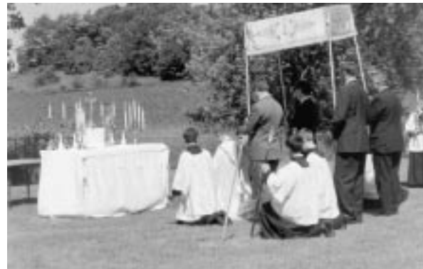
Benediction prayers recited at the outdoor altar.