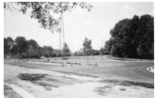
Another view of the parking lot, with all the trees and shrubs required by Roswell city codes.