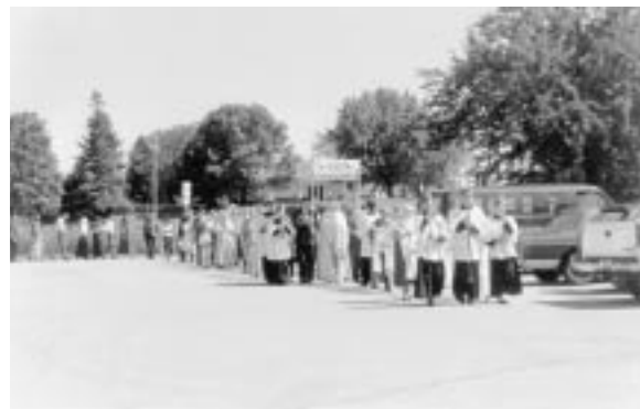
The altar boys lead the procession to the parking lot to the altar of repose on the nearby grass field.