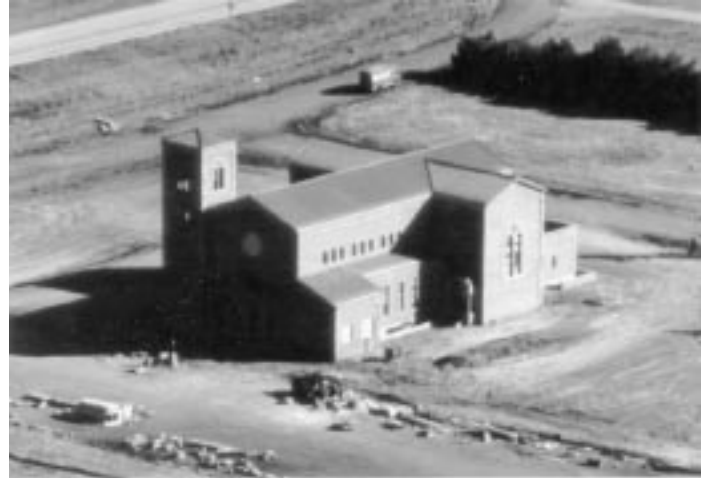
An exterior view of the church, showing the service road leading to it, that parallels I-70.