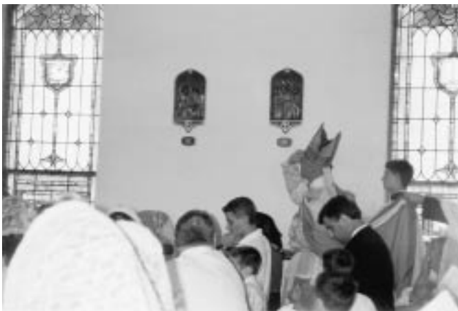
The blessing of the interior walls.