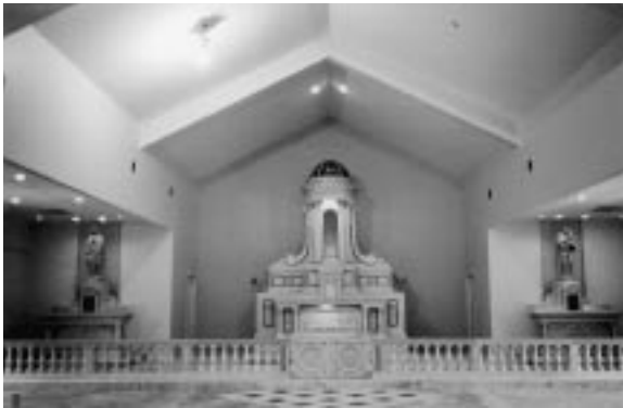
The finished sanctuary of St. Michael's, with its marble altars, marble communion rail and marble floor. St. Michael's had stored these magnificent altars for ten years before being able to build a church worthy of them.