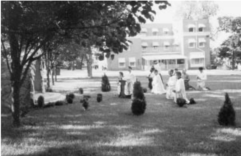
The members of the community recite the Rosary with the bishop in front of the grotto, after the blessing.