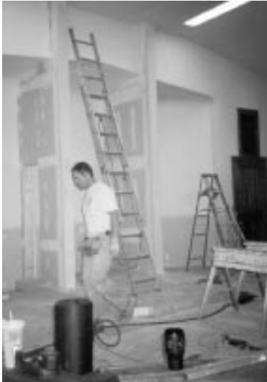
After tearing out the protestant stage, the men work on building a platform and predella for the altar.