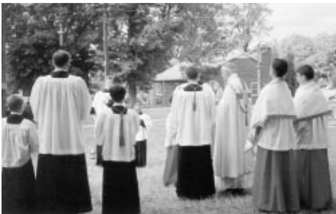
The bishop and the altar boys. The church rectory can be seen in the background.