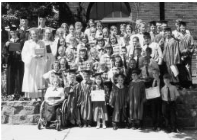
Graduation day in front of Immaculate Heart of Mary Church. The 12th grade graduates are on the left, the 8th grade graduates on the right, and the kindergarten graduates in front, together with all the students of Immaculate Heart of Mary Academy.