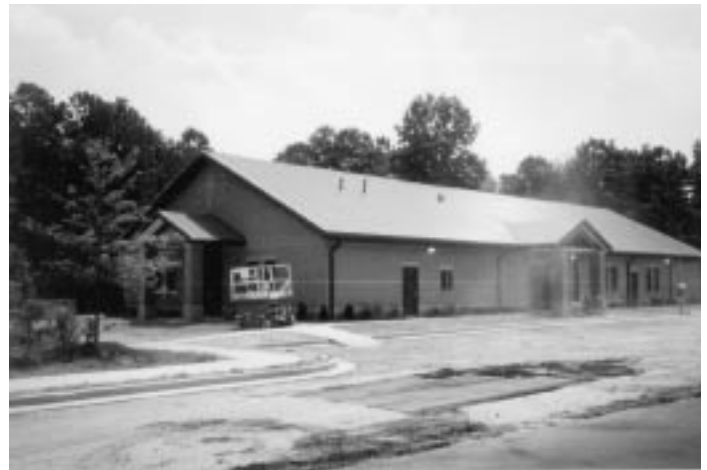
A view of the exterior of the building, as it nears completion. It shows the front entrance into the parish hall area, and the side entrance, which opens directly into the back of the church area. Note that the extensive black top parking lot required by code was as then not yet completed.

The three year construction project for ST. MICHAEL'S in ROSWELL, a northern suburb of Atlanta, is finally drawing near to a close. The years of preparation and the year of construction have been stressful, but are more than recompensed by the magnificent new church facility for Tradition in the southeast. The complex includes not only a church to seat nearly 200 souls, but also a priest's apartment, catechism rooms, a kitchen, and a meeting area for the faithful. The official blessing will take place on Saturday September 29, and will be performed by Bishop Williamson, assisted by Father Michael Harber, the present pastor, and Father Paul Kimball, his predecessor, who originated the plan to build a new church.