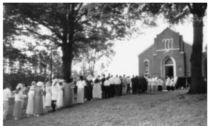
The faithful line up to follow the pontiff into their new church.