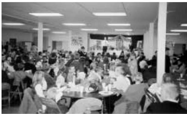
In December Immaculate Conception honored Our Lady of Guadalupe with a luncheon and auction, which raised over $4,000 for Immaculate Conception Academy. The auctioneer is on the stage with treasures to be auctioned around the image of Our Lady of Guadalupe.