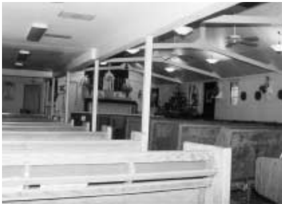
A view of the altar from the new section of the church on the Gospel side.