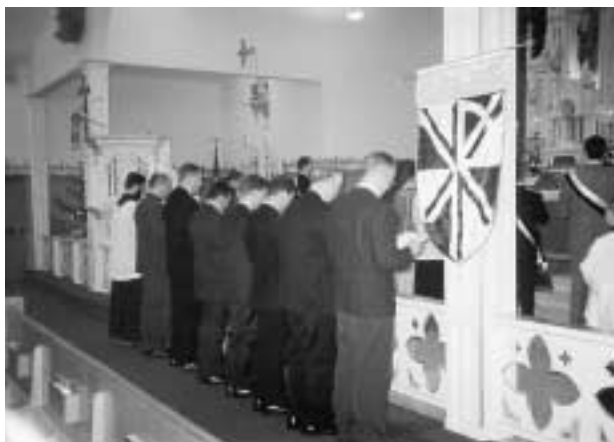
The Holy Name banner, with the Dominican Chi-Rho, by which the men stand to make their pledge.