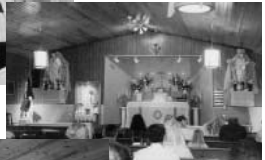
The interior of Our Lady of Perpetual Help before remodeling in 1999.