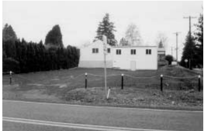
A view across the parking lot to the new addition, with its classrooms, on the right, and the old classroom wing on the left.