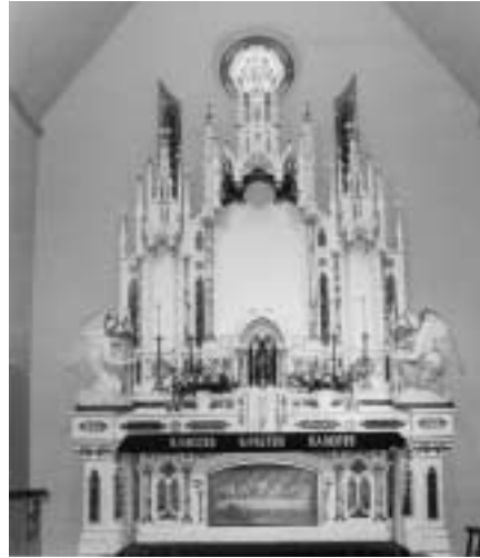
This close-up of the altar does not do justice to the brilliant colors with which it has been decorated, for the greater glory of God.