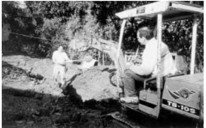
Replacing an old waterline on the northeast side of the retreat house.