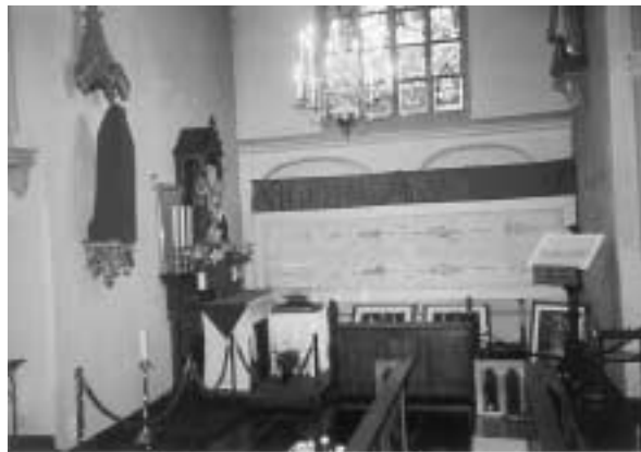
The shroud publicly displayed in the chapel.