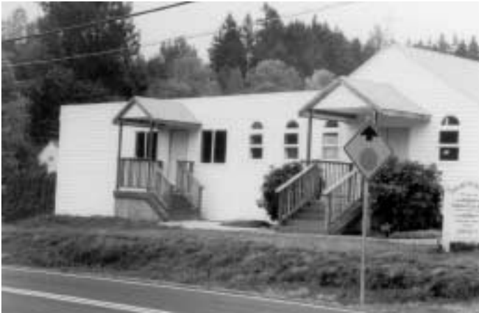
The new main entrance to the humble Our Lady of Fatima church. To the right is the sign and to the left the large flat roof parish hall and classroom addition, just finished last year.