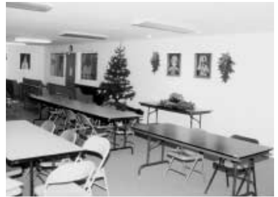
An interior view of the part of the new addition that makes up the parish hall.