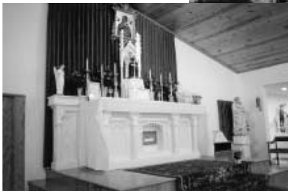
A view of the sanctuary after remodeling and installation of a new altar.