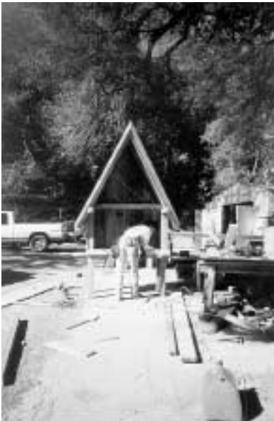
One of the workers erecting a roof and shelter for one of the outdoor stations.