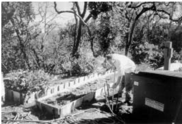
Building the elevated vegetable garden to provide wholesome nourishment for house members and retreatants.