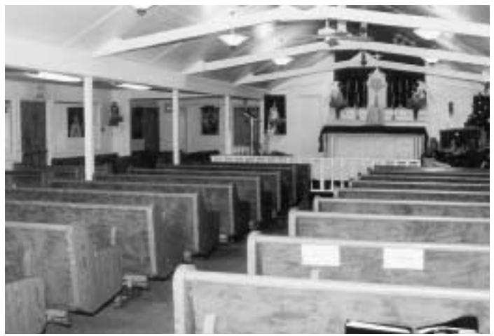
An inside view of the church, which was just recently expanded on the Gospel side. The windows on the left go through to the parish hall, which also functions as a cry room and overflow area.