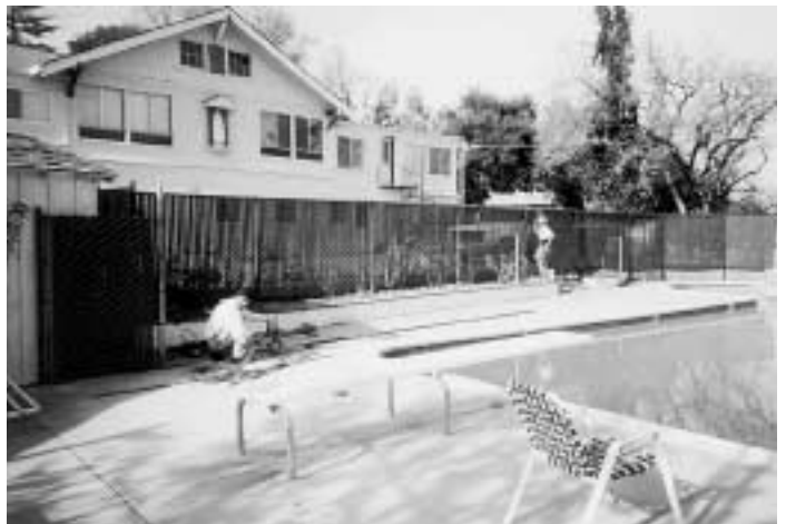
Bring the swimming pool up to code by installing a six foot security fence around it. By the way, this is a fire protection reservoir and is not used during retreats!