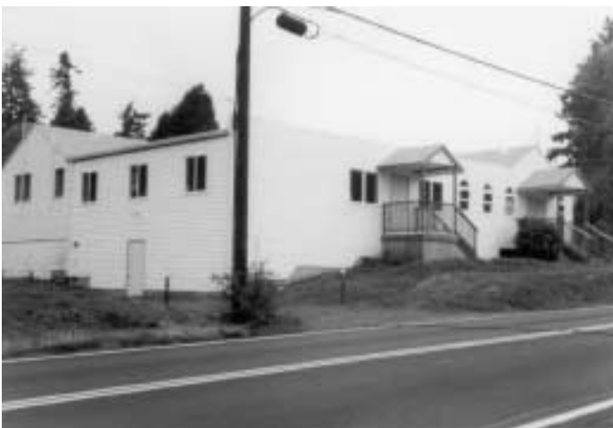
Another exterior view shows the entirety of the new parish hall addition.