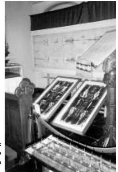
Explanations were given, as well as smaller size photographic negative replicas front and back on which Our Lord's body is clearly seen.